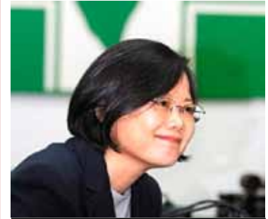
DPP Chairwoman Tsai Ing-wen Perhaps Not So Controversial on Cross-Strait Issues

China Brief is a bi-weekly journal of information and analysis covering Greater China in Eurasia.