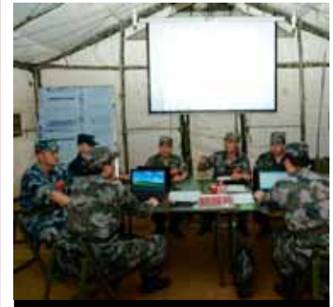
Inside a Command Tent during Lianjiao-2012 Queshan

China Brief is a bi-weekly journal of information and analysis covering Greater China in Eurasia.