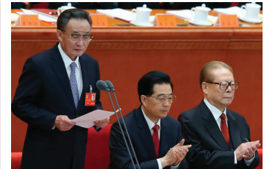
Jiang Zemin (right) played an influential role in the behind-the-scenes politics leading up to the 18th Party Congress.

China Brief is a bi-weekly journal of information and analysis covering Greater China in Eurasia.