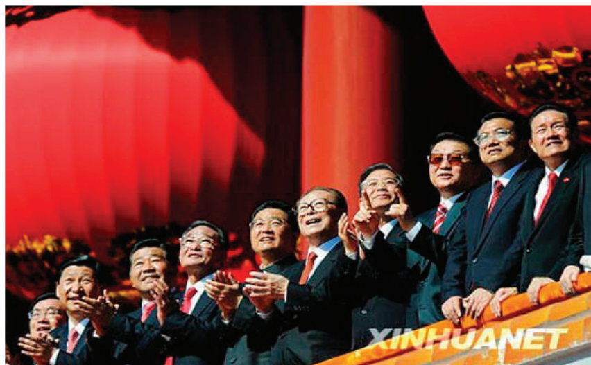
Throughout the tenure of CCP General Secretary Hu Jintao, there were occasional public signs of the continuing influence of Jiang Zemin in the Party hierarchy: Here, Jiang (center right) stands alongside Hu (center left) in the middle of CCP Politburo Standing Committee members viewing the parade celebrating the 60th anniversary of the founding of the PRC.

in a position to shape the membership of the CCP's top policy-making institutions. [4] Elders of lesser rank, while not enjoying the perquisites or the clout of more senior figures, may still seek to leverage their moral authority on policy debates: One such example was seen in 2010, when a group of 23 retired officials (including Li Rui, former personal secretary to Mao Zedong) issued an open letter criticizing the CCP Central Propaganda Department and calling for greater freedom of expression ( Bloomberg , October 13, 2010).