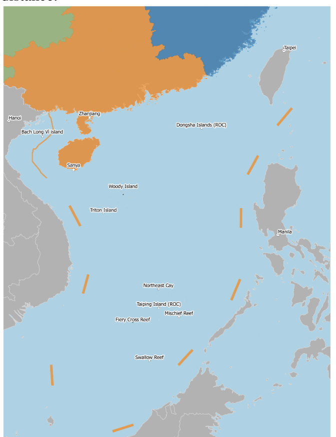
Figure 1 China conducted flights over Northeast Cay in 1980, and Malaysia's Swallow Reef in 1983. Map by Peter Wood. Full size image available at:

According to the assessments, on November 8, 1980, Chinese bombers flew from over Northeast Cay (北 子岛), part of the Spratlys, while Chinese fighters patrolled the Paracel Islands (see map). Similar demonstrations followed in October 1983 over Malaysian-occupied Swallow Reef, this latter exercised paired with a navy frigate and supply vessel. [2] At that time, such an operation would have been a "one-off" to demonstrate political will to Vietnam. China had no real ability to sustain combat operations at such a distance.