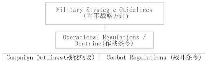
Figure 1: Components of the PLA's Strategy and Doctrine

After the adoption of the updated military strategic guideline of "winning local wars under conditions of informationization," the PLA started working on the revision of its fourth-generation operational regulations around 2004, based on a process of "rolling development," such that new regulations could be issued individually as needed. [6] Although the fifth-generation operational regulations were reportedly complete and only pending CMC approval as of March 2008, their official release was never announced and evidently did not occur ( Xinhua , March 13, 2008). However, certain components of the PLA's operational regulations were issued in 2008, including a "newly revised" Joint Campaign Guidance (联合战役纲要) ( Xinhua , April 16, 2008; PLA Daily , March 18, 2009). [7] The fifth-generation operational regulations have not been approved or released to this day, and their revision was apparently resumed again in subsequent years.