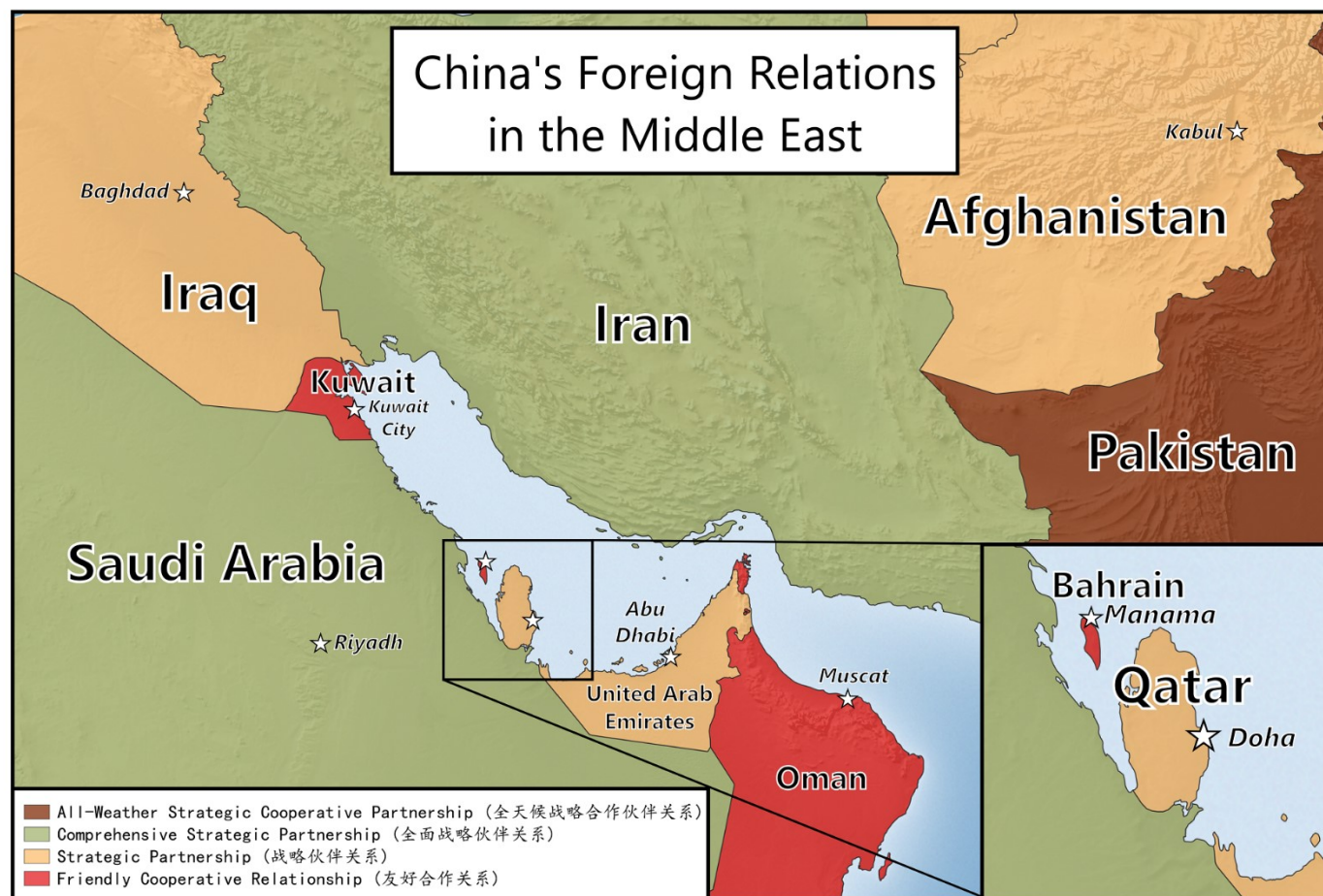
Map by Peter Wood

(BRI) and the China-led Asia Infrastructure Investment Bank (AIIB) were clearly highlighted in the agreement then, and repeatedly emphasized since by members of the foreign ministry ( MFA , May 18).