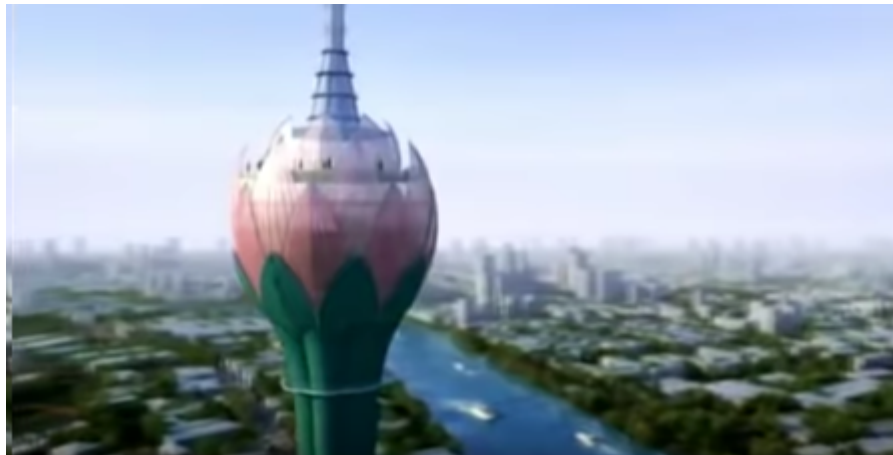
Image: An artist’s conception of the completed Lotus Tower rising over the Colombo city skyline.

One prominent example is visible in Sri Lanka, where China is constructing a 350-meter-high “Lotus Tower” in the capital city of Colombo. Named in deference to the Lotus Sutra, the design of the building draws inspiration from Buddhism, the religion of Sri Lanka’s Sinhalese majority. The Lotus Tower serves as a reminder to Sri Lankans of the two millennia-old Sino-Sri Lankan bonding through Buddhism—as well as their shared destiny through China’s ambitious BRI program ( Colombo Telegraph , June 13 2018). The PRC’s linkage of BRI and Buddhist soft power was made evident at the 2018 WBF, where the use of Buddhism to promote BRI was among the issues on the agenda ( Global Times , October 17 2018).