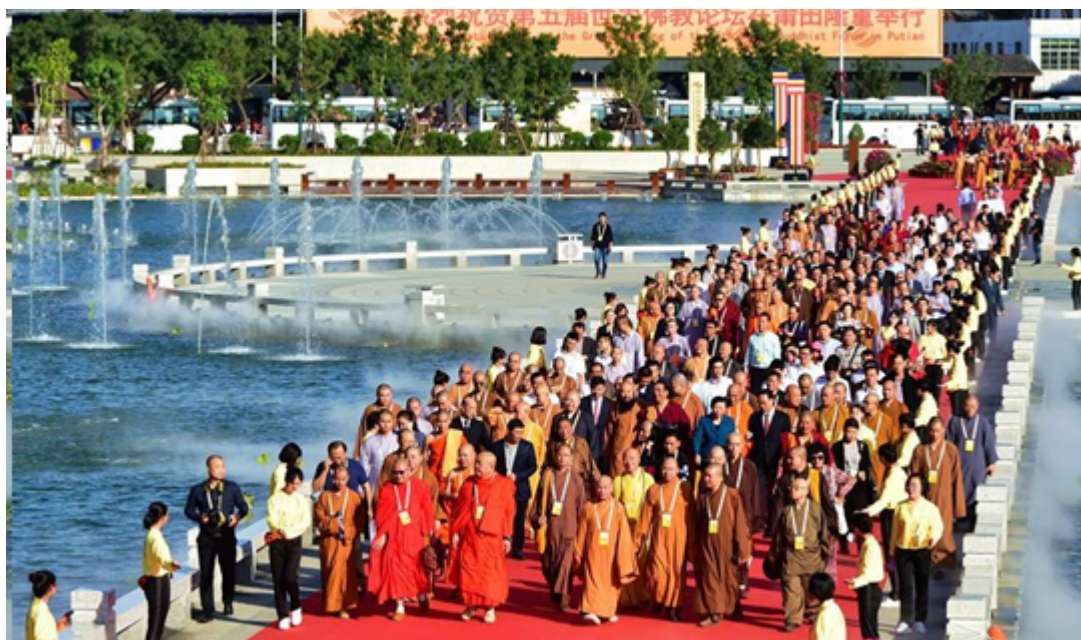
Attendees at the Fifth World Buddhist Forum held in Putian (Fujian Province) in October 2018.

The officially atheist Chinese Communist Party (CCP) has adopted religion for diplomatic purposes: Buddhism's central tenets of non-violence, peace and tolerance make it a rich source of potential soft power, and the cultivation of Buddhist communities is emerging as an important component of the PRC's initiatives in public diplomacy. In addition to hosting the WBF, China has cultivated Buddhist leaders, sent Buddhist relics on tours through Asian countries, and sought to use Buddhist ties to forge closer social linkages in Taiwan and Hong Kong ( see below ). The PRC has further promoted Buddhist public diplomacy efforts in countries impacted by the Belt and Road Initiative (BRI), hoping that Buddhism will soften China's image in the eyes of local populations, and convince other nations that its rise as a global power is a peaceful one.