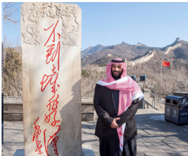
Saudi Crown Prince Mohammed bin Salman poses for a publicity photograph during a visit to the Great Wall of China, February 21, 2019.

Additionally, there is speculation amongst America's traditional Sunni allies that the United States might sooner or later withdraw from the region; this contributes to a belief in some quarters that time is on China's side. PRC state media has sought to play up this theme: commenting on the visit to China by MBS, Global Times stated that "Riyadh used to rely on the West... However, having realized that Western countries are not always dependable, the Saudi Prince is banking on [a] 'Look East' policy" for his country ( Global Times , February 24).