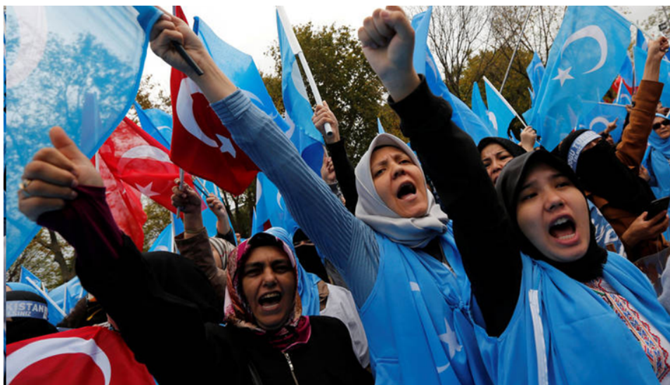
Demonstrators in Istanbul protest against the treatments of Ughurs in China (November 2018).

However, even Turkey's policy has been volatile, and subject to shifts over time. By the end of 2017, the Turkish leadership shifted in a more pro-PRC direction. Following a meeting between China's Minister of Foreign Affairs, Wang Yi, and his Turkish counterpart, Mevlüt Çavuşoğlu, the Turkish minister stated that "Turkey's security is related to China's security." This was accompanied by restrictions on media coverage of the Uighur issue, which was intended to silence criticism of PRC policy ( Reuters , August 3 2017; Besa Center , September 2017).