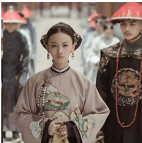
A still image from the popular Chinese television program The Story of Yanxi Palace, which was abruptly removed from state television in late January 2019.

Prior to its sudden disappearance from television in late January, Yanxi Palace had appeared to enjoy some measure of official favor. State media noted in late 2018 that it was the world's most searched-for drama program on Google (ironic praise, as the use of Google's search engine remains restricted within the PRC), and praised the "toughness, independence, and determination" of the show's principal female protagonist ( People's Daily Online , December 27 2018). As late as January 22nd, the show was further praised for its "traditional cultural elements [that] create a new historic angle for foreign audiences to know more about Chinese history... [offering] creativity and passion into historical scenarios with inspiration from modern reality" ( People's Daily Overseas Edition , January 22).