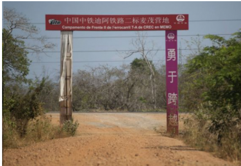
Image: The once-ambitious Tinaco-Anaco Railway Project has been largely abandoned amidst Venezuela's spreading economic crisis.

The Venezuelan crisis has put the PRC-Maduro relationship under a microscope, but difficulties in the relationship are not new. Venezuela once stood out among the PRC's allies, comprising 64% of China's LAC investments from 2010-2013; however, this fell to 18% from 2014-2017. In 2016, China stopped issuing loans to Venezuela entirely ( Reuters , March 20 2018). In other partner nations, China has shown a willingness to restructure debt repayments, and is not likely to ensnare Venezuela in a debt trap. However, the PRC has tightened its checkbook—a step that has less to do with recent calls for Maduro's ouster than with a more general uneasiness that the once free flowing spigots of oil will be turned off by Venezuela's spreading political instability.