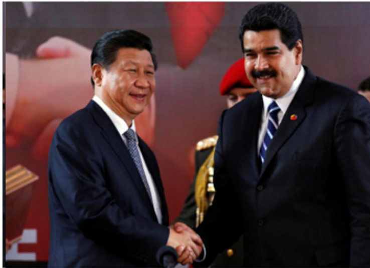
PRC President Xi Jinping and Venezuelan President Nicolas Maduro shake hands during a signing ceremony in Caracas, July 2014.

Amid the ongoing crisis in Venezuela—in which the country faces not only economic meltdown, but also a division between two rival presidents, in the persons of incumbent President Nicolas Maduro and opposition leader Juan Guaido—the People's Republic of China (PRC) remains one of the most prominent and influential nations continuing to recognize the legitimacy of the embattled Maduro government. The PRC has refused to offer any support to the opposition, and has maintained its friendly relations with the sitting government; however, Venezuela's increasing international isolation and free-falling economy carry with them increasing anxieties that Maduro can remain a useful partner. The erosion of Venezuela's economic situation—including its ability to continue oil production—has left China scrambling for ways to respond to the worsening situation of its ally in Caracas.