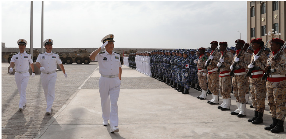
PLA Navy Vice Admiral Tian Zhong reviews Chinese and Djiboutian troops at the PLA Navy support base in Djibouti, August 1, 2017.

On August 1, 2017, China opened its first overseas military base, in the East African nation of Djibouti. This was a landmark event that raised a whole host of questions for Indo-Pacific states: Is Djibouti the first of other bases to come? If so, how many? Where will China build them? How will they be used? Where do they fit into Chinese military strategy? Chinese policymakers and analysts are pondering these same questions. However, they are employing concepts unique to Chinese strategic discourse, and it is essential to grasp these concepts in order to understand how Beijing intends to project military power abroad.