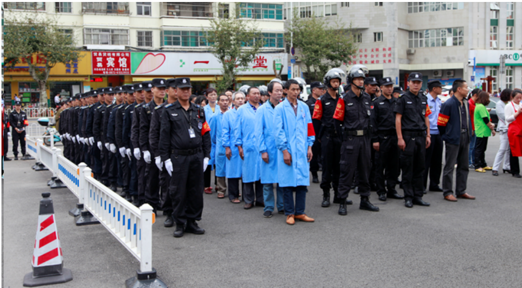
Image: Law-and-order volunteers“ stand in formation at an organization ceremony for security activities accompanying the 19th CCP Congress in Beijing, 2017.

Apart from high-tech surveillance, Beijing has revived Mao’s concept of “people’s warfare” in the domestic sphere, and is recruiting politically reliable sectors of the populace into service as citizen spies. As former Minister of Public Security Guo Shengkun has asserted, the weiben apparatus should incorporate the “new line of thinking and new methodology of ‘the feet plus the Internet,’ [meaning] tradition and technology, specialist work and the mass line” ( PRC State Council , May 24 2016). For example, big cities such as Beijing and Shanghai have in recent years been recruiting large numbers of “law-and-order volunteers” ( zhī‘ān zhìyuǎnzhe , 治安志愿者), a corps of sanctioned vigilantes charged with providing weiben -related intelligence to local authorities. Beijing boasts up to 1 million such volunteers, most of whom are concentrated in the two populous districts of Chaoyang and Xicheng.