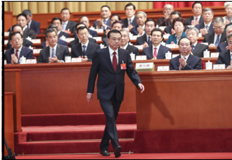
Image: PRC Premier Li Keqiang walks to the podium to deliver the government’s annual work report during the National People’s Congress in Beijing, March 5th, 2019.

During each year’s full session of the NPC, it has become standard practice for the People’s Republic of China (PRC) Premier—the official in charge of the PRC State Council, and the leading figure in managing national macroeconomic policy—to present a lengthy “government work report” ( zhengfu gongzuo baogao , 政府工作报告). This annual report both extolls the state’s achievements over the course of the previous year, and lays out policy priorities for the year ahead. This year was no exception, and the opening of the NPC on March 5th was accompanied both by public release of the report, and a major speech by Premier Li Keqiang summarizing its contents. Li’s speech ranged across a broad range of policy matters, but economic policy was at the core. This year, Li’s comments were noteworthy for hinting at deep concerns regarding the linkage between the country’s economic direction and the security of the regime.