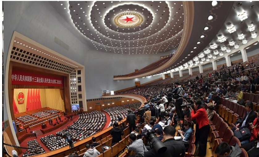
Image: Delegates to the March 2019 annual session of the National People's Congress, which approved a new law governing foreign direct investment in the Chinese economy.

This article provides a summary of the PRC's new FDI law, and seeks to examine why the full overhaul of China's FDI policies has finally been realized (at least at a de jure level). This article is not intended to provide a legal interpretation; [1] instead, it offers discussion of the political environment surrounding the new law, and analyzes why the timing was right for a major overhaul of the state's legal regime governing FDI.