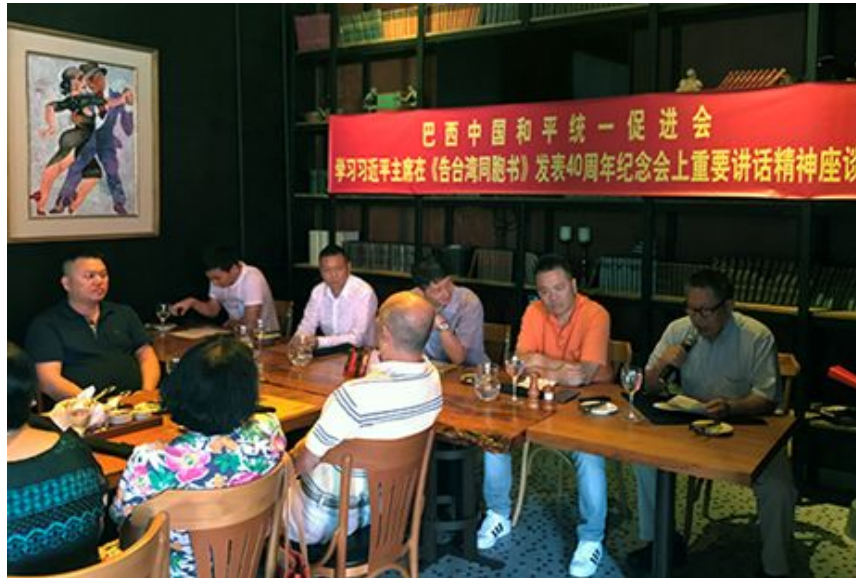
Image: Members of a chapter of the CPPRC in Brazil gather for a meeting on January 13th, 2019. The banner reads: “Symposium to Study the Spirit of the Important Speech of Chairman Xi Jinping Delivered on the 40th Anniversary of the ‘Letter to Taiwan Compatriots’” ( Baxi Qiaowang , January 13).