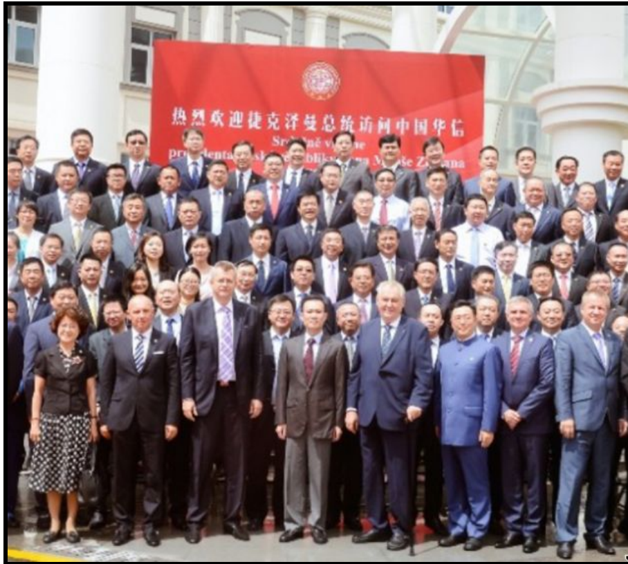
Image: Ye Jianming (front row, center), then-chairman of CEFC China Energy, with Czech President Miloš Zeman (to Ye's right) at CEFC corporate headquarters in Shanghai, Sep. 2015. During the visit, it was revealed that Ye Jianming had been earlier that year appointed as an "honorary adviser" to the Czech President.

a broader pattern: outside the Czech Republic, CEFC has cultivated politicians from Serbia to Georgia, and also in Africa, while helping to advance the CCP's interests at the United Nations ( China Digital Times , June 24, 2018; Sinopsis , March 12, 2018). After a spectacular rise, the company unraveled in similarly dramatic way: in November 2017 in New York, the FBI arrested former Hong Kong politician Patrick Ho (何志平), the head of CEFC's non-profit arm, on charges of bribing politicians at the United Nations and in Africa. Shortly afterwards, CEFC Chairman Ye Jianming disappeared in China. Simultaneously, CEFC has been exposed in Chinese media as an elaborate Ponzi scheme that accumulated billions in debt in China and abroad ( South Sea Conversations , March 29, 2018).