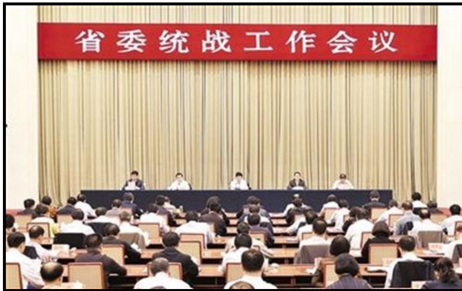
Image: CCP officials in Hebei Province gather for a conference on united front work, November 2015.

However, among Sinologists there has long been an emphasis on the need to use the CCP’s own terms when trying to understand the policies and intentions of the Chinese party-state. [2] If we seek to understand the People’s Republic of China (PRC), we must first endeavor to understand the CCP, its institutions, its policies, and its political terms. The CCP itself is very concerned about the correct terminology ( tifa , 提法) employed in describing political matters. Emphasis on the correct use of terms on politically sensitive topics is an effective way of constraining public debate. [3]