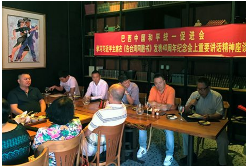
Image: Members of a chapter of the CPPRC in Brazil gather for a meeting on January 13th, 2019. The banner reads: “Symposium to Study the Spirit of the Important Speech of Chairman Xi Jinping Delivered on the 40th Anniversary of the ‘Letter to Taiwan Compatriots’” ( Baxi Qiaowang , January 13).