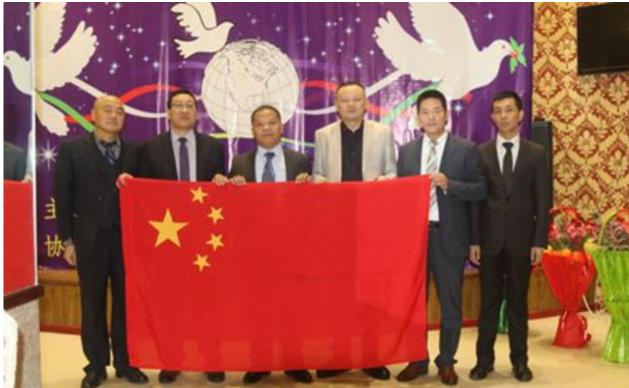
Image: Members of the Kyrgyzstan chapter of the Council for the Promotion of the Peaceful Reunification of China pose with a PRC flag during a conference in May 2018.

Author's note: This article follows from an article previously published in China Brief in February 2018: " The United Front Work Department in Action Abroad: A Profile of The Council for the Promotion of the Peaceful Reunification of China " (February 13, 2018). That article presented evidence that the Council for the Promotion of the Peaceful Reunification of China (CPPRC)—a nominal grassroots civic organization, with chapters in many countries worldwide—is in fact a front organization subordinate to the United Front Work Department of the Chinese Communist Party. [1] Building upon that earlier China Brief article, this article profiles the expansion of international chapters of the Council in countries throughout the world—to include its presence within the United States—and examines some of the ways that the CPPRC is used by the Chinese government as a vehicle for propaganda and influence efforts, and as a means to co-opt and control ethnic Chinese communities abroad.