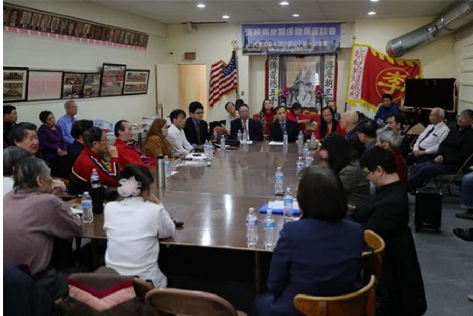
Image: Liu Jun (head of the table, center), the PRC Consul General in Chicago, speaks at a January 5th, 2019 event organized by the "Chinese American Alliance for China's Peaceful Reunification"—the Chicago-area chapter of the CPPRC. Liu praised Xi Jinping's speech of January 3rd for stressing that "the future of Taiwan lies in national reunification and the welfare of our Taiwanese compatriots is intimately connected to national rejuvenation" ( Consulate-General of the PRC in Chicago , January 5).