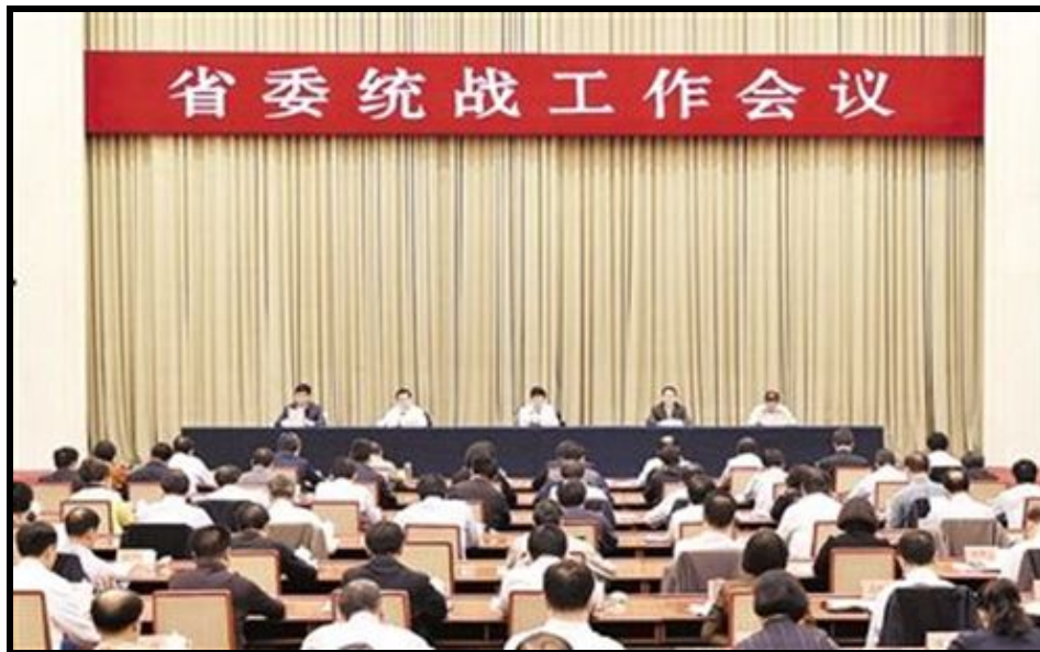
Image: CCP officials in Hebei Province gather for a conference on united front work, November 2015.

However, among Sinologists there has long been an emphasis on the need to use the CCP’s own terms when trying to understand the policies and intentions of the Chinese party-state. [2] If we seek to understand the People’s Republic of China (PRC), we must first endeavor to understand the CCP, its institutions, its policies, and its political terms. The CCP itself is very concerned about the correct terminology ( tifa , 提法) employed in describing political matters. Emphasis on the correct use of terms on politically sensitive topics is an effective way of constraining public debate. [3]