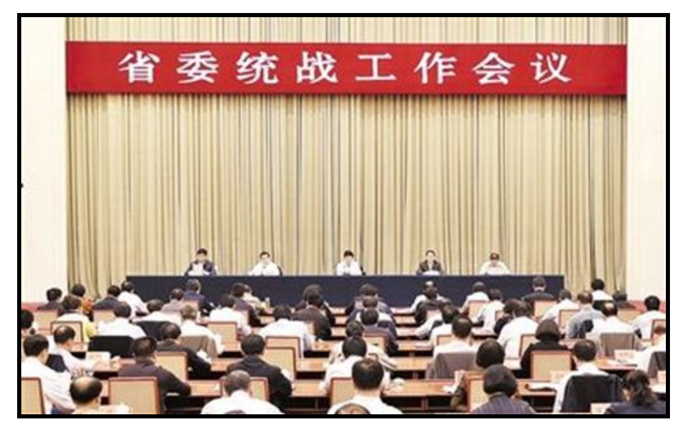
Image: CCP officials in Hebei Province gather for a conference on united front work, November 2015.

However, among Sinologists there has long been an emphasis on the need to use the CCP's own terms when trying to understand the policies and intentions of the Chinese party-state. [2] If we seek to understand the People's Republic of China (PRC), we must first endeavor to understand the CCP, its institutions, its policies, and its political terms. The CCP itself is very concerned about the correct terminology ( tifa , 提法) employed in describing political matters. Emphasis on the correct use of terms on politically sensitive topics is an effective way of constraining public debate. [3]