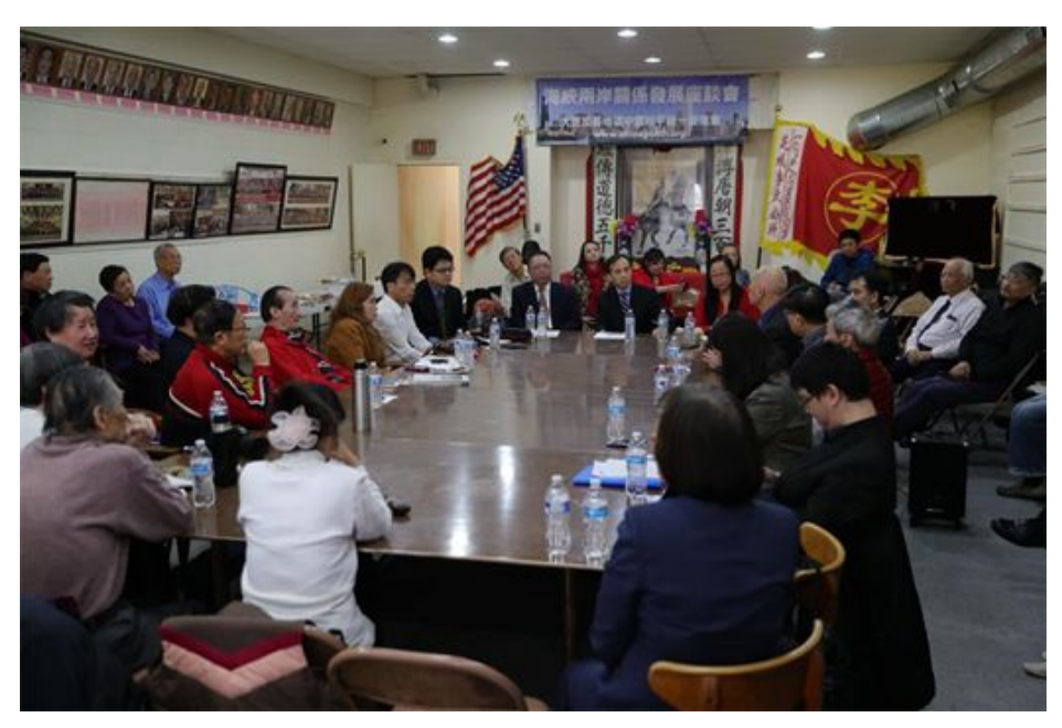
Image: Liu Jun (head of the table, center), the PRC Consul General in Chicago, speaks at a January 5th, 2019 event organized by the "Chinese American Alliance for China's Peaceful Reunification"—the Chicago-area chapter of the CPPRC. Liu praised Xi Jinping's speech of January 3rd for stressing that "the future of Taiwan lies in national reunification and the welfare of our Taiwanese compatriots is intimately connected to national rejuvenation" (<u>Consulate-General of the PRC in Chicago</u>, January 5).