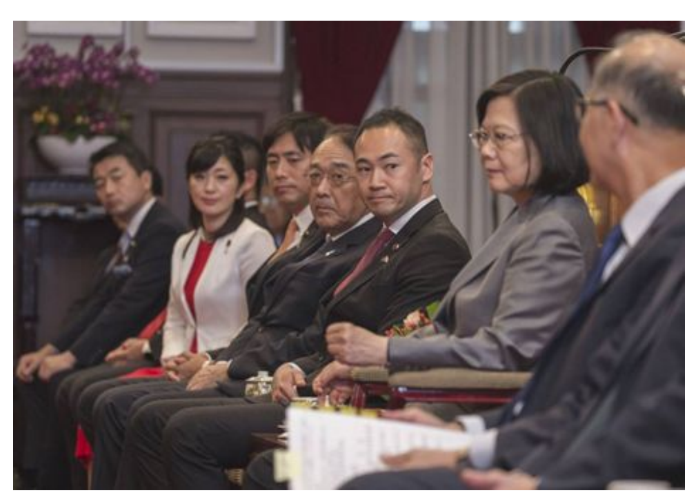
Image: A delegation of parliamentary representatives from Japan's Liberal Democratic Party—to include Suzuki Keisuke (center, fifth from left), an outspoken advocate of closer Japan-Taiwan ties—meets with Taiwan President Tsai Ing-Wen in 2018.

(<u>Japan Times</u>, December 14, 2016). Suzuki has also identified Chinese Communist Party (CCP) influence in Taiwan's democracy as a critical national security threat for Japan. Pointing to the slow erosion of democratic norms and civil rights in Hong Kong, and concerned that similar developments in Taipei could presage an adverse security environment for Japan, Suzuki has repeatedly but cautiously advocated for a Japanese version of the TRA to secure Taiwan's political independence (<u>Epoch Times</u>, April 19; <u>Epoch Times</u>, April 20; <u>The Japan Times</u>, December 14, 2016). This year, Suzuki publicly hinted at the possibility that he would draft a Japanese TRA bill for introduction in the Diet (<u>Liberty Times</u>, April 19; <u>Taiwan News</u>, April 19).