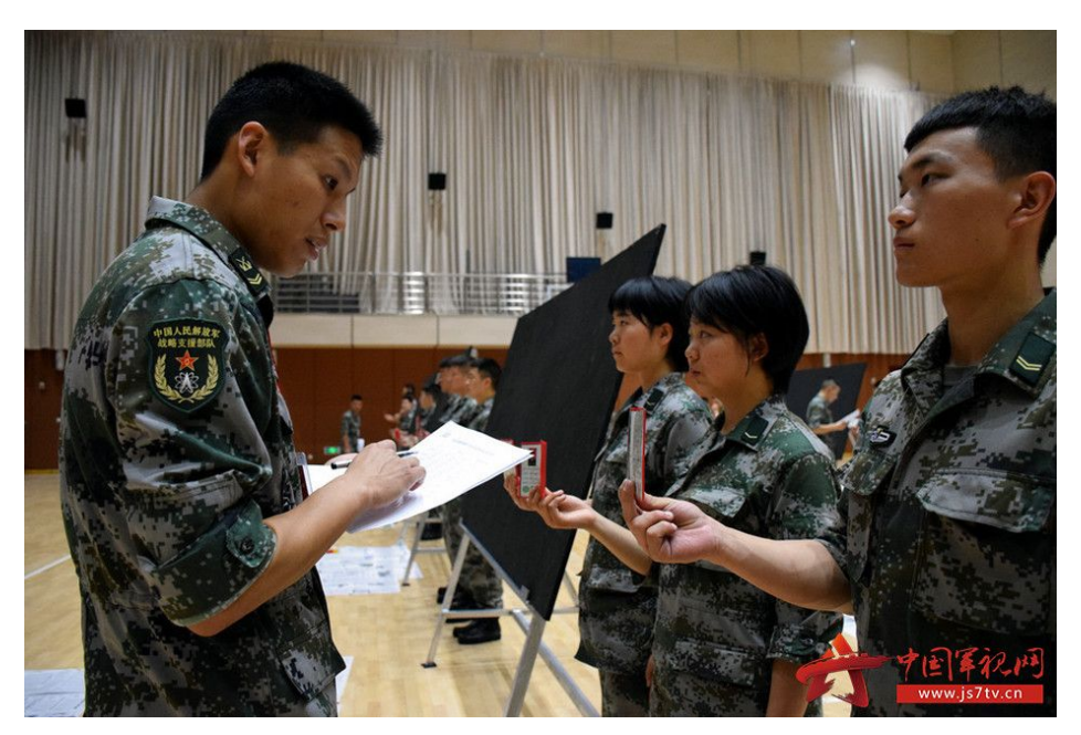
Image: PLA Strategic Support Force personnel present identification at a muster prior to the "Zhuhun-2018" [铸魂-2018] training competition.

Another aspect worth highlighting is the critical role of the SSF in enabling joint operations. The SSF aspires to be the PLA's "information umbrella" ( xinxi san , 信息伞), integrated throughout the full cycle of land, sea, air and missile force operations, from start to finish (People.cn, January 24, 2016).