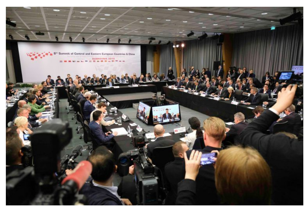
Image: Greek Prime Minister Alexis Tsipras speaking at the CEEC-China ("16+1") Summit in Dubrovnik, Croatia, April 12, 2019.

consideration. The joint understanding of the Greek and Chinese governments was subsequently presented to the 16 European members for the purpose of notification and consultation—but in reality, Beijing's acceptance was the decisive factor in allowing the Hellenic Republic to join the format. [5] Unlike other prospective members—such as Austria between the Belgrade and Suzhou summits, or the Republic of Moldova in an earlier period—Greece has been welcomed as a full member of the initiative. This was done without offering any explanation, or an intelligible blueprint for further admissions into the club, which has raised an additional layer of opacity upon the quasi-institutional mechanisms of the initiative. As was intended from the beginning, China is actually running the 16+1 (now 17+1) show.