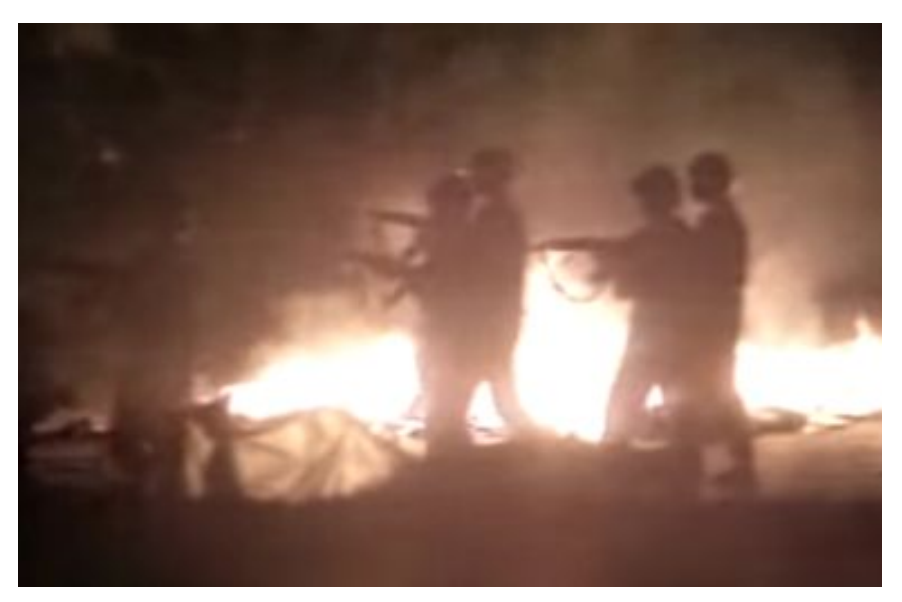
Image: Backlit by flames, PLA troops advance through Tiananmen Square in the early morning hours of June 4, 1989.