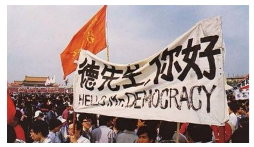
Image: Protestors marching in Tiananmen Square in late May 1989, prior to the military crackdown.

Politburo and other inner sanctums of power within the party (<u>Reuters</u>, November 26, 2012; <u>Asianews.it</u>, July 17, 2013).