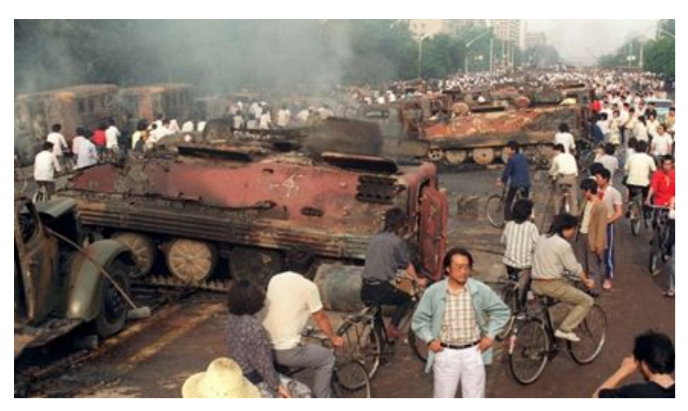
Image: Beijing citizens mill about PLA trucks and armored personnel carriers burned on the night of June 3-4, 1989.

On June 3, there was a final attempt by the CMC to move troops to Tiananmen Square peacefully. At dawn that morning, from the east along Chang An Road, "a regiment of the 196th Infantry Division from Tianjin attempted to enter Tiananmen Square unarmed. They were turned back at the second ring road by citizens and students." [27] Things went downhill fast after that. Troops moved into assault positions early in the morning on June 4 and the assault on Beijing by the PLA began. Even here, after two weeks of political indoctrination, the civil-military split was evident: one unit reported by British military attachés as coming from the 28th Group Army turned weapons over to demonstrators, and their armored personnel carriers and trucks were burned by the crowd. [28]