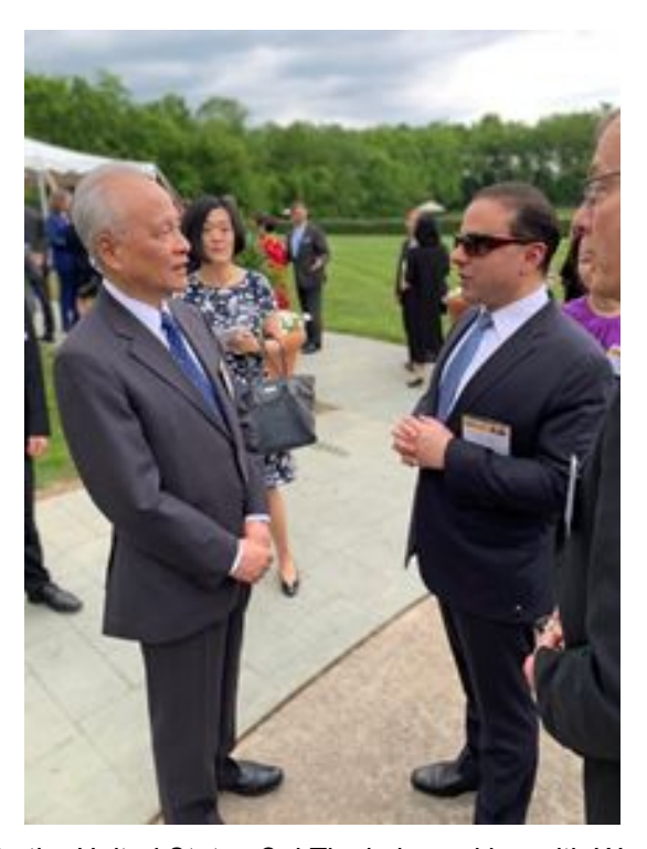
Image: PRC Ambassador to the United States Cui Tiankai speaking with Washington State Lt. Governor Cyrus Habib at the "U.S.-China Governors Collaboration Summit" in May.

Washington State Lt. Governor Cyrus Habib opined that "we are seeing an increased interest of focus on sub-national international relations" between the United States and China (China Daily, May 25). In an interview with reporters for PRC state media, Lt. Governor Habib presented an optimistic view of future U.S.-China trade ties, stating that "I'm optimistic about it, because I don't think that this type of tactic [i.e., tariffs] is going to be sustainable, is not going to accomplish the political goals that either side is thinking that it will... and I think that we will actually get to the negotiating table in the right manner" (CCTV, May 23).