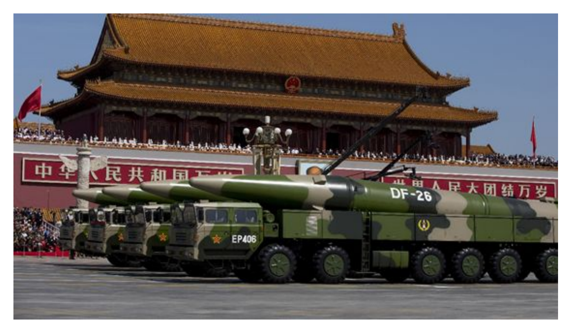
Image: Transporter-erector-launcher (TEL) vehicles of the PLA Rocket Force on parade in Tiananmen Square.

While the PLA has previously focused on quality over quantity in modernization, recent publications suggest that China will pursue both qualitative and quantitative improvements to not only the systems themselves, but also the supporting personnel and infrastructure. As the authoritative 2013 Science of Military Strategy indicates, the PRC's nuclear modernization goals will likely focus on multiple areas, to include: increasing the number of inter-continental ballistic missiles (ICBMs); strengthening its sea-based nuclear deterrent by increasing the number of SSBNs; improving survivability and penetrability, to include developing rapid maneuver and launch, hypersonic glide, and multiple independently targetable re-entry vehicle (MIRV) capabilities; and, finally, enhancing operational effectiveness after a first strike, to include operations planning, unit training, and other infrastructure upgrades. [13] Additionally, the PLA Air Force (PLAAF) may be developing a nuclear-capable strategic bomber and an air-launched nuclear ballistic missile. [14]