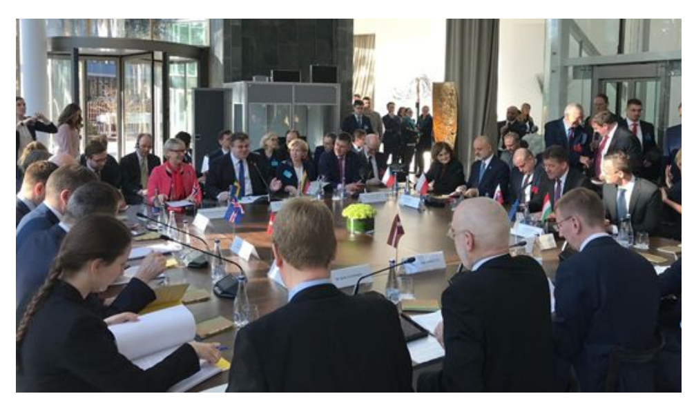
Image: Participants at the April 1st meeting in Palanga, Lithuania involving foreign ministers from the Baltic, Nordic, and "Visegrad Group" countries.

One of the most striking aspects of the meeting was that, amidst this range of European concerns, the character of relations with the People's Republic of China (PRC) emerged as a prominent priority in the agenda. Following the meeting, Latvian Foreign Minister Edgars Rinkēvičs commented on "the rapid growth of China's political, economic and military weight [which] triggers geopolitical change not only in Asia... but also globally," and accordingly called for the PRC "to demonstrate responsibility that corresponds to its influence and benefits [and] to invest accordingly in... the international system and to engage constructively in resolving global challenges." Rinkēvičs further stated that European countries should avoid a "black-and-white perspective" of China as "a threat or an opportunity, a competitor or an ally," but instead should "find the real balance in the relationship with China so that we could protect our interests vis-a-vis China, whilst remaining true to European values" (Baltic Times, April 2).