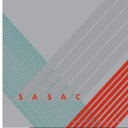
Hao Peng, Director of SASAC