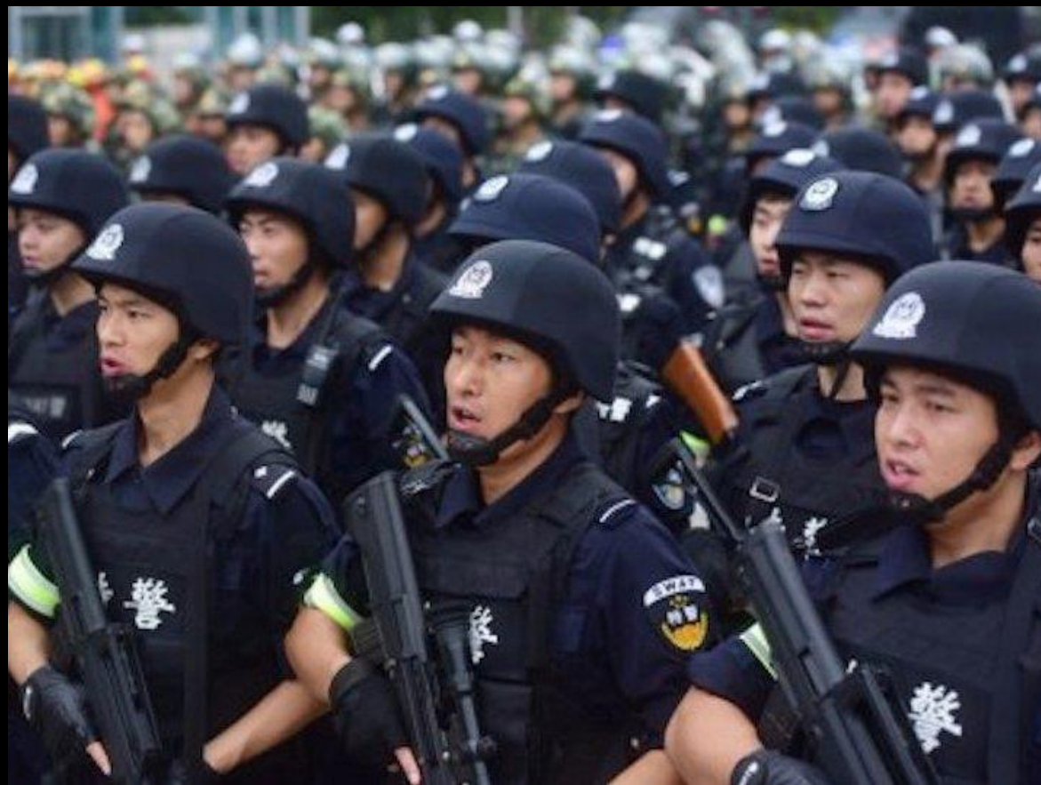
Top cop Zhao Kezhi

Zhao oversees the integration of operations between the Hong Kong and Guangdong police forces; more Guangdong People's Armed Police (para-military forces) has been deployed in the SAR. SAR-based state intelligence operatives are also on the rise.