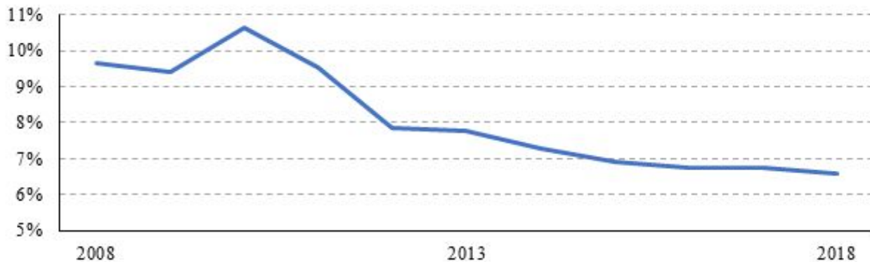
Figure 1. Chinese Annual GDP Growth (2008-2018)

Second, Chinese growth has seen a secular decline over the last decade ( see figure 1 ). The official projected GDP growth rate for 2020 is 6.1 percent ( Xinhua , November 30, 2019), but some Chinese officials have hinted that they expect lower sub-6 percent growth in 2020 ( South China Morning Post , November 14, 2019). This is a noteworthy signal, for CCP discourse has previously identified the benchmark of 6 percent GDP growth as necessary to avoid social unrest ( China Brief , March 22, 2019).