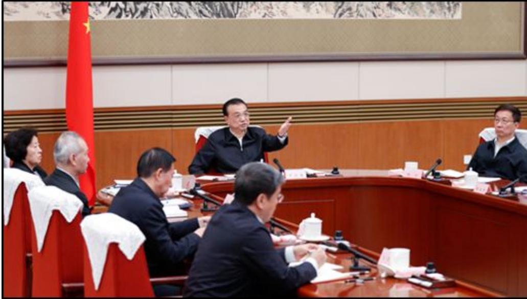
Image: PRC Premier Li Keqiang (center) presides over a November 25, 2019 meeting of senior CCP officials to review plans for the 14th Five-Year Plan (2021-2025). Other figures present include Vice-Premier Han Zheng (right), a member of the Politburo Standing Committee; and Vice-Premier Liu He (second from left), the lead representative in trade negotiations with the United States.

Editor's Note: This is the first part of a two-part article that addresses the ways in which the evolution of China's internationally-focused economic policies are likely to impact—and in many instances, to clash with—the economic policies and interests of the United States. This first part focuses on the policies surrounding the Belt and Road Initiative, China's worldwide program of infrastructure construction; and on the policies that Chinese leaders are likely to adopt as they seek to avoid the "middle-income trap" of stagnating economic growth. The second part, to appear in our next issue, will examine China's efforts to advance usage of the renminbi as an international currency, and to seek a greater role in economic institutions traditionally led by the United States and its European allies.