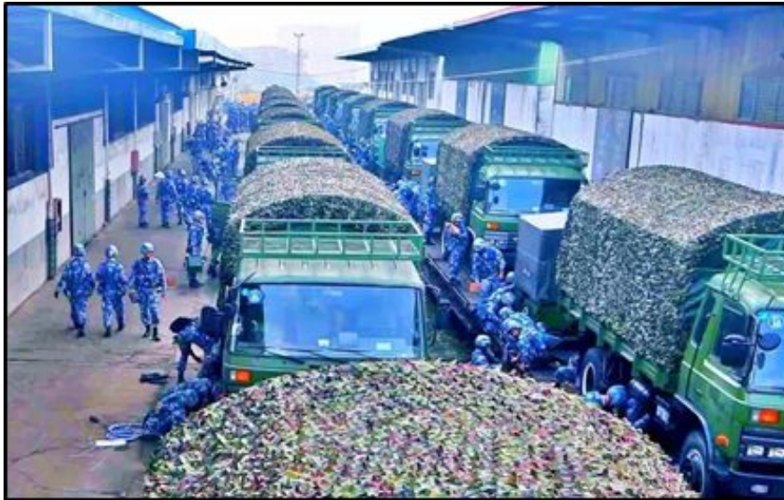
Image: PLAN Marine Corps personnel prepare trucks for a field deployment during the “Ten Thousand Men and One Thousand Vehicles” (萬人千車, Wan Ren Qian Che) exercise, a long-distance force deployment exercise conducted in Yunnan and Shandong Provinces in March 2018.

These exercises were meant to underscore that the PLAN Marine Corps will be tasked with a range of operations beyond amphibious warfare. Training in different forms of terrain and climate conditions is intended to make the PLANMC acquire capabilities similar to those of the expeditionary forces of the U.S. Marine Corps—which through its history has deployed and fought in a range of locations, from the extremely cold Korean Peninsula to the desert environments of the Middle East. Such training also signals that the PLAN Marine Corps will be the vanguard defender of China’s overseas interests, and its involvement in cross-region mobility exercises is aimed at turning it into a rapid reaction force with a variety of transportation platforms at its disposal.