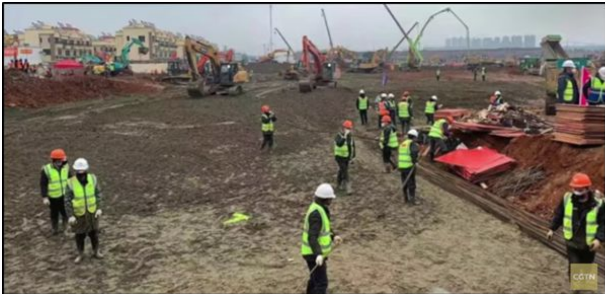
Image: On January 23, workers with the Wuhan Construction Engineering Group began a short-fused project to construct the Wuhan Huoshenshan Hospital, a new 25,000 square meter, 70-100 bed facility to be operated by the PLA. Chinese officials have declared that the hospital will commence operations by February 3.

Besides these quarantine measures, efforts to isolate and slow the spread of 2019-nCoV have also included sending significant financial and medical resources to Wuhan and other affected areas. In addition to the deployment of medical teams from the People's Liberation Army (PLA), China's National Health Commission has dispatched over 1,000 personnel in six medical teams from across the country to the Wuhan area ( World Journal , January 26). The China Development Bank has issued a 2 billion yuan ($288.3 million) emergency loan, while the Ministry of Finance has allocated 1 billion yuan ($144.2 million) towards combating the 2019-nCoV virus ( Sina , January 25). Alongside the official response from Beijing, China's private sector—including companies such as Tencent, JD.com, Lenovo and Xiaomi—has also offered contributions of funds and medical supplies ( SCMP , January 25).