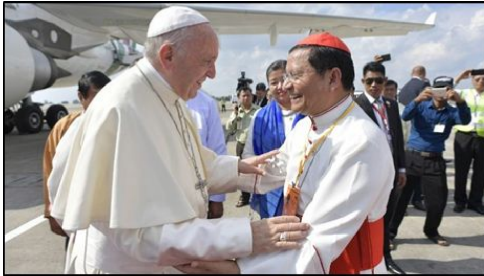
Image: Pope Francis (left) is greeted by Cardinal Charles Maung Bo (right), the Archbishop of Yangon, as the Pope arrived for a visit to Myanmar on November 27, 2017. Cardinal Maung Bo, who is also head of the Federation of Asian Bishops’ Conferences, is one of a number of Roman Catholic leaders in Asia who have been more outspoken than the Vatican in expressing concerns over police brutality and other matters surrounding the crisis in Hong Kong.

In a recent letter to his fellow cardinals, Cardinal Zen lamented that the Holy See was encouraging the clergy to join the CPCA, which he characterized as a schismatic church. Cardinal Zen insisted that the college of cardinals should not passively witness the “murder” of the Roman Church in China ( Life Site , January 8). Evidence is mounting that Zen’s concerns are not misguided: Chinese police reportedly drove a former ordinary bishop and some priests from their parishes this month, after they refused to register with the state-led religious authorities ( AsiaNews , January 16).