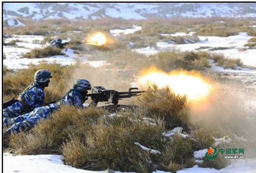
Image: PLAN Marine Corps heavy machine gunners conduct live-fire training during the "Cold Training – 2016 • Korla" (寒训—2016 • 库尔勒) exercise in central Xinjiang, January 2016.