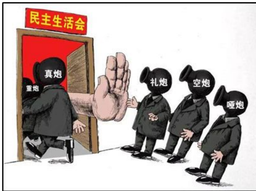
Image: In this cartoon from PRC state media, the blunt communication styles of “heavy artillery” (重炮, zhong pao ) and “true artillery” (真炮, zhen pao ) are allowed into a “democratic life meeting” of party members—while “salvos” (礼炮, li pao ), “firing blindly” (空炮, kong pao ), and “duds” (哑炮, ya pao ) are excluded.

[C]onvene party democratic life meetings to implement party principles and policies, and pass resolutions on situations and some important internal questions for the party branch; as well as to exchange opinions, communicate thought, have honest discussions, develop criticism and self-criticism, help one another, supervise one another, sum up experiences, and integrate ideological understanding [in regard to] work style and work questions amongst one another. In this way, [these meetings] will be beneficial to party conduct, strengthen unity, and bring closer relations between the party and the masses. [3]