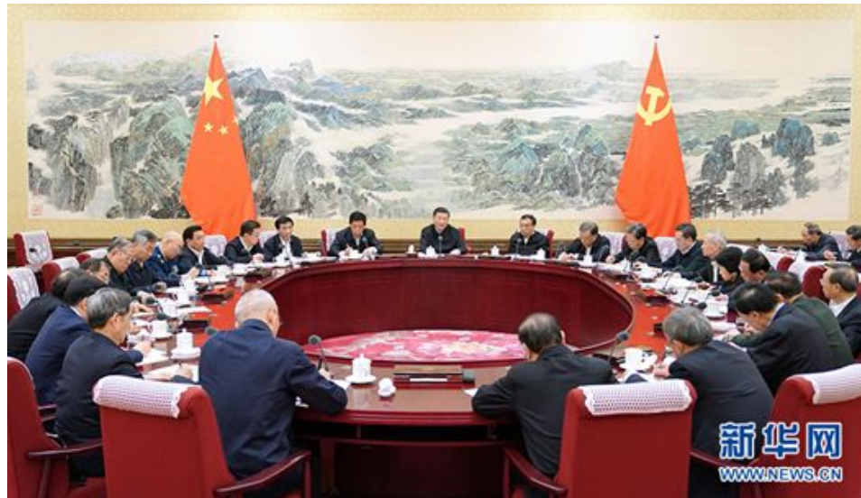
Image: On December 26-27, 2019, the CCP Politburo convened a “democratic life meeting” centered around the propaganda slogan of “Don’t Forget [Our] Original Purpose and Firmly Remember the Mission.” Such meetings have become a regular end-of-year event for the CCP central leadership.

State press coverage of the December meeting was contradictory in nature: on the one hand, it attempted to depict the meeting as a model of collegial free discussion; while on the other hand, reinforcing the ever-growing personality cult of Xi Jinping. The state news agency Xinhua asserted that “the comrades of the Politburo had frank discussions with comrades who shared similar responsibilities,” and described each member taking the opportunity to speak in turn. However, these “frank discussions” revolved around topics such as the need to “study and understand... the important instructive spirit of General Secretary Xi Jinping’s latest important speech,” and unanimous agreement that “upholding General Secretary Xi Jinping as the core of the party center and the core position of the entire party... is the foundational political guarantee for advancing the unceasing development of socialism with Chinese characteristics” ( Xinhua , December 27, 2019). Televised footage of the meeting—as with similar leadership meetings in the recent past—showed Xi speaking while more junior-ranking Politburo members attentively scribbled notes, in stylized displays of subservience and symbolic political loyalty ( CCTV , December 27, 2019).