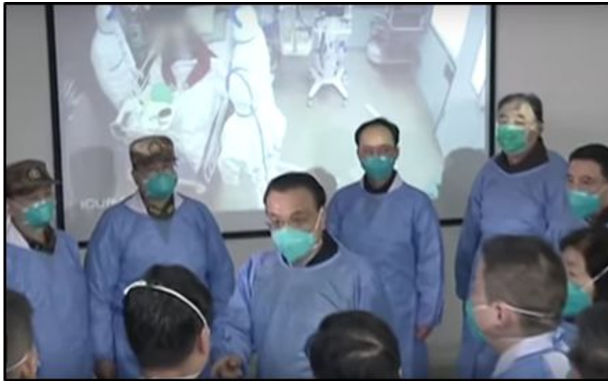
Image: PRC Premier Li Keqiang speaking with local medical personnel during an inspection tour in Wuhan City, January 27.

Editor's Note: Our previous issue contained an initial analysis of the Chinese government's response to the outbreak of a previously unknown coronavirus in the central Chinese city of Wuhan ( The State Response to a Mystery Viral Outbreak in Central China , January 17). Since the publication of that earlier article, the Wuhan virus has proliferated rapidly—in terms of both persons infected and the geographic spread of the disease. In this issue, contributor Ryan Oliver provides an update on the spread of the virus, as well as further analysis regarding the government response at both the local and national levels.