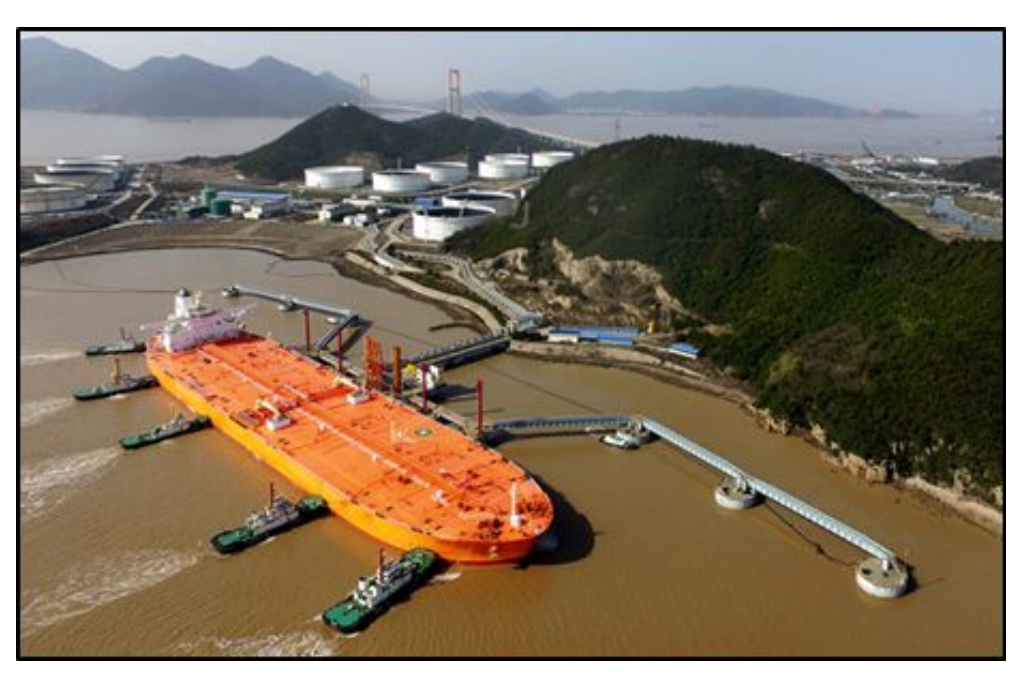
Image: A supertanker unloads oil at a terminal in Zhoushan (Zhejiang Province), February 2018. China is the world's largest importer of oil, and it is therefore seeking closer relations with Gulf Region producers, including Iran. The fact that oil deals are usually denominated in dollars imposes additional transaction costs and exchange rate risks, providing another motivation for the PRC to seek greater internationalization of its own renminbi currency.

February 5, 2018). Most importantly, the dominant dollar confers influence in international institutions, which China lacks despite its economic size. [2] Further, Washington can enact potent sanctions because of the dollar's central role in the global banking system, and Beijing sees itself as a potential sanctions target (<u>SCMP</u>, April 16, 2018). Overall, internationalizing the RMB would increase Chinese capital efficiency by lowering RMB-associated costs and giving Beijing a powerful tool in the global monetary and financial system.