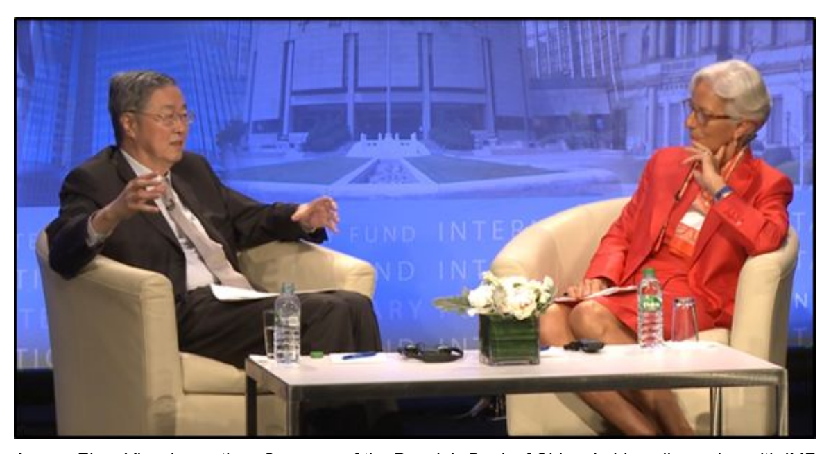
Image: Zhou Xiaochuan, then-Governor of the People's Bank of China, holds a discussion with IMF Managing Director Christine LaGarde following a lecture that Zhou presented to the IMF, June 24, 2016.

The RMB faces a narrow path in displacing the dollar, but Beijing could find a way to loosen capital controls without foregoing state-managed capitalism and industrial policies, especially if nationalists advocating China's global prestige and financial reformers both rally around the project. Washington should expect Beijing to pivot back to RMB internationalization once trade matters are settled. An international RMB would directly supplant the benefits that the dominant dollar yields to the United States. U.S. officials would not take RMB internationalization lightly if it gained momentum.