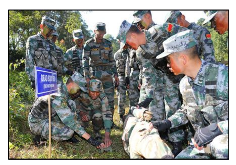
Image: During the China-India "Hand-in-Hand 2019" counter-terrorism exercise, Chinese and Indian soldiers conduct a December 9 training evolution to recognize and disarm a simulated improvised explosive device (IED) trap.