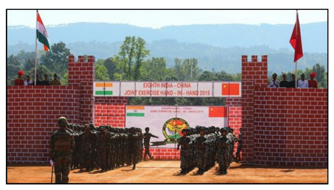
Image: Chinese and Indian troops line up in formation for the opening ceremony of the eighth annual China-India "Hand-in-Hand 2019" Counter-Terrorism Exercise, which was held December 7-20 in the northeastern Indian state of Meghalaya.

not been matched by similar unified action on the ground. This is despite the fact that both India and the PRC are at the receiving end of violence unleashed by terrorists based in the same country: Pakistan.