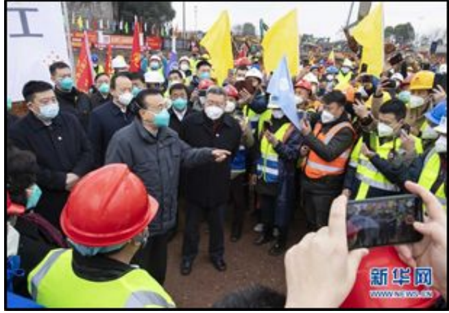
Images: (image left) During a January 27 visit to "inspect and give guidance to epidemic control work" in Wuhan, PRC Premier Li Keqiang meets with medical personnel at the Wuhan Jinyintan Hospital; and (image right) speaks to construction workers at the building site of the Wuhan Huoshenshan Hospital, rapidly constructed in 10 days for use by PLA medical personnel.