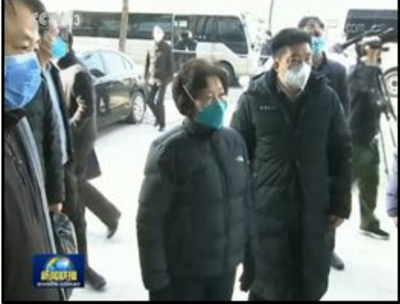
Image left: PRC Vice-Premier Sun Chunlan (second from upper right) meets with local officials during a January 27 visit to Wuhan. Image right: During a follow-on February 4 visit to Wuhan as the leader of a CCP "central guidance group," Sun meets personnel treating patients at a Wuhan hotel requisitioned as a temporary medical facility.

An even more active travel and publicity schedule has been maintained by Sun Chunlan (孙春兰), a PRC Vice-Premier and the sole woman in the Politburo. Sun holds the State Council policy portfolio for public health; this, as well as her long experience in the CCP United Front Work Department (which seeks to mobilize social groups outside the CCP in pursuit of party goals), makes her a natural choice to act as a point person for the leadership response to the 2019-nCov crisis. Sun has been the most prominent CLSG figure in conducting on-the-ground visits to the epicenter of the epidemic, making five separate trips to Wuhan since late January: on January 22, 27, and 30; and February 3 and 8-9.