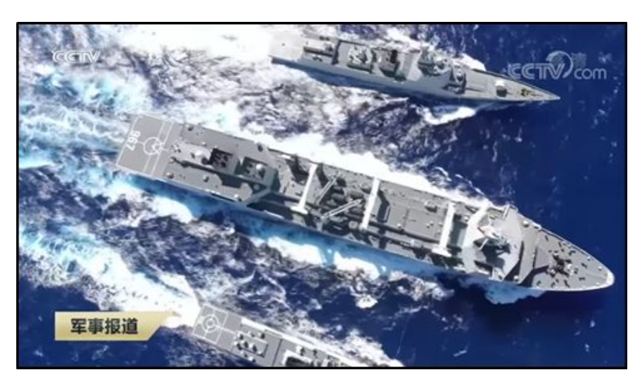
Image: Vessels from the ZHANLAN-2020A training task force sail in a parallel formation (undated). The FUYU class (Type 901) combat support vessel CHAGAN HU (查干湖) (Hull 967) is identifiable in the center.

This article argues that the PLAN is close to being able to execute offensive naval operations outside of the first island chain (and perhaps beyond the second island chain) in a wartime environment. The PLA has long discussed the concept of conducting offensive naval operations beyond the first island chain, and by comparing observables from the ZHANLAN-2020A training event with the list of proficiencies necessary to conduct deep strike, the PLAN is likely close to operationalizing this concept.