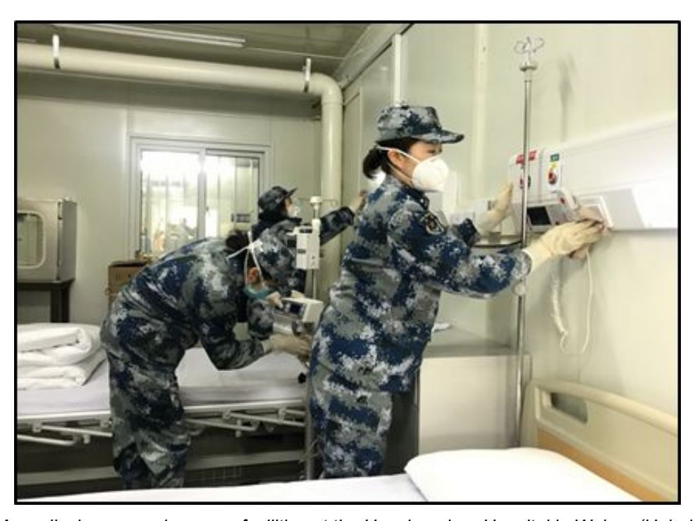
Image: PLA medical personnel prepare facilities at the Huoshenshan Hospital in Wuhan (Hubei Province), February 3, 2020. The hospital was rapidly constructed in late January – early February for use in PLA medical relief efforts.

Finally, between February 13 and 17, the JLSF coordinated the arrival of another 2,600 military medics in two batches. These personnel, who represented all of the PLA's services, departed from 19 cities and arrived in Wuhan via bus, air, and rail transportation (<u>China Military Online</u>, February 13). In total, the JLSF coordinated transportation and sustainment for more than 4,000 military medics from its subordinate units and other parts of the PLA, and brought thousands of units of critical medical supplies to Wuhan over a six week period.