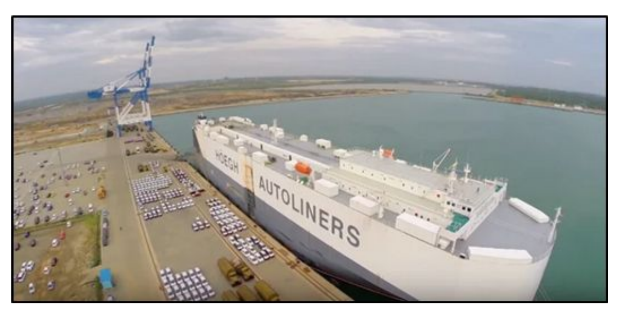
Image: An undated photo of the port facility at Hambantota, on the south coast of Sri Lanka. The Hambantota Port has struggled financially, as most shipping traffic for the country still uses the port facilities at Colombo. In exchange for debt relief connected to the construction costs of Hambantota, in December 2017 the Sri Lankan government turned over a controlling stake in the port to the PRC state-owned corporation China Merchants Port Holdings Company.

despite money from a Chinese-backed Hambantota construction fund allegedly finding its way into Rajapaksa's campaign chest (The Hindu, July 1, 2018). Under financial pressure from its predecessor's debts, the new government in June 2016 came to a $1.5 billion loan agreement with the International Monetary Fund (IMF), which wanted budget cuts (IMF, June 4, 2016). Most of Sri Lanka's debt was owed to private bondholders with zero tolerance for missed payments—as of December 2016, the IMF estimated all Chinese loans combined at only 10 percent of Sri Lanka's outstanding external debt—and most of these funds went to more productive projects (IMF, April 6, 2017). This left Hambantota, a symbol of the last administration's cronyism, on the chopping block. In July 2016, the Sri Lankan government proposed a resolution to the problem: cancelation of all debts at the port and airport in exchange for Chinese equity stakes.