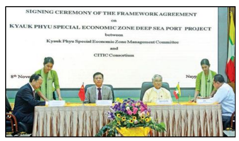
Image: Representatives of the Kyaukphyu Special Economic Zone Management Committee and the PRC state-owned CITIC Consortium sign the framework agreement for the Kyaukphyu Special Economic Zone Deep Sea Port Project in the Myanmar capital of Naypyidaw, November 8, 2018.

The Myanmar government has renegotiated project terms, trimmed down projects, and bargained hard to bring down costs. The Kyaukphyu port project, for instance, has been scaled down to include just two berths from the originally planned ten. Its cost has been slashed by 80% and the China-Myanmar holding ratio was brought down from 85:15 to 70:30 (Myanmar Times, July 12, 2018). Myanmar's hard bargaining with China has taken time, but it has been able to change project terms to better suit its interests and development priorities.