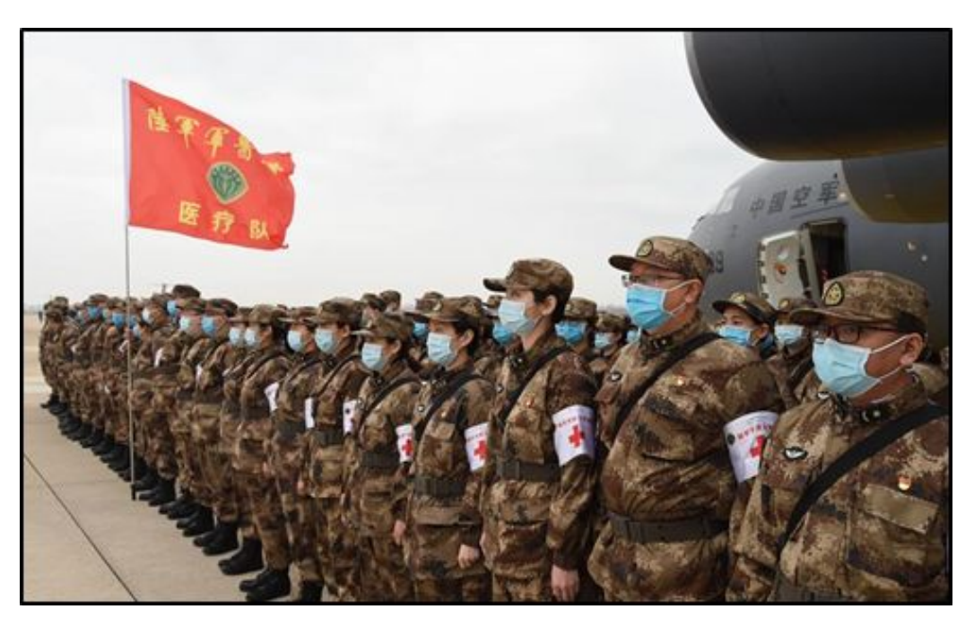
Image: PLA Army medics arrive at Tianhe International Airport in Wuhan (Hubei Province) on February 13 to assist with COVID-19 medical relief efforts in the city. Per state media coverage, the flights that brought these and other PLA medical personnel to Wuhan represented "the first time for China's domestically developed large transport aircraft Y-20 to take part in [a] non-military action... [and] the first time for the Air Force to send large and medium transport aircraft on active service to carry out urgent air transport tasks on a large scale."

diminishing the influence of the theaters: JLSF headquarters, responding to Central Military Commission (CMC) orders, can facilitate the timely movement of critical resources across theater boundaries. While the JLSF has supported more than 50 PLA exercises (China Daily, October 21, 2019), the Wuhan crisis was the first time it was put into practice to respond to a national emergency.