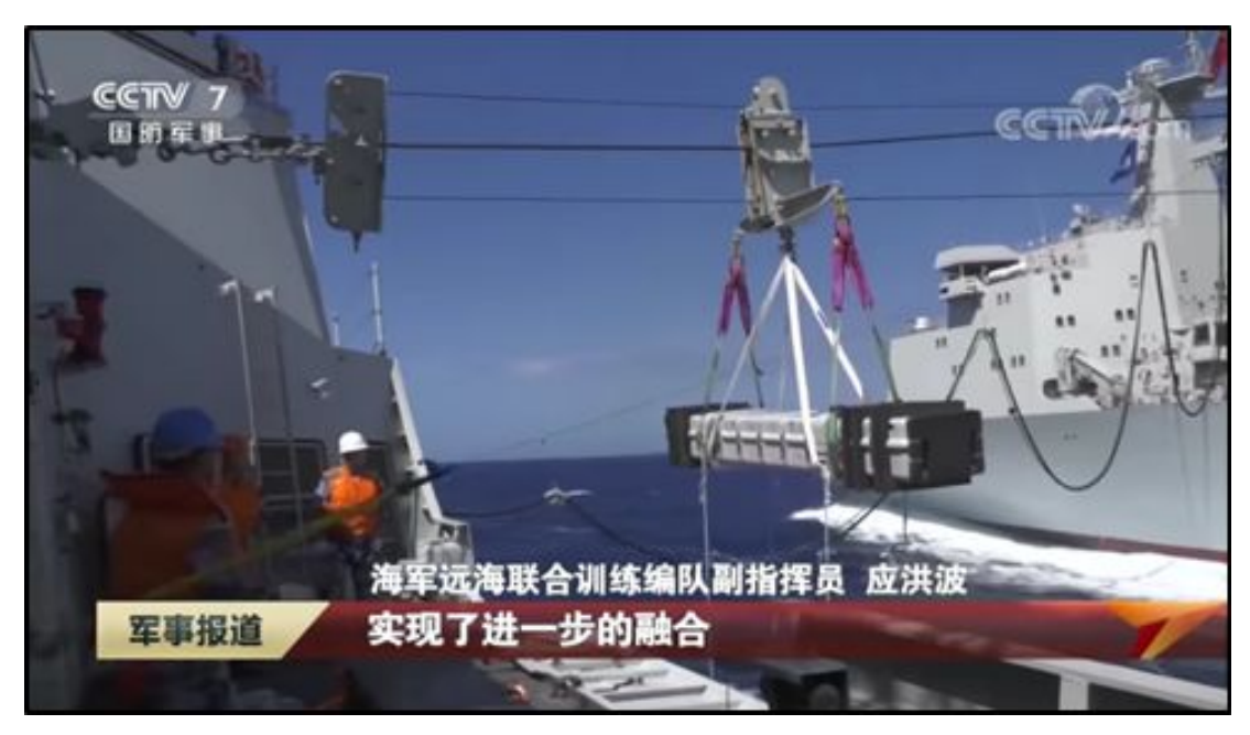
Image: Sailors of the ZHANLAN-2020A training task force conduct underway replenishment (UNREP) operations (undated).

The PLAN is at least beginning to think about how to address this problem in the far seas. ZHANLAN-2020A featured the first known instance of the PLAN training to transfer ordnance (besides naval artillery rounds) while underway outside of the first island chain. During an underway replenishment (UNREP) training evolution, the PLAN transferred at least one probable HQ-10 close range surface to air missile canister from AOR-967 to LUYANG III-class DDG-161 through alongside connected replenishment. The PLAN also transferred at least one lightweight torpedo through vertical replenishment using a Z-9 helicopter (CCTV, February 20).