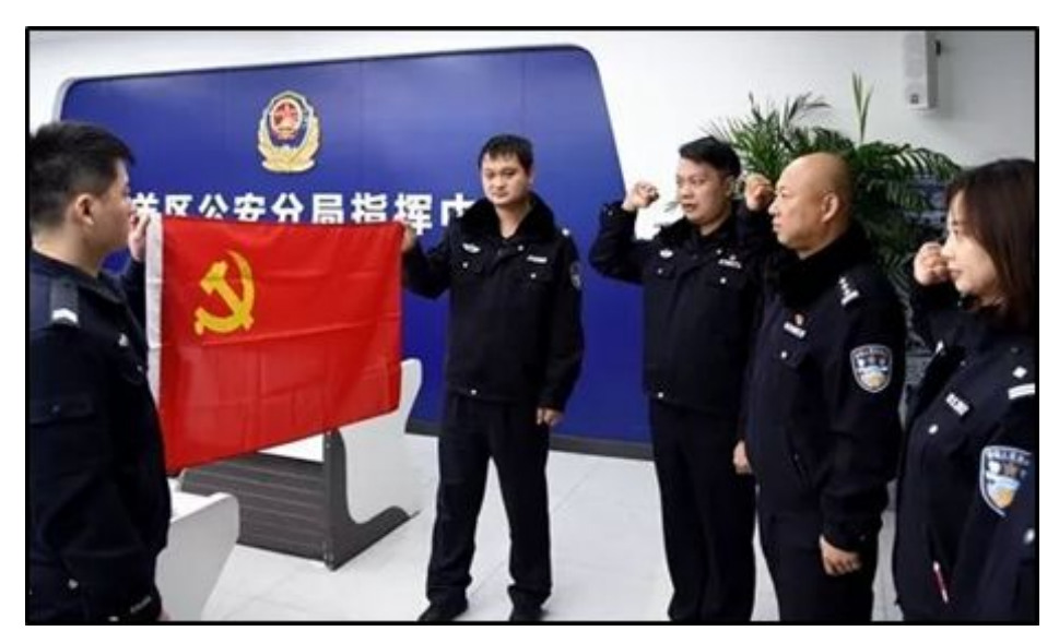
Image: CCP members in the Public Security Bureau of Qingyang District, Chengdu City (Sichuan Province) conduct a ceremony to renew their party membership oaths (undated, February 2020).