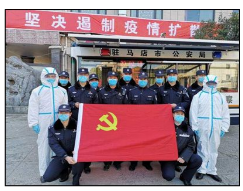
Image: Personnel of the Public Security Bureau in Zhumadian City (Henan Province) pose for a photo with the CCP flag, February 2020. The photo accords with similar images featured in PRC state media since early February, which depict police officers making symbolic declarations of loyalty to the CCP.

suspected contaminated areas. Guo also worked to inspire fellow CCP members among the police by organizing lectures to emphasize that his colleagues "must resolutely bring into play the party organization fortress combat functions, and set forth party members as a model vanguard" amid counter-epidemic operations (Henan Xinyu Wang, March 30).