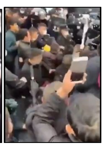
Images: Still images from video of the March 27 incident on the Jiujiang Yangzi River Bridge on the Hubei-Zhejiang provincial border: angry citizens climb onto and stomp a police car (left), overturn a police van (center), and clash with police (right).

Regional tensions were revealed in video of the incident, in which angry citizens could clearly be heard to chant "Let's go, Hubei" (湖北加油, Hubei jiayou ) when marching to confront barricades set up by Jiangxi police (HK Free Press, March 27). The police barricades were presumably ordered by Jiangxi officials—acting in apparent contravention of official national policy—who were fearful that an influx of people from Hubei could once more spread COVID-19 infections. This likely revealed skepticism on the part of regional officials towards the central government's message that the epidemic has been contained in Hubei. It also revealed issues of fear and discrimination against Hubei persons on the part of Chinese from other provinces, a problem acknowledged in official PRC press outlets (China Daily, March 30).