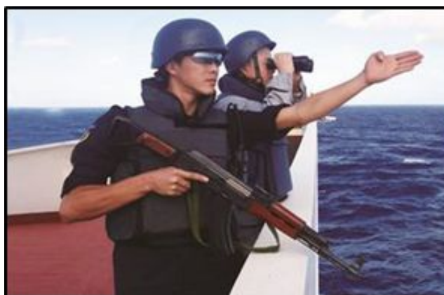
Images: Publicity photos from the Chinese private security contractor Hua Xin Zhong An (华信中安), advertising the capabilities of the company’s shipboard security personnel.