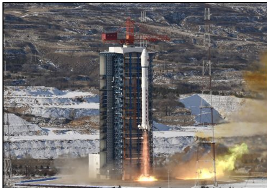
Image: A Long March 2D rocket on lift-off from the Taiyuan Launch Center in Shanxi Province, January 15. The rocket carried four satellites into orbit, including two satellites made by the Argentine company Satellogic.

The early months of 2020 have seen a number of significant launches for the People's Republic of China (PRC)'s Long March series of rockets (长征系列运载火箭, Chang Zheng xilie yunzai huojian ). The venerable—but steadily evolving— Long March series dates its active history back to China's first satellite launch in 1970, and has long been the primary workhorse for launches associated with the PRC's satellite and space exploration programs. These programs are increasingly ambitious in scope, and launch activities in 2020 may exceed those of last year: PRC state media indicated early this year that at least 40 Long March launch missions “to serve national space programs” were planned for 2020, with intent to surpass the 34 launches made in 2019 ( Zhongguo Qingnian Bao , January 20; China Daily , February 20).