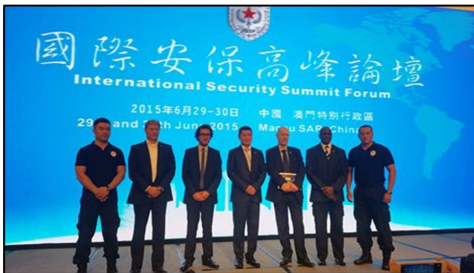
Image: Personnel of Hua Wei International Security (华卫安保国际, Hua Wei Anbao Guoji) stand alongside other representatives of international private security companies at a conference in Macao, June 2015.

In addition to the Chinese People's Liberation Army Navy (PLAN) Support Base in Djibouti, the People's Republic of China (PRC) has indicated ambitious plans for future “strategic strong point” naval bases in the Indian Ocean and Africa ( China Brief , March 22, 2019), and has pursued this goal with varying degrees of success ( China Brief , April 13). One of the key ideas behind these bases is to provide security to Chinese workers and businesses abroad. By late 2016, more than 30,000 Chinese businesses had invested offshore (with a total investment of $1.2 trillion) and nearly one million Chinese citizens were working abroad ( China Daily , July 14, 2017). Many of these workers are either employed, or in the near future could be employed, along Belt and Road Initiative (BRI) routes that traverse over some of the world's most unstable and dangerous areas ( China Brief , February 15, 2019; China Brief , April 1).