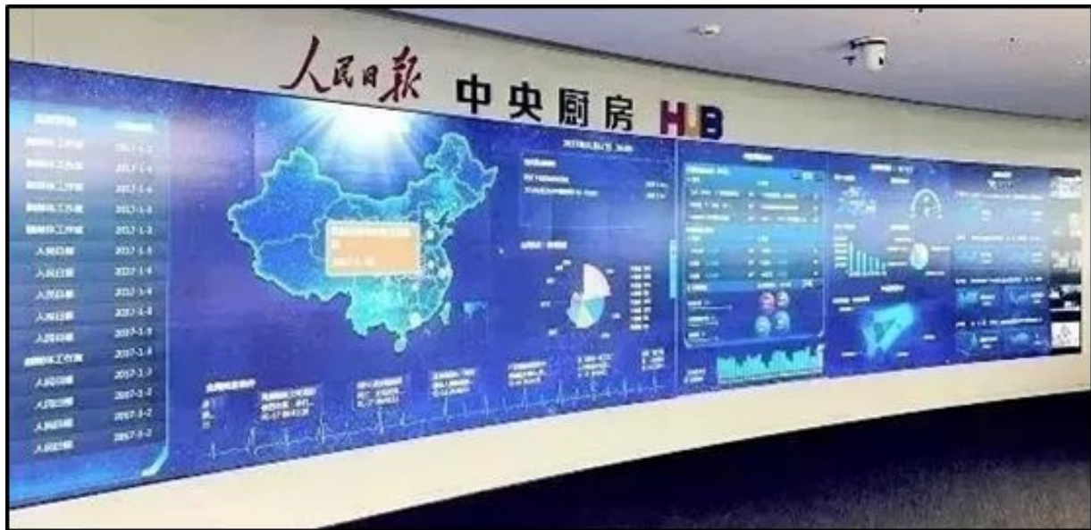
Image: An electronic information display in the “central kitchen” (中央厨房, zhongyang chufang) of the CCP’s flagship newspaper People’s Daily. In the state media article accompanying this photo, the facility is described as a center for “innovating the production, processing, and dissemination model of news products; it is a powerful tool for every news organization to quicken the advance of the construction of media fusion.”

The plurality of voices and speed at which public opinion evolves online, especially in times of crisis, are at the heart of these challenges ( Cyberspace Administration of China , December 29, 2016). The CCP's communications theorists especially emphasize the need to reform the type (i.e., text, video, etc.) and sophistication of Party content, as well as to improve the speed of its dissemination. Doing so, they argue, will increase the timeliness and efficacy of state propaganda in leading public opinion online ( QS Theory , April 21; Cyberspace Administration of China , December 17, 2019; People's Daily Online , August 15, 2019).