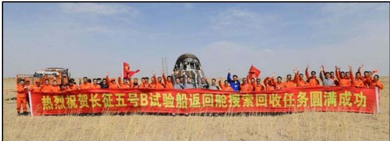
Image: Recovery personnel pose for a group photo before the “trial version of China’s new-generation manned spaceship” following its return at the Dongfeng landing site in Inner Mongolia (May 8, 2020).