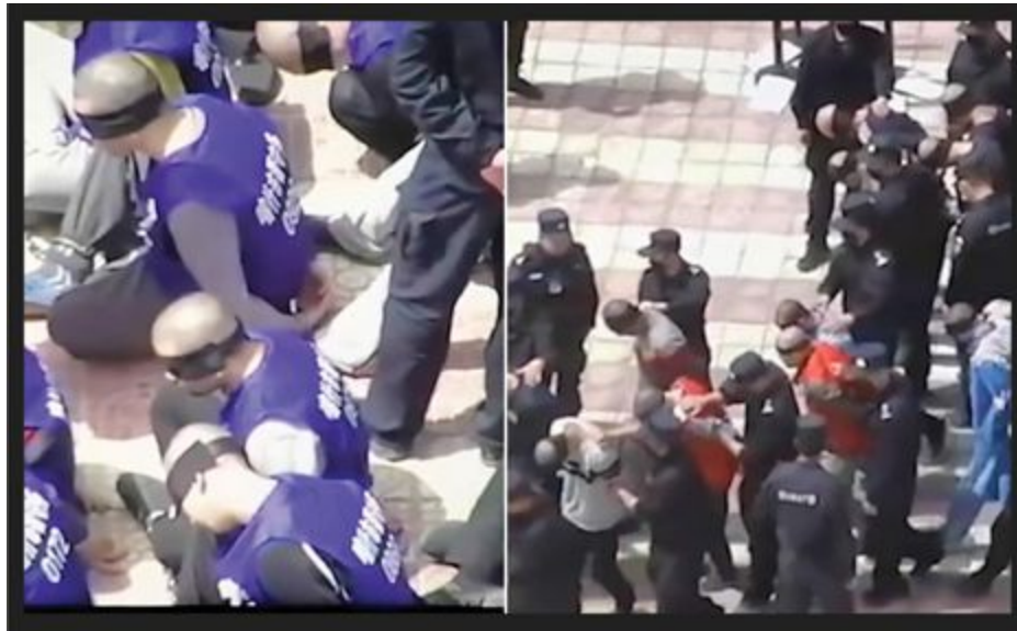
Images: Uyghur prisoners, bound and blindfolded, are moved from a detention facility in Kashgar (Xinjiang) to other, unknown facilities (October 2019). The mass arrest of ethnic Uyghurs provides another population of incarcerated persons potentially vulnerable to state predation.

The current mass internment of Uyghur Muslims ( China Brief , May 15, 2018; China Brief , November 5, 2018) has also led to questions about the vulnerability of this population to execution and organ harvesting. As compared to the Falun Gong allegations, a similar constellation of evidence exists in the case of Uyghur Muslim prisoners of conscience, though it is not yet as fully developed. In this case, too, Uyghurs have reportedly been subjected to systematic and coercive blood and DNA tests. Former detainees report forced medical examinations of the health and functioning of thoracic and abdominal organs. There are also many instances of disappearances of Uyghurs in custody. [4] Multiple reports and leaked video footage indicate secret transfers of Uyghur detainees on rail to different parts of China ( see image below )—which does not, in itself, prove that these persons are being exploited for organ harvesting, but does demonstrate extrajudicial and unaccountable state control over this vulnerable population.