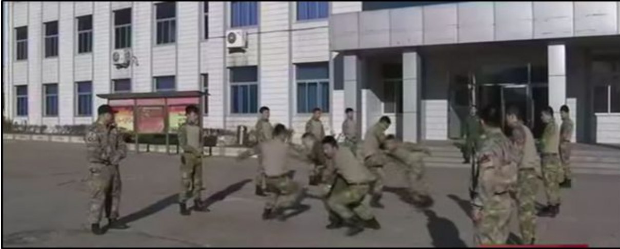
Image: Personnel of the private security firm Bojing Teweï (博警特卫) conduct martial arts and bodyguard training (undated, circa 2016).

companies working in dangerous regions. By 2016, the overall number of Chinese PSCs working abroad rose to twenty, with 3,200 security professionals deployed overseas (Global Times, June 23, 2016; China Daily April 22, 2016). However, the international market share of Chinese PSCs remained miniscule in comparison with their Western counterparts.