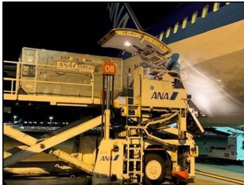
Image: At Tokyo’s Haneda Airport, cargo is loaded on board a charter flight of medical supplies bound for the epidemic-stricken Chinese city of Wuhan (undated, late January or early February 2020).

Notably, diverse public and private actors in central and local governments, companies, and civil organizations, as well as private individuals, have participated in this “national effort.” More than sixty local governments in Japan have sent aid to their Chinese counterparts ( Embassy of Japan in China , February 6). Oita, the sister city of China’s epicenter Wuhan, acted quickly on January 27 to donate 30,000 masks, 600 sets of protective gear, and 400 goggles, and also arranged several fund-raising events afterwards ( Embassy of People’s Republic of China in Japan , February 4). Businesses and other civil organizations have also followed suit. Honda, Toyota, and Suzuki, the “big three” Japanese automobile manufacturers, all offered financial donations to China. Canon donated a piece of medical CAT scan equipment worth more than $400,000 to Wuhan ( Embassy of Japan in China , February 7).