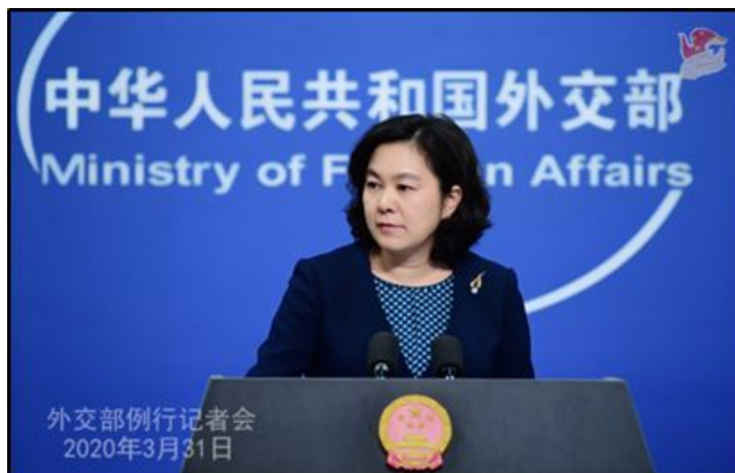
Image: PRC Foreign Ministry spokeswoman Hua Chunying speaking at a press briefing on March 31. When asked about a collision between a Japanese destroyer and a Chinese fishing vessel the previous day, Hua reasserted PRC sovereignty claims—but adopted a moderate tone that contrasted with some earlier incidents in the East China Sea.

Island and its affiliated islands have been China's inherent territory since ancient times,” this was not reiterated as forcefully as seen in the past. Historical incidents were not invoked to promote nationalism, and People's Daily and Xinhua both kept quiet on the matter ( PRC Foreign Ministry , March 24).