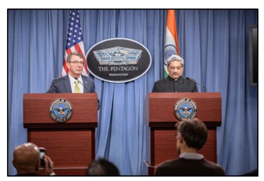
Image: Then-U.S. Secretary of Defense Ashton Carter (left) and then-Indian Minister of Defence Manohar Parrikar (right) appear together at a press conference in December 2015.

It was against this backdrop that Prime Minister Singh visited the United States in September 2013 to participate in the United Nations (U.N.) General Assembly, and held a side meeting with U.S. President Barack Obama. The Joint Statement issued by the two sides affirmed that "the partnership between the two democratic nations is stronger today than at any point in their 67-year history" (Indian PM Office, September 27, 2013). The two leaders reiterated their desire to further strengthen defense trade cooperation by endorsing a Joint Declaration on Defence Cooperation as a means of enhancing their partnership in military technology transfers, joint research, and co-development and co-production of certain types of military equipment. President Obama encouraged further participation by U.S. firms in partnering India's efforts to enhance its defence capabilities (Indian Ministry of External Affairs, September 27, 2013).