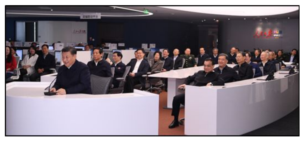
Image: The CCP Politburo conducted a collective study session in January 2019 at the headquarters of People's Daily, focused on the theme "The Age of Comprehensive Media and the Development of Media Fusion."

Politburo study sessions are publicized under an overarching official theme: for example, in the previous designated Politburo study session (held on November 29 of last year), the official theme was "Building the Capacity of Our Country's Emergency Management System" (我国应急管理体系和能力建设, Woguo Yingji Guanli Tixi he Nengli Jianshe) (Gongchandang Wang, ongoing). In 2019, one theme was so important that it was actually the subject of two separate Politburo study sessions: "Don't Forget [Our] Original Purpose and Firmly Remember the Mission" (不忘初心, 牢记使命 / Wang Chuxin, Laoji Shiming), a slogan unveiled in summer 2019 that has been closely associated with CCP General Secretary Xi Jinping's drive for reinforced ideological orthodoxy within the ruling party (China Brief, July 31, 2019). The first meeting to feature this theme was a study session on June 24 (see chart below); the second was the end-of-year Politburo "democratic life meeting" convened on December 26-27 (China Brief, January 29). [2]