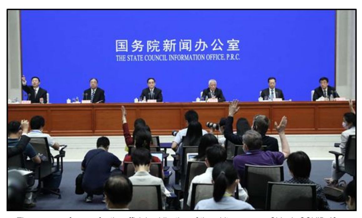
Image: The press conference for the official publication of the white paper on China's COVID-19 response, which was released by the PRC State Council Information Office on June 7, 2020.

Publishing the White Paper is one attempt by the PRC to show that it is "open and transparent" and that "China gave timely notification to the international community" (SCIO, June 7). However, in its present form the White Paper raises significant questions about the initial phase of the outbreak and how information was communicated between local, provincial, and national officials: its timeline begins too late to fully answer these questions, which could hamper efforts to learn the origin of the virus and how it spread initially. A clear understanding of how the COVID-19 pandemic began will be necessary for the international medical and scientific community to understand the origins and initial spread of the virus. If the initial days and weeks are not articulated, it may be impossible for epidemiologists, scientists, and policymakers to assess what actually occurred at the outset.