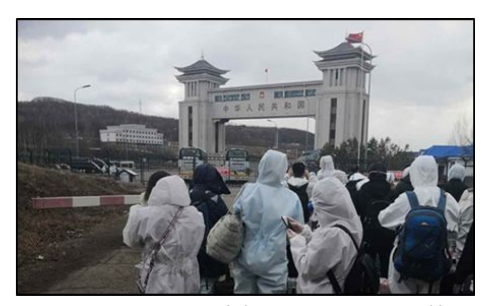
Image: Persons waiting at a border checkpoint at Suifenhe, a town along the border of China's Heilongjiang Province and the Russian province of Primorsky Krai (undated, early-mid April). In April, Suifenhe was placed under quarantine and its port closed due to the COVID-19 pandemic.

The immediate impact of the COVID-19 crisis on Sino-Russian relations has been to weaken the social and economic ties between the two states. Similar to circumstances in other countries, their cross-border economic exchanges have abruptly shrunk. The pandemic has also exacerbated xenophobic sentiments in both countries, as well as directing their political leadership inwards towards domestic recovery (China Brief, February 28). However, the COVID-19 crisis has reaffirmed both governments' ability to manage these challenges and to limit major damage to their relationship. In the long term, the diverging economic performance of the two countries, with China rebounding much faster than Russia, could further increase Russia's economic dependence on China. Lastly, the crisis has seen a unique convergence of Chinese and Russian narratives, with their reciprocal messaging amplifying their viewpoints. This may foreshadow further cooperation in the information domain between the two countries.