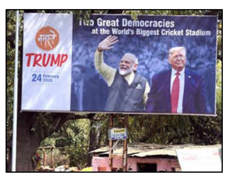
Image: A billboard in India touting the meeting between Indian PM Narendra Modi and U.S. President Donald Trump in Gujarat, India in February 2020 (undated photo). During the visit, the U.S.-India relationship was declared to be a "Global Comprehensive Strategic Partnership," and new sales of U.S. military equipment to India were announced.

The two countries also entered into a contract in December 2016 for the procurement of 145 U.S.-made M777 ultra-light howitzers. It was agreed that the first 25 howitzers would be sold off the shelf, while the remaining 120 would be assembled in India. The howitzers are likely to be deployed on the Line of Actual Control (LAC) along the contested India-China border, in the regions of Arunachal Pradesh and Ladakh (in Jammu and Kashmir). The LAC is not formally defined, which at times results in border transgressions by both sides. The M777s, which have been used by U.S. forces in Afghanistan and Iraq, will help India secure its borders with China along the LAC. Once ready for deployment, the howitzers will be transported by heavy-lift Chinook helicopters to forward area helipads, such as the Walong Advanced Landing Ground in Arunachal Pradesh (Economic Times, October 7, 2019).