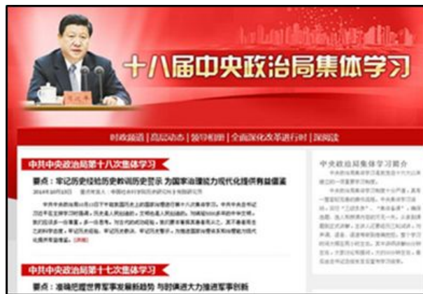
Image: A People's Daily graphic, dating from 2014, that publicized collective study sessions of the 18 th Politburo (2012-2017). From the early period of Xi's tenure as CCP General Secretary, Xi's authoritative position in Politburo political study sessions has been promoted as another aspect of his cult of personality.

Touting civil law protections to provide economic reassurance to commercial enterprises. Facing tri-fold economic pressures from the U.S.-China “trade war,” the potential decoupling of foreign businesses from China, and the COVID-19 pandemic, Beijing has taken recent steps to send a message of reassurance to foreign firms operating or investing in China ( Xinhua , May 21; NPC Work Report , May 25). Commentary on the May 29 Politburo session asserted that “the building of our country's civil law and commercial law system is proceeding at an ever-more rapid pace,” and stressed the capacity of PRC law for “property security [and] commercial transaction facilitation.” Party and state organs were advised to “consider civil code regulations, so that they do not infringe upon the lawful civil rights of the masses, including personal security and property rights” ( Xuexi Qiangguo , May 29).