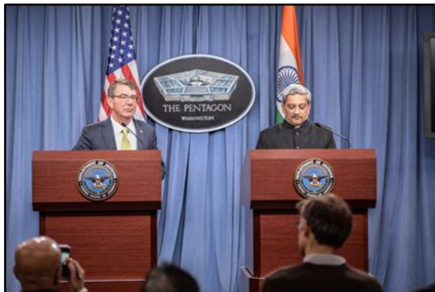
Image: Then-U.S. Secretary of Defense Ashton Carter (left) and then-Indian Minister of Defence Manohar Parrikar (right) appear together at a press conference in December 2015.

It was against this backdrop that Prime Minister Singh visited the United States in September 2013 to participate in the United Nations (U.N.) General Assembly, and held a side meeting with U.S. President Barack Obama. The Joint Statement issued by the two sides affirmed that "the partnership between the two democratic nations is stronger today than at any point in their 67-year history" ( Indian PM Office , September 27, 2013). The two leaders reiterated their desire to further strengthen defense trade cooperation by endorsing a Joint Declaration on Defence Cooperation as a means of enhancing their partnership in military technology transfers, joint research, and co-development and co-production of certain types of military equipment. President Obama encouraged further participation by U.S. firms in partnering India's efforts to enhance its defence capabilities ( Indian Ministry of External Affairs , September 27, 2013).