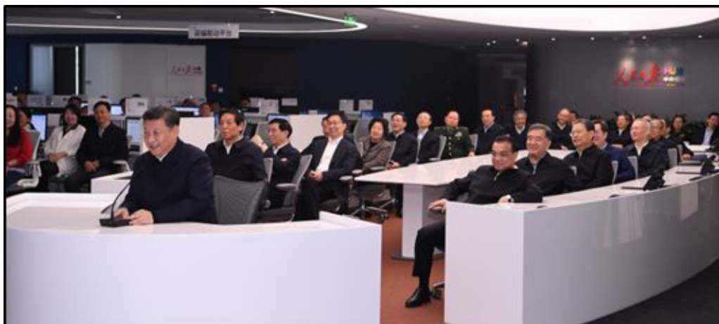
Image: The CCP Politburo conducted a collective study session in January 2019 at the headquarters of People's Daily, focused on the theme "The Age of Comprehensive Media and the Development of Media Fusion."

Politburo study sessions are publicized under an overarching official theme: for example, in the previous designated Politburo study session (held on November 29 of last year), the official theme was "Building the Capacity of Our Country's Emergency Management System" (我国应急管理体系和能力建设, Woguo Yingji Guanli Tixi he Nengli Jianshe ) ( Gongchandang Wang , ongoing). In 2019, one theme was so important that it was actually the subject of two separate Politburo study sessions: "Don't Forget [Our] Original Purpose and Firmly Remember the Mission" (不忘初心, 牢记使命 / Wang Chuxin, Laoji Shiming ), a slogan unveiled in summer 2019 that has been closely associated with CCP General Secretary Xi Jinping's drive for reinforced ideological orthodoxy within the ruling party ( China Brief , July 31, 2019). The first meeting to feature this theme was a study session on June 24 (see chart below ); the second was the end-of-year Politburo "democratic life meeting" convened on December 26-27 ( China Brief , January 29). [2]