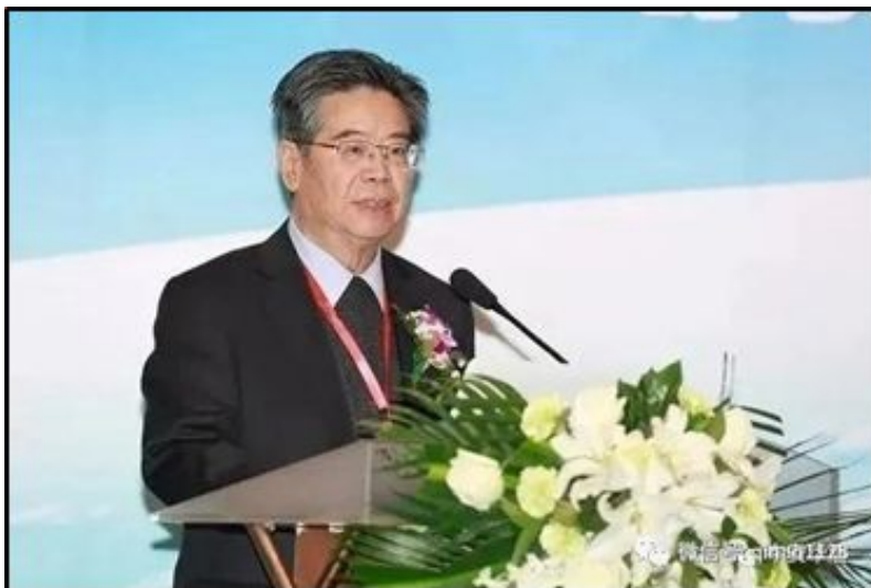
Image: Wang Haiyun, a retired PLA brigadier general and former military attaché in Russia, has called for the PRC to resist the "arrogance of hegemonic power" (霸权势力气焰, baquan shili qiyan) embodied by the United States (undated photo).

To secure China's current advantages and confront American attempts to stop the rise of China, Wang Haiyun proposes five steps: