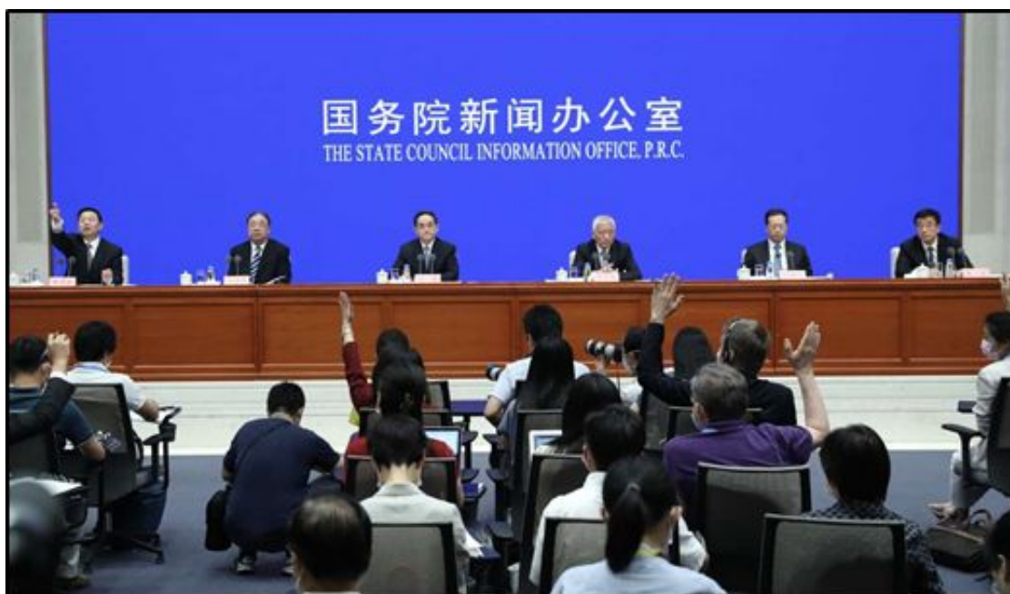
Image: The press conference for the official publication of the white paper on China’s COVID-19 response, which was released by the PRC State Council Information Office on June 7, 2020.

Publishing the White Paper is one attempt by the PRC to show that it is “open and transparent” and that “China gave timely notification to the international community” ( SCIO , June 7). However, in its present form the White Paper raises significant questions about the initial phase of the outbreak and how information was communicated between local, provincial, and national officials: its timeline begins too late to fully answer these questions, which could hamper efforts to learn the origin of the virus and how it spread initially. A clear understanding of how the COVID-19 pandemic began will be necessary for the international medical and scientific community to understand the origins and initial spread of the virus. If the initial days and weeks are not articulated, it may be impossible for epidemiologists, scientists, and policymakers to assess what actually occurred at the outset.