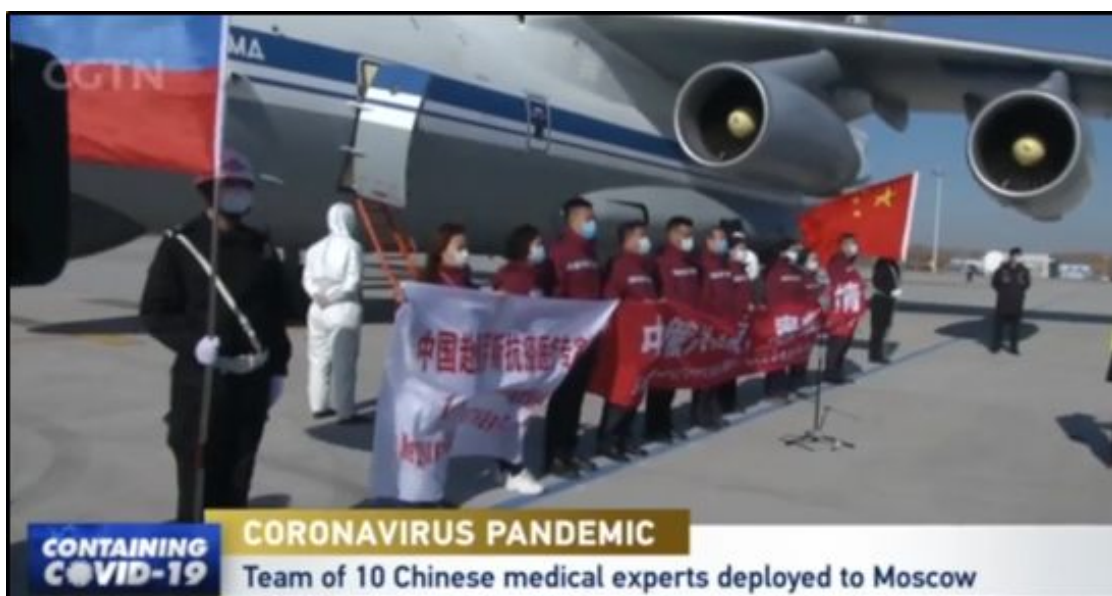
Image: On April 11, a team of medical personnel from China's Heilongjiang Province pose for a photo upon arrival in Moscow to assist with COVID-19 relief efforts.

Biotechnology and related ties will likely expand between the countries in the future, especially in the field of high-tech surveillance hardware and software. Scientists from Russia and China are working together to develop vaccines and other anti-viral medication. In a stroke of good timing, 2020 and 2021 have been designated “Years of Scientific and Technological Innovation in China and Russia” ( China Daily , February 26).