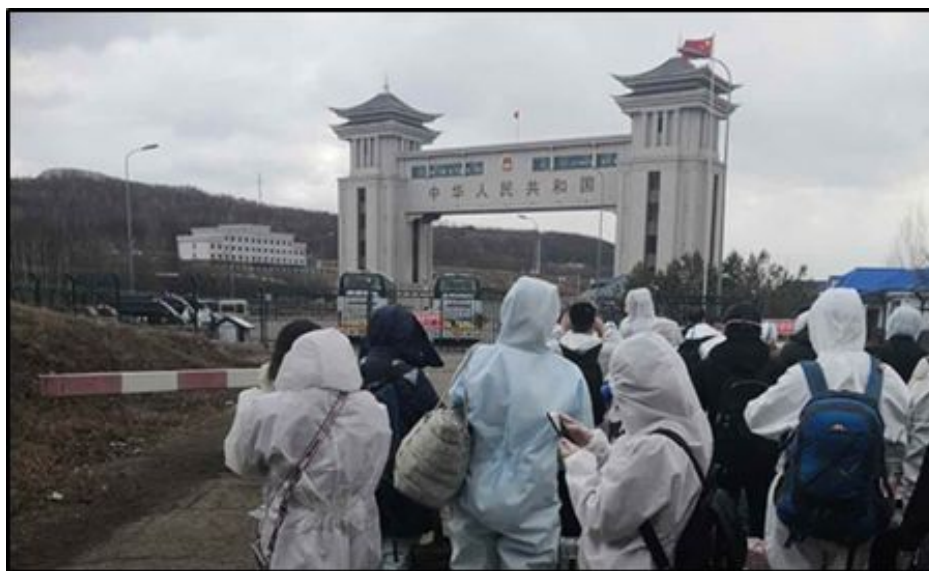
Image: Persons waiting at a border checkpoint at Suifenhe, a town along the border of China's Heilongjiang Province and the Russian province of Primorsky Krai (undated, early-mid April). In April, Suifenhe was placed under quarantine and its port closed due to the COVID-19 pandemic.

The immediate impact of the COVID-19 crisis on Sino-Russian relations has been to weaken the social and economic ties between the two states. Similar to circumstances in other countries, their cross-border economic exchanges have abruptly shrunk. The pandemic has also exacerbated xenophobic sentiments in both countries, as well as directing their political leadership inwards towards domestic recovery ( China Brief , February 28). However, the COVID-19 crisis has reaffirmed both governments' ability to manage these challenges and to limit major damage to their relationship. In the long term, the diverging economic performance of the two countries, with China rebounding much faster than Russia, could further increase Russia's economic dependence on China. Lastly, the crisis has seen a unique convergence of Chinese and Russian narratives, with their reciprocal messaging amplifying their viewpoints. This may foreshadow further cooperation in the information domain between the two countries.