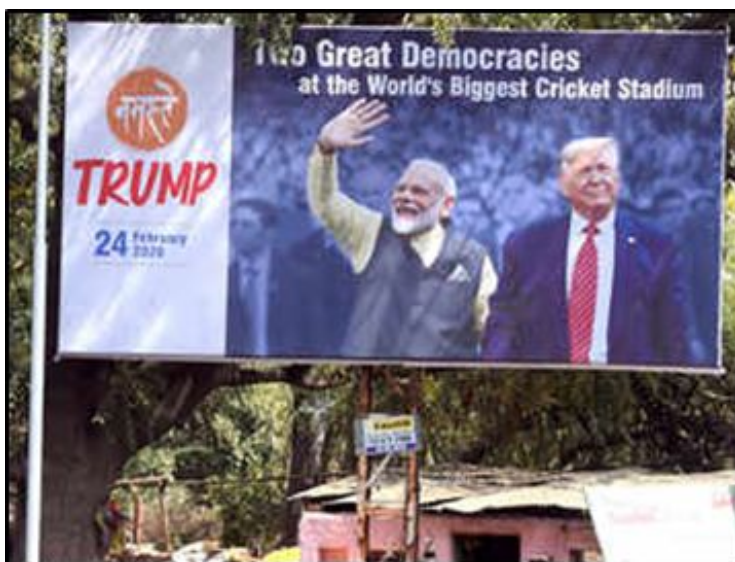
Image: A billboard in India touting the meeting between Indian PM Narendra Modi and U.S. President Donald Trump in Gujarat, India in February 2020 (undated photo). During the visit, the U.S.-India relationship was declared to be a “Global Comprehensive Strategic Partnership,” and new sales of U.S. military equipment to India were announced. (Image source: Economic Times , February 19, 2020)

The two countries also entered into a contract in December 2016 for the procurement of 145 U.S.-made M777 ultra-light howitzers. It was agreed that the first 25 howitzers would be sold off the shelf, while the remaining 120 would be assembled in India. The howitzers are likely to be deployed on the Line of Actual Control (LAC) along the contested India-China border, in the regions of Arunachal Pradesh and Ladakh (in Jammu and Kashmir). The LAC is not formally defined, which at times results in border transgressions by both sides. The M777s, which have been used by U.S. forces in Afghanistan and Iraq, will help India secure its borders with China along the LAC. Once ready for deployment, the howitzers will be transported by heavy-lift Chinook helicopters to forward area helipads, such as the Walong Advanced Landing Ground in Arunachal Pradesh ( Economic Times , October 7, 2019).