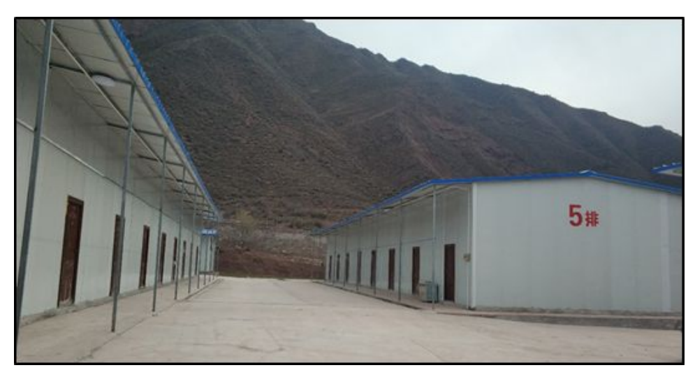
Images: Different views of the "Chamdo Golden Sunshine Vocational Training School" in the Chamdo region of eastern Tibet. / Figure 4 (top): The facility at ground level. / Figures 5 and 6 (below): Satellite views of the facility.

Given that this scheme severs the long-standing connection between Tibetans and their traditional livelihood bases, its explicit inclusion in the militarized vocational training and labor transfer policy context is of great concern.