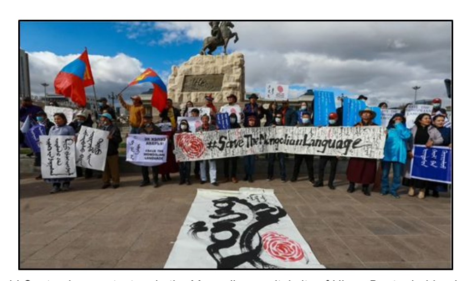
Image: In mid-September, protesters in the Mongolian capital city of Ulaan Baatar hold a demonstration against the Chinese government's policy to replace Mongolian with Mandarin as the primary language of instruction in schools in Inner Mongolia.

CCP authorities are apparently also trying to change the lifestyle of Mongolians by discouraging grazing and animal husbandry, and driving the nomads to live in cities. In the summer, the IMAU legislature drafted the Autonomous Region Regulations on Grassland-Livestock Balance and Prohibitions on Herd Cultivation (自治区草畜平衡和禁牧休牧条例, Zizhiqu Cao-Xu Pingheng he Jinmu Xiumu Tiaoli), a set of regulations that would restrict animal husbandry and livestock grazing (Xinhua, August 4; Sohu.com, August 1; Inner Mongolian Daily, August 1). In a press conference, officials of the IMAU cited the party central leadership and CCP General Secretary Xi Jinping as saying that "the ecological conditions of Inner Mongolia is not only tied to the livelihood and development of different nationalities in the IMAU," and that "the ecological safety of northern China, the northeast, northwest and the whole country will be affected" (Inner Mongolia Government, August 4). These policies parallel similar and ongoing efforts to suppress pastoralist lifestyles in Tibet (China Brief, September 22).