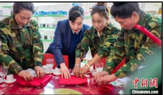
Images: Examples of "military-style" vocational training for ethnic Tibetans in the Chamdo region. / Figure 2 (left): Tibetans dressed in military fatigues practice painting.. / Figure 3 (right): Tibetan women in military fatigues are trained how to be restaurant waitresses.