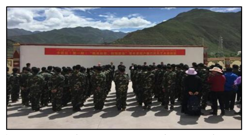
Image 1: Military-style training of "rural surplus laborers" in the Chamdo region of Tibet, June 2016.

The labor transfer policy mandates that pastoralists and farmers are to be subjected to centralized "military-style" (军旅式, junlüshi) vocational training, which aims to reform "backward thinking" and includes training in "work discipline," law, and the Chinese language. Examples from the TAR's Chamdo region indicate that the militarized training regimen is supervised by People's Armed Police drill sergeants, and training photos published by state media show Tibetan trainees dressed in military fatigues (see accompanying images).