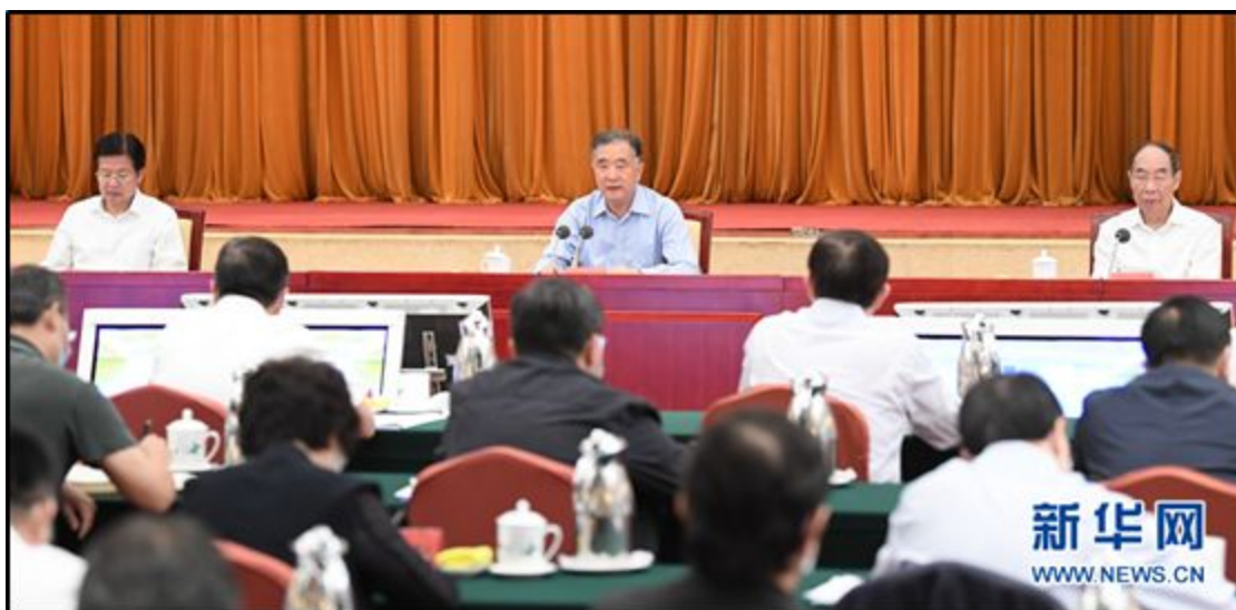
Image: Wang Yang (汪洋) (seated center), the member of the CCP Politburo Standing Committee with responsibility for the united front policy portfolio, speaks before a meeting of the "National Private Economy United Front Work Conference" (全国民营经济统战工作会议, Quanguo Minying Jingji Tongzhan Gongzuo Huiyi) held in Beijing on September 9. You Quan (尤权) (seated right), director of the United Front Work Department, was also present for the meeting.

The Opinions echo earlier statements by CCP leaders about the centrality of united front work ( China Brief , May 9, 2019) by asserting that “private economy united front work is a major effort for the entire party” (民营经济统战工作是全党的重要工作, minying jingji tongzhan gongzuo shi quandang de zhongyao gongzuo ) ( Opinions , section 8). The release of the document was also accompanied by a series of political meetings and a propaganda campaign in state media involving senior CCP officials from the united front policy architecture (see accompanying image ). These developments signal clear intent by the CCP to bring China’s growing private sector industries under tighter party-state supervision.