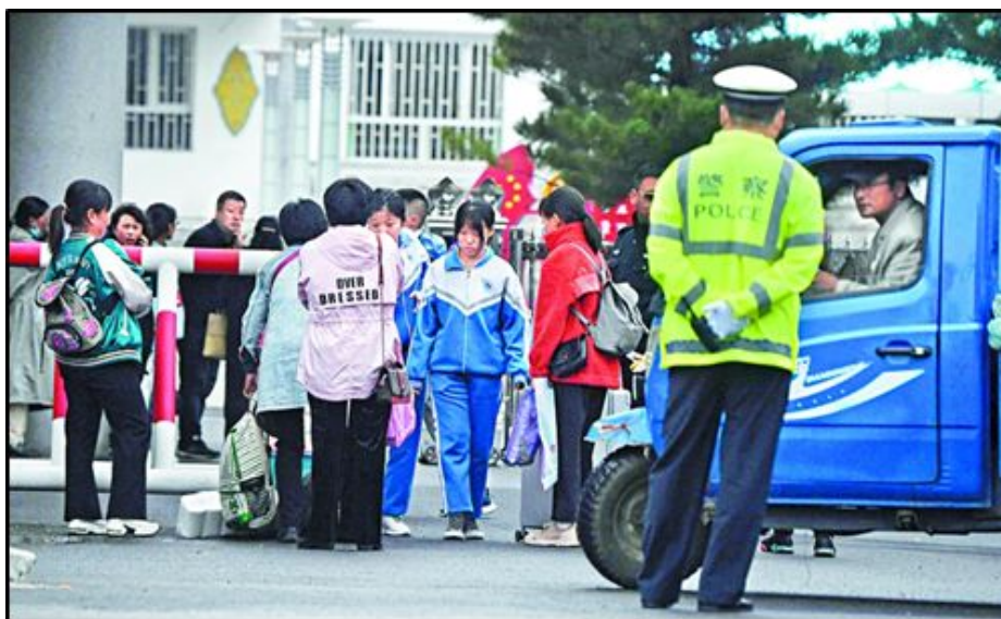
Image: A police officer on patrol outside a middle school in the city of Tongliao (通遼) in eastern Inner Mongolia (undated).

Hundreds of parents who refused to send their kids back to school have been detained by police. Some have been fined more than 5,000 yuan ($733 U.S. dollars), while others have been sent to "legal education classes" that resemble the quasi-concentration camps in the Xinjiang Uighur Autonomous Region ( Apple Daily , September 16; SCMP , September 13; Human Rights Watch , September 4). Moreover, Chinese Communist Party (CCP) cadres in the region have been given quotas to ensure that a high-enough percentage of children report to schools. The U.S.-based Southern Mongolian Human Rights Information Center claimed that nine people lost their lives during the demonstrations, including an ethnic Mongolian party cadre and a school principal who jumped to their deaths in protest against these policies ( Oriental Daily News , September 14; SMHRIC.org , September 4).