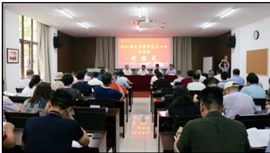
Image: Attendees at a "private enterprise representatives training class" (民营经济代表人士进修班, minying jingji daibiao renshi jinxiuban) held at a campus of Zhejiang University in August 2020. The event was jointly sponsored by the provincial-level branch of the CCP UFWD, and the UFWD-managed All-China Federation of Industry and Commerce.

ACFIC and its “subordinate industry associations” are to provide the basis of “major organizational support for private economy united front work” ( Opinions , sec. 7). In addition to advocating increased roles for ACFIC and its subordinate bodies ( Opinions , sec. 5, art. 18), the document indicates that party officials should “encourage and guide” private enterprises to join these organizations ( Opinions , sec. 7, art. 24). Cadres are also directed to focus greater effort on strengthening the party organizations within these industry associations, and to “establish systems for party and government leading cadres to interface with industry associations” on a more regular basis ( Opinions , sec. 7, art. 24; sec. 6, art. 21)