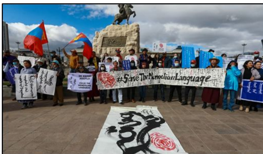
Image: In mid-September, protesters in the Mongolian capital city of Ulaan Baatar hold a demonstration against the Chinese government's policy to replace Mongolian with Mandarin as the primary language of instruction in schools in Inner Mongolia.

CCP authorities are apparently also trying to change the lifestyle of Mongolians by discouraging grazing and animal husbandry, and driving the nomads to live in cities. In the summer, the IMAU legislature drafted the Autonomous Region Regulations on Grassland-Livestock Balance and Prohibitions on Herd Cultivation (自治区草畜平衡和禁牧休牧条例, Zizhiqu Cao-Xu Pingheng he Jinmu Xiumu Tiaoli ), a set of regulations that would restrict animal husbandry and livestock grazing ( Xinhua , August 4; Sohu.com , August 1; Inner Mongolian Daily , August 1). In a press conference, officials of the IMAU cited the party central leadership and CCP General Secretary Xi Jinping as saying that “the ecological conditions of Inner Mongolia is not only tied to the livelihood and development of different nationalities in the IMAU,” and that “the ecological safety of northern China, the northeast, northwest and the whole country will be affected” ( Inner Mongolia Government , August 4). These policies parallel similar and ongoing efforts to suppress pastoralist lifestyles in Tibet ( China Brief , September 22).