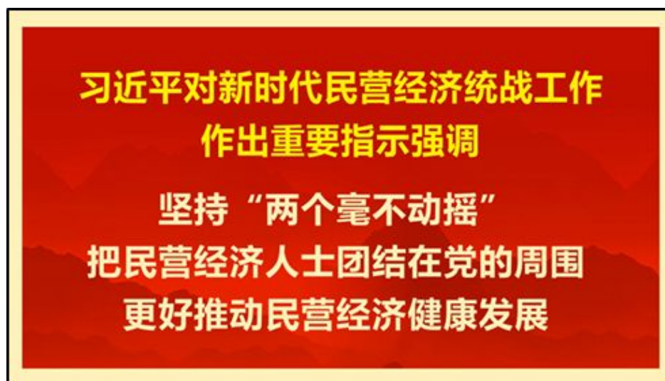
Image: A promotional graphic produced by the CCP United Front Work Department announces that “Xi Jinping presents important instructions for New Era private enterprise united front work.” The three directives listed here are: (1) “Persist in the ‘Two Unwaverings’” (两个毫不动摇, Liangge Haobu Dongyao) (i.e., consolidate and develop the public sector economy, while encouraging and guiding private enterprises); (2) “Bring private economic actors and organizations into the party’s orbit;” and (3) “More effectively promote the healthy development of the private economy.”