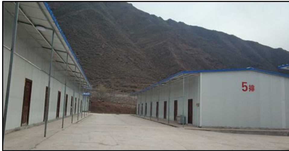
Images: Different views of the “Chamdo Golden Sunshine Vocational Training School” in the Chamdo region of eastern Tibet. / Figure 4 (top): The facility at ground level. / Figures 5 and 6 (below): Satellite views of the facility.

Given that this scheme severs the long-standing connection between Tibetans and their traditional livelihood bases, its explicit inclusion in the militarized vocational training and labor transfer policy context is of great concern.