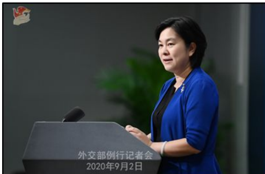
Image: At a September 2 press conference, PRC Foreign Ministry spokesperson Hua Chunying asserted that "We firmly oppose any country providing convenience in any form for the 'Tibet independence' forces' separatist activities," and referenced "the connection between so-called 'Tibetans in exile' and the Indian border troops."

India's use of the SFF has evoked a strong response from Beijing. The PRC Ministry of Foreign Affairs stated that it would "firmly oppose any country providing convenience in any form for the 'Tibet independence' forces' separatist activities" ( PRC Foreign Ministry , September 2). Chinese commentators have dismissed the SFF as neither "special" nor "elite," and described its Tibetan personnel as mere "cannon fodder" for the Indian Army. They further warned India that, were it to play the Tibet card and support Tibetan "secessionism," there would be "consequences"—involving "countermeasures" that would inflict "pain" on India ( Global Times , September 3; Global Times , September 4).