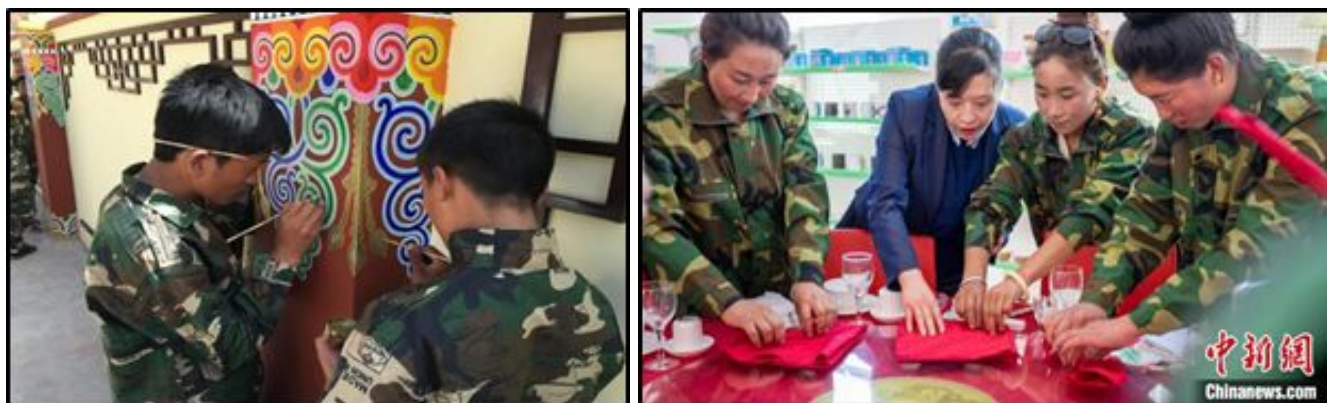
Images: Examples of “military-style” vocational training for ethnic Tibetans in the Chamdo region. / Figure 2 (left): Tibetans dressed in military fatigues practice painting. (Image source: Tibet’s Chamdo , June 30, 2016). / Figure 3 (right): Tibetan women in military fatigues are trained how to be restaurant waitresses.(Image source: Sina , July 27, 2020)

The similarities to Xinjiang’s coercive training scheme are abundant: both schemes have the same target group (“rural surplus laborers”—农牧区富余劳动者, nongmuqu fuyu laodongzhe ); a high-powered focus on mobilizing a “reticent” minority group to change their traditional livelihood mode; employ military drill and military-style training management to produce discipline and obedience; emphasize the need to “transform” laborers’ thinking and identity, and to reform their “backwardness;” teach law and Chinese; aim to weaken the perceived negative influence of religion; prescribe detailed quotas; and put great pressure on officials to achieve program goals. [5]