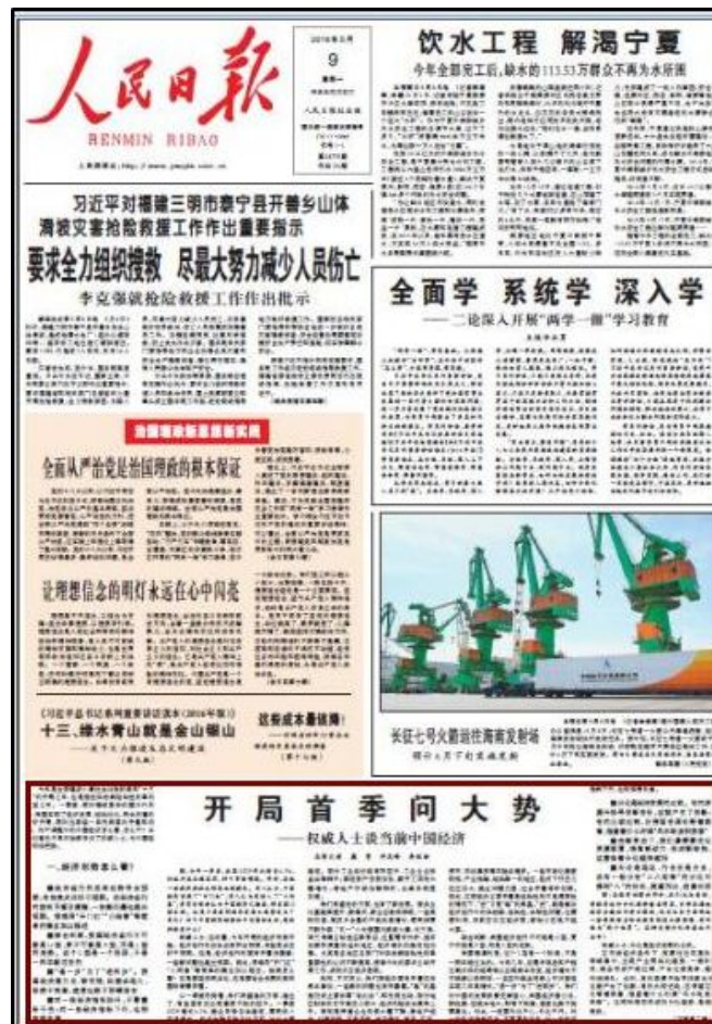
Image: Front page of the May 9, 2016 issue of People’s Daily, featuring an article by an unnamed “authoritative person” on China’s economic reforms.

Despite its benefits, the external risks associated with the BRI may still be too much to bear for Chinese SOEs. In the last year, Beijing has invested less in the BRI, and the dream of creating a win-win network of “enhanced economic interconnectivity” has had limited effect in mitigating economic crises such as the U.S.-China trade war or the global pandemic (China Brief, September 26, 2019 ; November 1, 2019 ; March 16 ). In the wake of new foreign hostilities, and a slowing global economy exacerbated by the ongoing COVID-19 pandemic, the CCP leadership has ramped up efforts to reduce China’s reliance on overseas markets and technology to drive economic growth. This drive has culminated in Xi Jinping’s recent push for a new “dual circulation” (双循环, shuangxunhuan ) economic model ( China Brief , August 14, 2020; Asia Times , August 24; Xinhua , September 2).