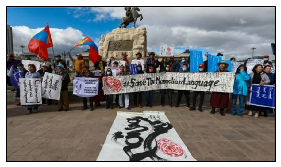
Image: In mid-September, protesters in the Mongolian capital city of Ulaan Baatar hold a demonstration against the Chinese government's policy to replace Mongolian with Mandarin as the primary language of instruction in schools in Inner Mongolia.

CCP authorities are apparently also trying to change the lifestyle of Mongolians by discouraging grazing and animal husbandry, and driving the nomads to live in cities. In the summer, the IMAU legislature drafted the Autonomous Region Regulations on Grassland-Livestock Balance and Prohibitions on Herd Cultivation (自治 区草畜平衡和禁牧休牧条例, Zizhiqu Cao-Xu Pingheng he Jinmu Xiumu Tiaoli ), a set of regulations that would restrict animal husbandry and livestock grazing (Xinhua, August 4; Sohu.com, August 1; Inner Mongolian Daily, August 1). In a press conference, officials of the IMAU cited the party central leadership and CCP General Secretary Xi Jinping as saying that "the ecological conditions of Inner Mongolia is not only tied to the livelihood and development of different nationalities in the IMAU," and that "the ecological safety of northern China, the northeast, northwest and the whole country will be affected" (Inner Mongolia Government, August 4). These policies parallel similar and ongoing efforts to suppress pastoralist lifestyles in Tibet (China Brief, September 22).