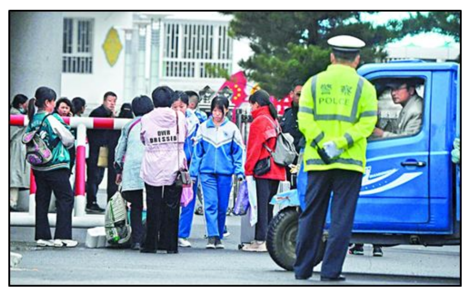
Image: A police officer on patrol outside a middle school in the city of Tongliao (通遼) in eastern Inner Mongolia (undated).

Hundreds of parents who refused to send their kids back to school have been detained by police. Some have been fined more than 5,000 yuan ($733 U.S. dollars), while others have been sent to "legal education classes" that resemble the quasi-concentration camps in the Xinjiang Uighur Autonomous Region (Apple Daily, September 16; SCMP, September 13; Human Rights Watch, September 4). Moreover, Chinese Communist Party (CCP) cadres in the region have been given quotas to ensure that a high-enough percentage of children report to schools. The U.S.-based Southern Mongolian Human Rights Information Center claimed that nine people lost their lives during the demonstrations, including an ethnic Mongolian party cadre and a school principal who jumped to their deaths in protest against these policies (Oriental Daily News, September 14; SMHRIC.org, September 4).