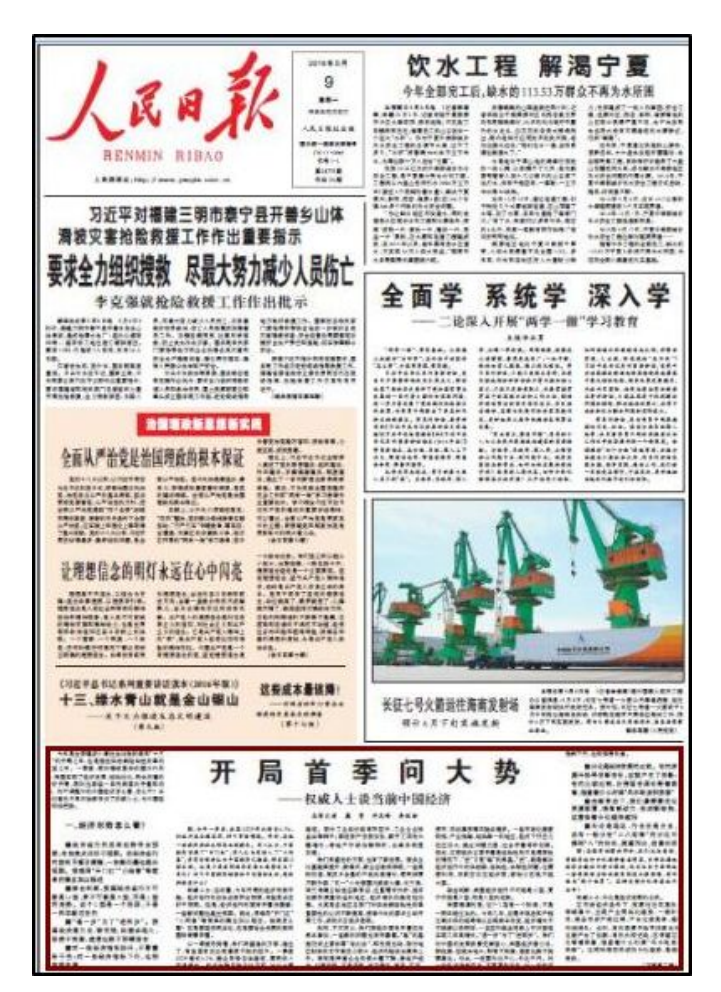
Image: Front page of the May 9, 2016 issue of People's Daily, featuring an article by an unnamed "authoritative person" on China's economic reforms.

Despite its benefits, the external risks associated with the BRI may still be too much to bear for Chinese SOEs. In the last year, Beijing has invested less in the BRI, and the dream of creating a win-win network of "enhanced economic interconnectivity" has had limited effect in mitigating economic crises such as the U.S.-China trade war or the global pandemic (China Brief, <u>September 26, 2019; November 1, 2019; March 16</u>). In the wake of new foreign hostilities, and a slowing global economy exacerbated by the ongoing COVID-19 pandemic, the CCP leadership has ramped up efforts to reduce China's reliance on overseas markets and technology to drive economic growth. This drive has culminated in Xi Jinping's recent push for a new "dual circulation" (双循环, shuangxunhuan ) economic model (<u>China Brief</u>, August 14, 2020; <u>Asia Times</u>, August 24; <u>Xinhua</u>, September 2).