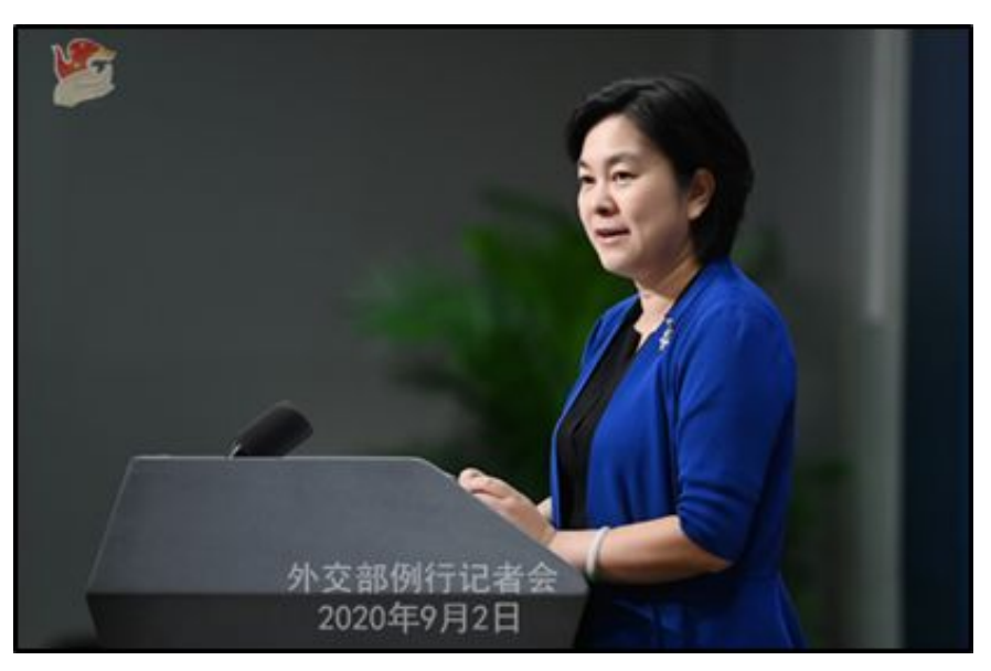
Image: At a September 2 press conference, PRC Foreign Ministry spokesperson Hua Chunying asserted that "We firmly oppose any country providing convenience in any form for the 'Tibet independence' forces' separatist activities," and referenced "the connection between so-called 'Tibetans in exile' and the Indian border troops."

India's use of the SFF has evoked a strong response from Beijing. The PRC Ministry of Foreign Affairs stated that it would "firmly oppose any country providing convenience in any form for the 'Tibet independence' forces' separatist activities" (PRC Foreign Ministry, September 2). Chinese commentators have dismissed the SFF as neither "special" nor "elite," and described its Tibetan personnel as mere "cannon fodder" for the Indian Army. They further warned India that, were it to play the Tibet card and support Tibetan "secessionism," there would be "consequences"—involving "countermeasures" that would inflict "pain" on India (Global Times, September 3; Global Times, September 4).