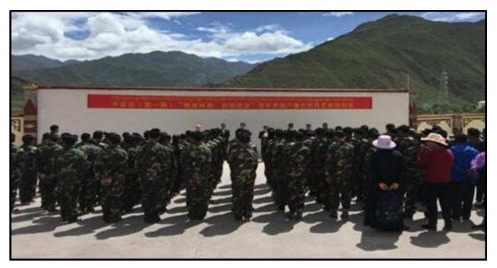
Image 1: Military-style training of "rural surplus laborers" in the Chamdo region of Tibet, June 2016. (Image source: <u>Tibet's Chamdo</u>, June 30, 2016).

The labor transfer policy mandates that pastoralists and farmers are to be subjected to centralized "military-style" (军旅式, junlüshi ) vocational training, which aims to reform "backward thinking" and includes training in "work discipline," law, and the Chinese language. Examples from the TAR's Chamdo region indicate that the militarized training regimen is supervised by People's Armed Police drill sergeants, and training photos published by state media show Tibetan trainees dressed in military fatigues (see accompanying images).