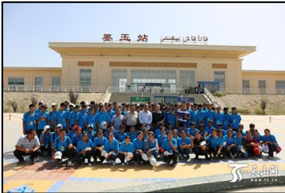
Figure 2: Rural surplus laborers pose for a photo outside of the Karakax rail station on August 24, 2017, before leaving to work in eastern Anhui province as part of an Anhui-Xinjiang Aid labor program.

Labor transfers to other provinces usually take place under the umbrella of Xinjiang Aid, although their coercive aspects appear to be predominantly rooted in Xinjiang’s locally developed labor transfer program. Key policies and other official documents that describe the transfer mechanism and provide evidence for its coercive elements (including the Nankai Report) either do not mention “Xinjiang Aid” or only mention this mechanism as a general umbrella term without ascribing core aspects of coercion to it. [6] For labor transfers within Xinjiang, Xinjiang Aid mobilizes corporations from eastern China to invest in Xinjiang’s manufacturing. For cross-provincial transfers, local Xinjiang governments liaise with Xinjiang Aid counterparts to negotiate opportunities and conditions.