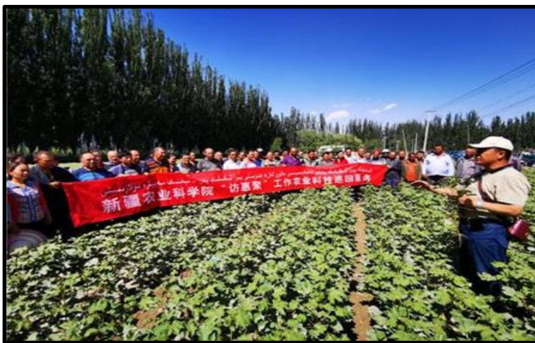
Figure 8: Work teams from Yuepuhu (Yopurga) County were dispatched through government-organized transfers throughout Kashgar Prefecture to do industrial and agricultural labor as part of the state’s poverty alleviation work in 2019.

According to the Nankai Report, those transferred to nearby locations largely end up in local construction or textile companies.[54] Such transfers can take place to satellite factories located in the same village, or companies located in the same township or county.[55] Cross-regional transfers within Xinjiang often occur either for seasonal labor such as cotton picking or seed-sowing or to staff state-owned enterprises in northern Xinjiang. The Nankai Report indicates that local labor transfers often involve private enterprises that are incentivized by the state through subsidies to employ such laborers.