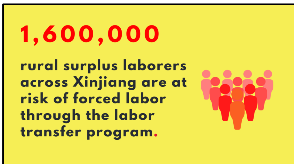
Figure 1: Based on the author's calculations, up to 1.6 million and around 60 percent of rural surplus laborers across Xinjiang are at risk of being coerced into forced labor under the ILO definition. See Section 2.7 and endnote 62 of this report for more details.

An independent legal analysis of the new evidence presented in this report—which was peer reviewed by four leading experts on international criminal law—states that there are “credible grounds to conclude” that Xinjiang’s labor transfer program meets the criteria of two Crimes Against Humanity under Article 7 of the Rome Statue (see Appendix B).[1] The program violates first the Crime Against Humanity of Forcible Transfer (Article 7 (1)(d)), which relates to safeguarding the “protected interests and rights of persons to ‘live in their communities and homes’” (Appendix B, Section B.1); and second the Crime Against Humanity of Persecution (Article 7 (1)(h)).