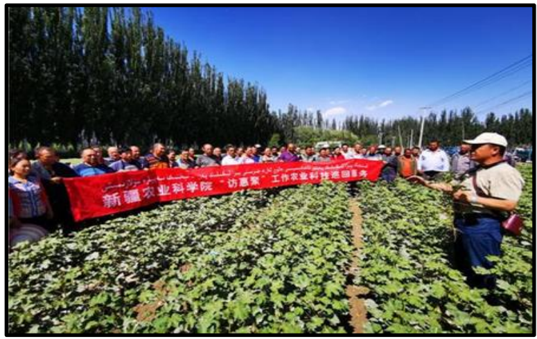
Figure 8: Work teams from Yuepuhu (Yopurga) County were dispatched through government-organized transfers throughout Kashgar Prefecture to do industrial and agricultural labor as part of the state's poverty alleviation work in 2019 (Source: <u>Sohu</u>).

According to the Nankai Report, those transferred to nearby locations largely end up in local construction or textile companies.[54] Such transfers can take place to satellite factories located in the same village, or companies located in the same township or county.[55] Cross-regional transfers within Xinjiang often occur either for seasonal labor such as cotton picking or seed-sowing or to staff state-owned enterprises in northern Xinjiang. The Nankai Report indicates that local labor transfers often involve private enterprises that are incentivized by the state through subsidies to employ such laborers.