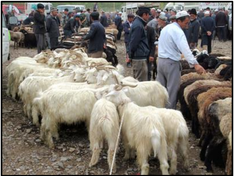
Figure 13: A photo of a livestock market northwest of Kashgar, taken on September 17, 2017. The Nankai Report observes that the scale of "centralized, large-scale management of livestock and land" has dramatically increased, facilitating subsequent labor transfers.

The government has embarked on an all-out campaign to enforce the land transfer scheme. In 2019, a region in Qinghe County, Altay Prefecture mass-converted pastoralists to laborers by "liberating 90 percent of the village's labor force from grazing" through herd trusteeship (<u>Altay News Online</u>, July 16, 2019; compare with <u>Xinjiang Daily</u>, August 30, 2019). Following "vigorous promotion," 59,000 households in Aksu had transferred 154,500 hectares of land to such centers by November 2020, resulting in the labor transfer of 73,300 persons (<u>Aksu Daily</u>, November 24, 2020). Such drastic livelihood changes are unlikely to be due to voluntary choice. A study published in July 2020 that surveyed rural surplus laborers in Kalpin County found that only 23 percent of respondents were "willing" participate in the land caretaking scheme, 47 percent were "unwilling", and 30 percent were "unsure."[ 70 ] A 2018 government report from Bayingol Prefecture describes the momentum behind such coercive land transfers: