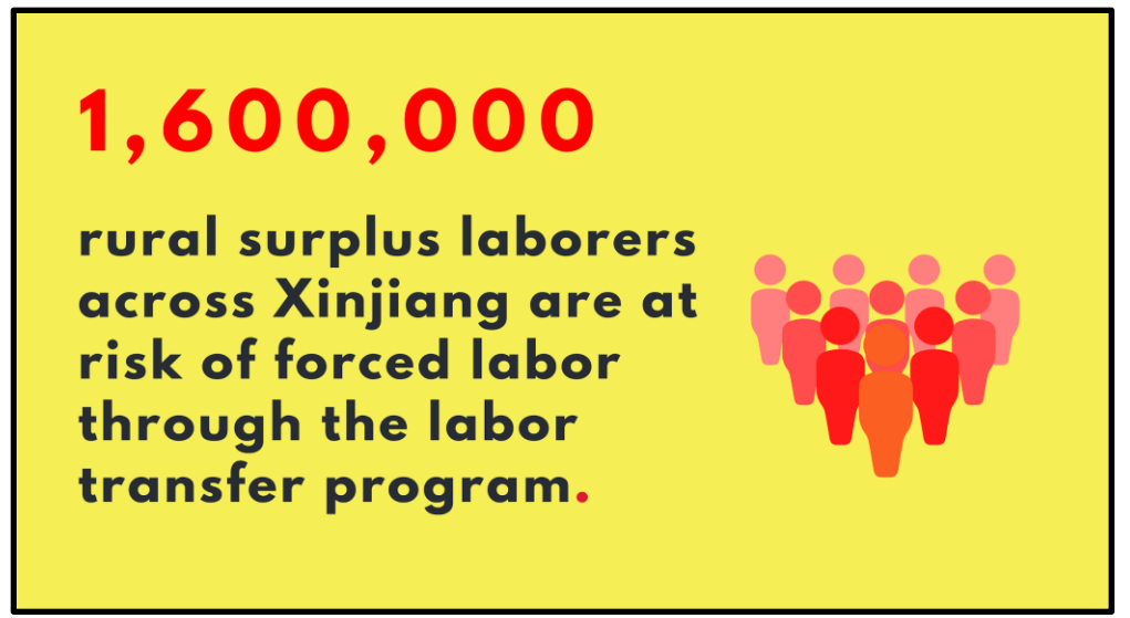
Figure 1: Based on the author's calculations, up to 1.6 million and around 60 percent of rural surplus laborers across Xinjiang are at risk of being coerced into forced labor under the ILO definition. See Section 2.7 and endnote 62 of this report for more details.

An independent legal analysis of the new evidence presented in this report—which was peer reviewed by four leading experts on international criminal law—states that there are "credible grounds to conclude" that Xinjiang's labor transfer program meets the criteria of two Crimes Against Humanity under Article 7 of the Rome Statue (see Appendix B). [1] The program violates first the Crime Against Humanity of Forcible Transfer (Article 7 (1)(d)), which relates to safeguarding the "protected interests and rights of persons to 'live in their communities and homes'" (Appendix B, Section B.1); and second the Crime Against Humanity of Persecution (Article 7 (1)(h)).