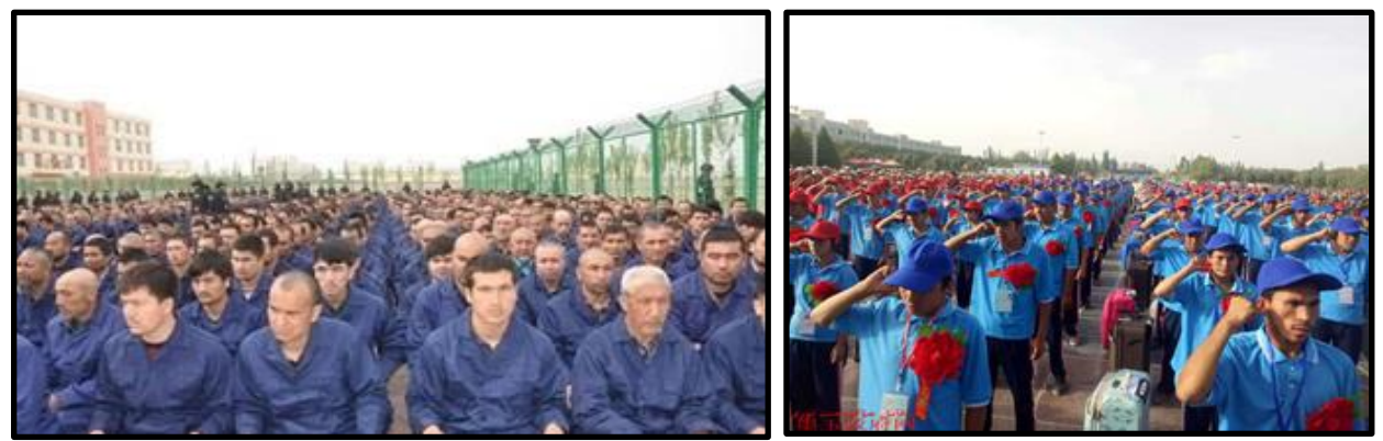
Figure 5,6: Detainees listen to "de-radicalization talks" at a securitized re-education facility in Lop County in 2017 (5, left). Rural surplus laborers from Karakax (Moyu) County are sent to labor in Urumqi and Wujiaqu on June 19, 2017 after undergoing "strict political review, physical examination, selection, and pre-job training" (6, right).

The Nankai Report goes on to state that the "short-term high pressure" strategy should be changed to a "long-term" approach with a focus on vocational skills training and poverty alleviation. The latter goal is to be achieved particularly through labor transfers, which fulfill two important long-term goals. First, they are an "important method to reform, meld and assimilate a small number of Uyghurs" (referring to the comparatively small population of Uyghurs that is transferred outside of Xinjiang).[27] The term for "reform" (感化, ganhua) is commonly used in the Chinese justice system to refer to the reform and education of criminals, especially juvenile delinquents (Supreme People's Procuratorate, March 1, 2020; People's Court Daily, August 16, 2013). Such reasoning is consistent with Chinese research claims that there is a statistical correlation between unemployment and support for "splittism" (分裂主义, fenliezhuyi) and domestic terrorism.[28] Another passage in the Report emphasizes that labor transfers can "comparatively quickly change poor people's views."[29]