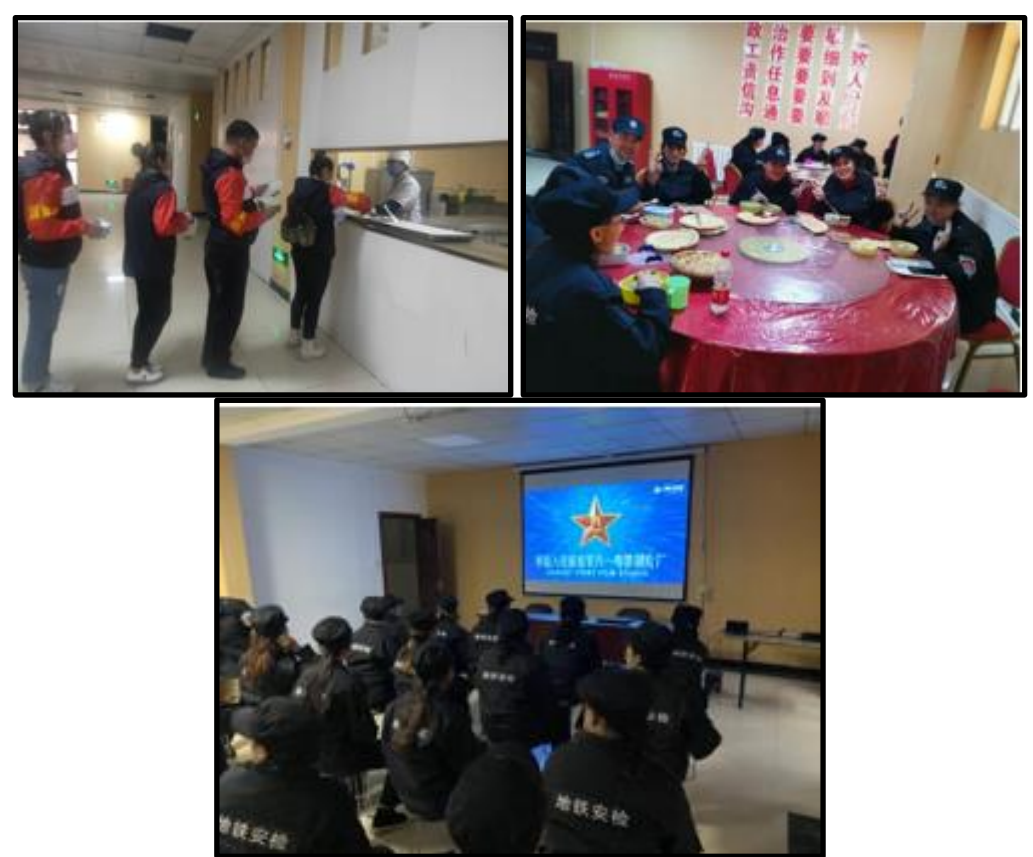
Figure 10, 11, 12: Transferred laborers receive food from the company cafeteria (10, upper left), eat meals alongside security staff (11, upper right), and are organized to watch "red revolutionary movies" (12, bottom). According to one company's promotional materials, such care and oversight is designed to "implement the poverty alleviation policy, but also to enable the employees to fully feel the warmth of our company family.

集中管理, shuangyu ganbu zhuchang peihe jizhong guanli ). [68] Officials "eat and live" together with the laborers and perform Chinese language training at night.