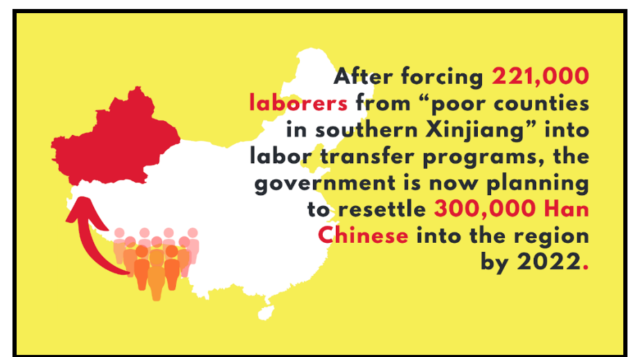
Figure 7: Beijing plans to "optimize the population structure of southern Xinjiang." For sourcing, see endnotes 23 and 31 of this report.

Beijing has concrete plans to "optimize the population structure of southern Xinjiang" and achieve "longterm social stability" in the region through a large-scale plan to settle 300,000 Chinese, mostly from outside Xinjiang, in southern Xinjiang by 2022 (XPCC, April 26, 2020). [32] This plan relies on the paramilitary colonial settler entity Xinjiang Production and Construction Corps (XPCC, 新疆生产建设兵团, xinjiang shengchan jianshe bingtuan ), and aims to place large numbers of Han settlers into urban agglomerations in southern Xinjiang. To this end, it ironically performs the reverse task of the Uyghur labor transfer by seeking to attract thousands of skilled workers from eastern China to industrial zones in the XUAR (<u>Bingtuan Daily</u>, April 25, 2019; <u>Yili Kenqu News</u>, January 10, 2020). Together, the Han migration program and the labor transfer program are intended to lastingly alter the region's demographic composition.