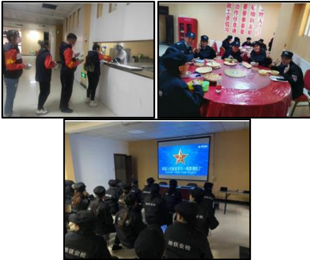
Figure 10, 11, 12: Transferred laborers receive food from the company cafeteria (10, upper left), eat meals alongside security staff (11, upper right), and are organized to watch “red revolutionary movies” (12, bottom). According to one company’s promotional materials, such care and oversight is designed to “implement the poverty alleviation policy, but also to enable the employees to fully feel the warmth of our company family.

集中管理, shuangyu ganbu zhuchang peihe jizhong guanli ). [68] Officials “eat and live” together with the laborers and perform Chinese language training at night.