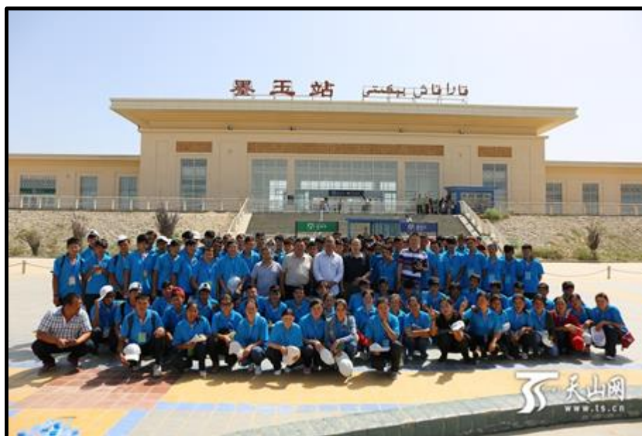
Figure 2: Rural surplus laborers pose for a photo outside of the Karakax rail station on August 24, 2017, before leaving to work in eastern Anhui province as part of an Anhui-Xinjiang Aid labor program.

Labor transfers to other provinces usually take place under the umbrella of Xinjiang Aid, although their coercive aspects appear to be predominantly rooted in Xinjiang’s locally developed labor transfer program. Key policies and other official documents that describe the transfer mechanism and provide evidence for its coercive elements (including the Nankai Report) either do not mention “Xinjiang Aid” or only mention this mechanism as a general umbrella term without ascribing core aspects of coercion to it. [6] For labor transfers within Xinjiang, Xinjiang Aid mobilizes corporations from eastern China to invest in Xinjiang’s manufacturing. For cross-provincial transfers, local Xinjiang governments liaise with Xinjiang Aid counterparts to negotiate opportunities and conditions.