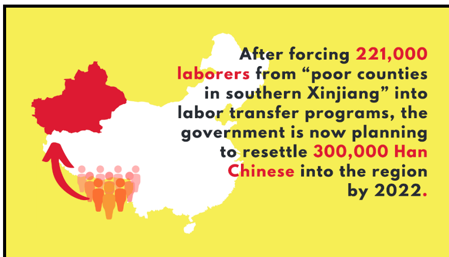
Figure 7: Beijing plans to “optimize the population structure of southern Xinjiang.” For sourcing, see endnotes 23 and 31 of this report.

Beijing has concrete plans to “optimize the population structure of southern Xinjiang” and achieve “long-term social stability” in the region through a large-scale plan to settle 300,000 Chinese, mostly from outside Xinjiang, in southern Xinjiang by 2022 ( XPCC , April 26, 2020).[32] This plan relies on the paramilitary colonial settler entity Xinjiang Production and Construction Corps (XPCC, 新疆生产建设兵团, xinjiang shengchan jianshe bingtuan ), and aims to place large numbers of Han settlers into urban agglomerations in southern Xinjiang. To this end, it ironically performs the reverse task of the Uyghur labor transfer by seeking to attract thousands of skilled workers from eastern China to industrial zones in the XUAR ( Bingtuan Daily , April 25, 2019; Yili Kenqu News , January 10, 2020). Together, the Han migration program and the labor transfer program are intended to lastingly alter the region’s demographic composition.