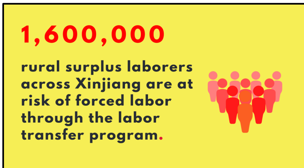
Figure 1: Based on the author's calculations, up to 1.6 million and around 60 percent of rural surplus laborers across Xinjiang are at risk of being coerced into forced labor under the ILO definition. See Section 2.7 and endnote 62 of this report for more details.

An independent legal analysis of the new evidence presented in this report—which was peer reviewed by four leading experts on international criminal law—states that there are “credible grounds to conclude” that Xinjiang’s labor transfer program meets the criteria of two Crimes Against Humanity under Article 7 of the Rome Statute (see Appendix B).[1] The program violates first the Crime Against Humanity of Forcible Transfer (Article 7 (1)(d)), which relates to safeguarding the “protected interests and rights of persons to ‘live in their communities and homes’” (Appendix B, Section B.1); and second the Crime Against Humanity of Persecution (Article 7 (1)(h)).