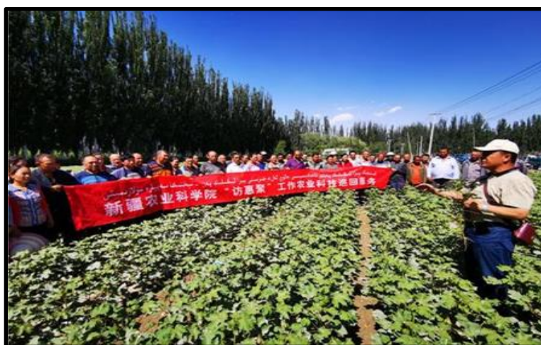
Figure 8: Work teams from Yuepuhu (Yopurga) County were dispatched through government-organized transfers throughout Kashgar Prefecture to do industrial and agricultural labor as part of the state’s poverty alleviation work in 2019.

According to the Nankai Report, those transferred to nearby locations largely end up in local construction or textile companies.[54] Such transfers can take place to satellite factories located in the same village, or companies located in the same township or county.[55] Cross-regional transfers within Xinjiang often occur either for seasonal labor such as cotton picking or seed-sowing or to staff state-owned enterprises in northern Xinjiang. The Nankai Report indicates that local labor transfers often involve private enterprises that are incentivized by the state through subsidies to employ such laborers.