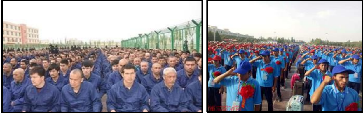
Figure 5,6: Detainees listen to “de-radicalization talks” at a securitized re-education facility in Lop County in 2017 (5, left). Rural surplus laborers from Karakax (Moyu) County are sent to labor in Urumqi and Wujiaqu on June 19, 2017 after undergoing “strict political review, physical examination, selection, and pre-job training” (6, right).

The Nankai Report goes on to state that the “short-term high pressure” strategy should be changed to a “long-term” approach with a focus on vocational skills training and poverty alleviation. The latter goal is to be achieved particularly through labor transfers, which fulfill two important long-term goals. First, they are an “important method to reform, meld and assimilate a small number of Uyghurs” (referring to the comparatively small population of Uyghurs that is transferred outside of Xinjiang). [27] The term for “reform” (感化, ganhua ) is commonly used in the Chinese justice system to refer to the reform and education of criminals, especially juvenile delinquents ( Supreme People’s Procuratorate , March 1, 2020; People’s Court Daily , August 16, 2013). Such reasoning is consistent with Chinese research claims that there is a statistical correlation between unemployment and support for “splittism” (分裂主义, fenliezhuyi ) and domestic terrorism. [28] Another passage in the Report emphasizes that labor transfers can “comparatively quickly change poor people’s views.” [29]