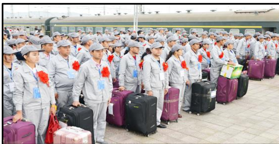
Figure 4: 442 laborers from Kashgar and Hotan in transit to the Zhonghai Group Korla Industrial Park on April 24, 2017.

Since then, Xinjiang’s labor transfer program has become increasingly detailed, intrusive and coercive. The policy of “precise poverty alleviation” (精准扶贫, jingzhun fupin ) was hailed as a means to achieve a “targeted therapy” for lifting every single household out of poverty ( Xinhua , June 6, 2014). In 2016, it was specified that by 2020, 2.61 million people in Xinjiang were to be lifted out of poverty, with 1.74 million people to achieve this primarily through labor transfer and industrialization.[19] In mid-2016, “thought transformation” was mandated to “transform views on employment” (推动就业观念转变, tuodong jiuye guannian zhuanbian ) ( XUAR Government , July 7, 2016). The government also specified an “order-oriented” approach to labor transfer: after companies put in “orders” for employees with certain skills, the state would take batches of the targeted populations, train them accordingly, and then deliver them to companies ( State Council , November 23, 2016). An academic study conducted in Kashgar found that by far the greatest share of respondents experienced their first labor transfer in the period between 2014 and 2016.[20]