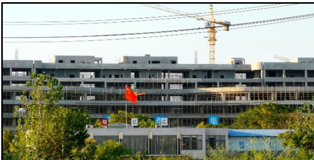
Image: A picture of HSMC factory construction in Wuhan on pause after the company went bankrupt.