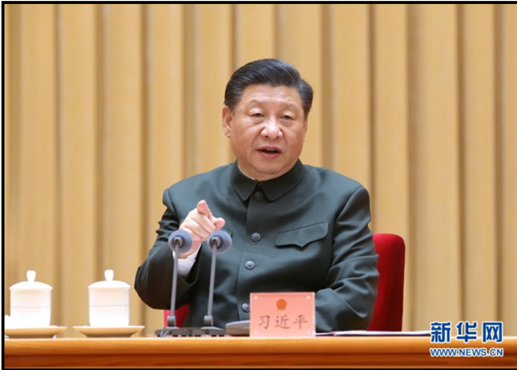
Image: Xi Jinping delivers a speech at the plenary meeting of the PLA and People's Armed Police delegations at the Fourth Session of the 13th National People's Congress on March 9 Image source: Xinhua/Li Gang ).

Less authoritative but nonetheless illuminating statements by Senior Colonel Li Haitao (李海涛) of China's National Defense University provide additional clarification. Li writes that the 2027 goal "spreads out the blueprint for the development of a strong army in the new era," forming a new three-step arrangement with 2027, 2035 and mid-century delineating each step of development ( Ministry of National Defense , December 14, 2020).