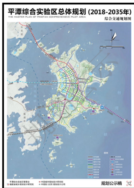
Image: A map of the Pingtan Comprehensive Pilot Area's comprehensive transportation plan

CREEC (Guangdong) Harbor Survey and Design Company, a state-controlled mixed ownership enterprise, has produced a design for a Pingtan-Hsinchu [Taiwan] railway ferry terminal consisting of two berths for railway ferries and one berth for railway ferry maintenance.[4] As of the time of writing, this project has not received official approval. But Beijing has long planned to build a cross-Taiwan Strait undersea tunnel from Pingtan to Hsinchu, so a railway ferry could presumably augment or replace that planned transportation link ( China Brief , August 31, 2020).