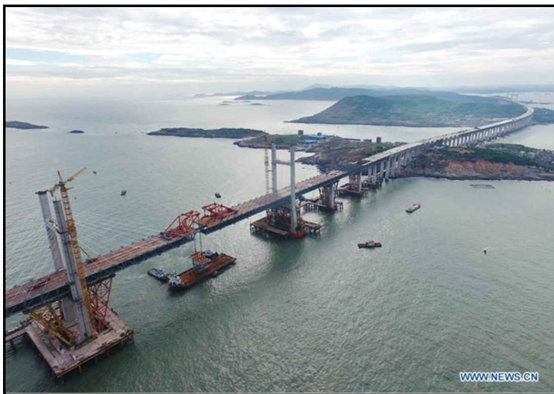
Image: An aerial photo taken on September 21, 2019 shows construction on the Pingtan Strait Road-Rail Bridge. Construction of the main structure was completed in the same year and the bridge was opened in 2020.

Within the last decade, Pingtan Island (平潭岛, Pingtán Dao ), which is the nearest territory to the Republic of China (ROC or Taiwan) controlled by the People's Republic of China (PRC or China), has transformed from a relative backwater into a significant transportation hub. The opening of the Pingtan Strait Road-Rail Bridge (平潭海峡公铁大桥, Pingtán Haixia Gong-Tie Daqiao )—first to automobile traffic in October 2020 and then to high-speed rail traffic in December 2020—marked the island's connection to the PRC's integrated transportation system (综合交通运输体系, Zonghe Jiaotong Yunshu Tixi ) ( People's Daily , October 9, 2020; CGTN , December 27, 2020). Beijing sees developing Pingtan's transportation infrastructure as facilitating deeper engagement between the PRC and Taiwan. It intends for this increased engagement to promote the integration and eventual unification of ROC-controlled territories with mainland China ( Fjbt.gov.cn , January 31, 2019).