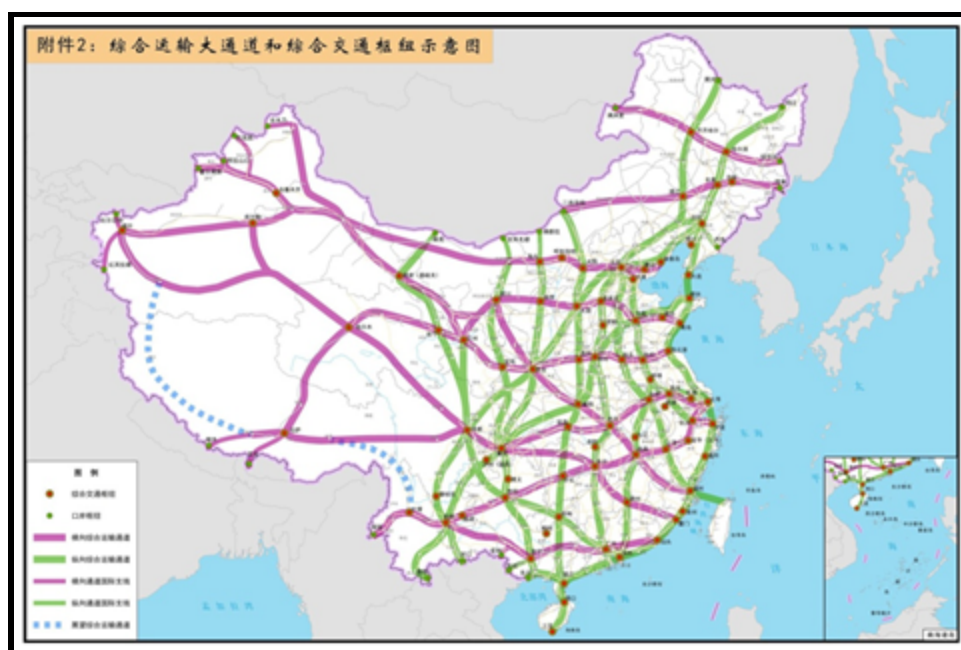
Image: A map of the PRC's national integrated transportation corridors and integrated transportation hubs

Chinese armed forces have used components of the national transportation corridors in military exercises before ( China National Defense News , October 9, 2014). For example, the Coastal Transportation Corridor that runs from Tongjiang, Heilongjiang Province in the north to Sanya, Hainan Province in the south has been featured in several long-distance military transport exercises ( PLA Daily , October 10, 2012; China National Defense News , August 28, 2016; 81.cn , November 20, 2017).