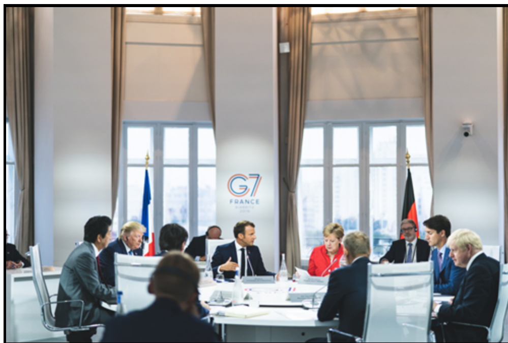
Image: The last G7 Summit, held under France’s leadership in Biarritz from August 24-26, 2019, invited Australia, Chile, India and South Africa as “partners committed...to democratic values and fundamental freedoms” to focus on topics such as digital transformation and climate change.

Leaders of the Group of Seven (G7)—an informal bloc of industrialized nations which includes Britain, Canada, France, Germany, Italy, Japan and the United States—met virtually on February 19 in preparation for an upcoming June summit. The meeting focused on intensifying health cooperation; expanding vaccine development and deployment; “build[ing] back better” global economies in response to the ongoing Covid-19 pandemic and foregrounded sustainable development and climate change cooperation ( G7 UK 2021 , February 19). Although containing China did not feature directly in the official readout from the virtual meeting, the White House had previously stated that U.S. President Joseph Biden would raise the need to “strengthen our collective competitiveness and the importance of updating global rules to tackle economic challenges such as those posed by China” ( White House , February 18). After the event, media reports heralded the event as a beginning in U.S. President Joseph Biden’s efforts to create an alliance of democratic allies to compete with China ( Axios , February 19, Reuters , February 19).