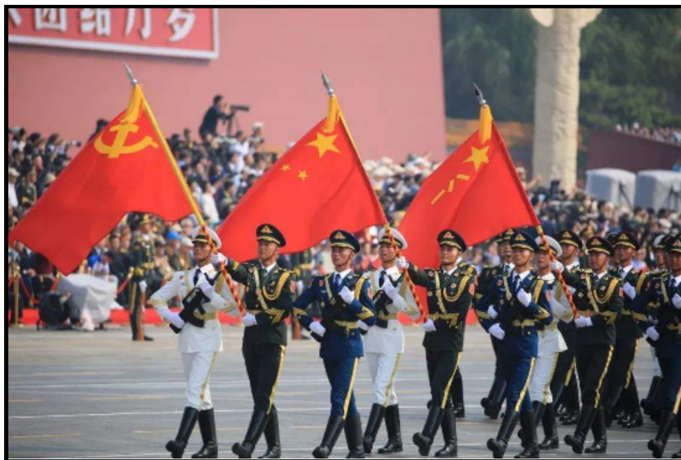
Image: Marching soldiers wave the CCP flag, national flag, and military flag during a National Day military parade in Beijing on October 1, 2019.

The new 2027 goal sparked a flurry of claims that China had moved forward its goal of achieving military modernization from 2035 to 2027. In India, the Hindustan Times reported that the CCP had “finali[z]ed plans to build a fully modern military on par with the United States by 2027” ( Hindustan Times , November 1, 2020). United States media reports claimed that China has “accelerated its timeline” for modernizing the PLA ( Politico , March 15). Even former Australian Prime Minister Kevin Rudd, a widely respected China hand, stated categorically that “Beijing now intends to complete its military modernization program by 2027” ( Foreign Affairs , March/April).