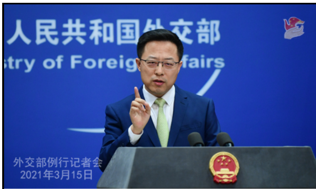
Image: Chinese Ministry of Foreign Affairs spokesperson Zhao Lijian gives a press briefing on March 15. Chinese foreign ministry representatives and state media have been highly critical of the proposed expansion of the G7 before and after the leadership meeting in February.

of the PRC , April 8, 2016). Beijing expressed its “strong [dissatisfaction]” of a 2017 G7 meeting that made “irresponsible reference[s]” to the East and South China Sea maritime disputes ( PRC Ministry of Foreign Affairs , May 28, 2017). More recently, Beijing “firmly oppose[d]” the G7’s joint statement on China’s national security law imposed on Hong Kong last June, and hit back against another G7 joint statement on Hong Kong electoral reforms in March as being “flagrant interference” in China’s domestic affairs and a “vicious smear” ( PRC Ministry of Foreign Affairs , June 18, 2020; PRC Ministry of Foreign Affairs , March 15). A commentary in the state media agency Xinhua complained that the G7’s statement on Hong Kong’s electoral reforms “goes against the facts and exposes the group’s hypocritical nature” ( Xinhua , March 14). Such reactions show that Beijing sees the G7 as an anti-China bloc and an attempt by Washington to maintain its supremacy in the international order through alliance politics. In an attempt to discredit the framework, Chinese media has increasingly painted the G7 as irrelevant in the new era ( CGTN , August 25, 2019).