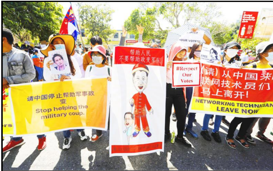
Image: Anti-coup protestors demonstrate outside the Chinese embassy holding signs in both Mandarin and English that are aimed at an international audience, on February 11.

China is concerned about the instability and unrest in Myanmar. Anti-coup protests are showing no signs of abating and have also included anti-Chinese elements ( The Irrawaddy , March 8; Rappler , March 15). Continued unrest would jeopardize China's many state and private investments in Myanmar and would at a minimum slow down the implementation of projects. Many in Myanmar believe that Beijing had a hand in the coup and is providing the junta with the technical know-how to block social media and access the personal data of pro-democracy activists. Protestors have been staging rallies outside the Chinese Embassy in Yangon and are calling on the Chinese government to stop supporting the junta ( The Irrawaddy , February 15).