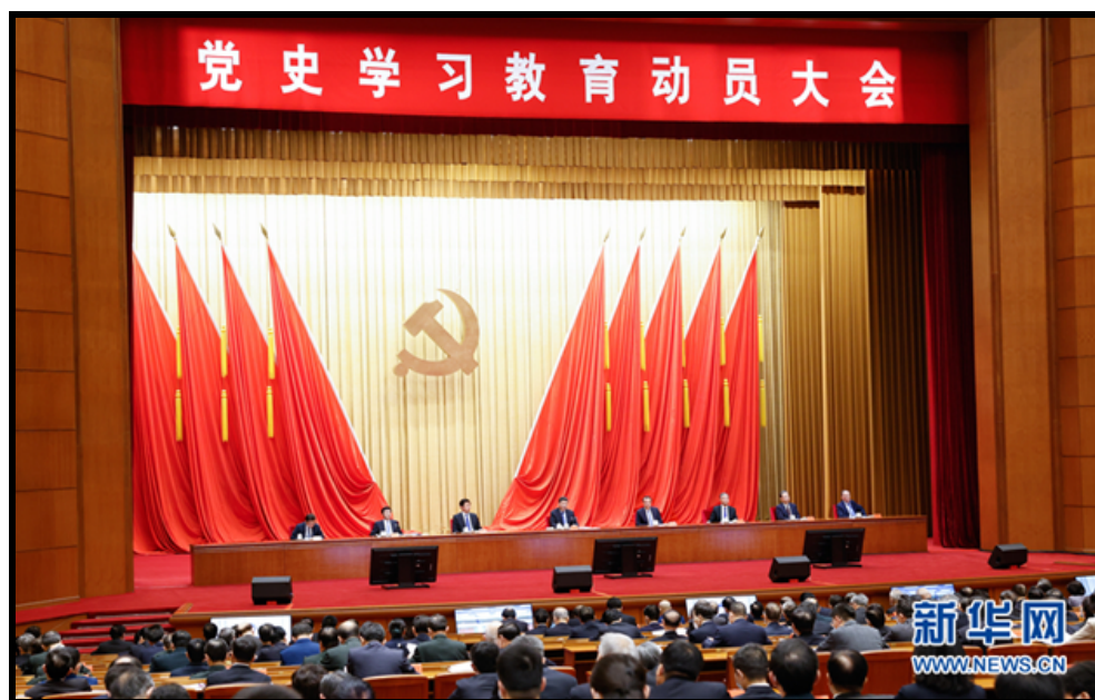
Image: According to media reporting, CCP General Secretary Xi Jinping “teaches the first lesson” at the Party History Study and Education Mobilization Conference held in Beijing on February 20.

To summarize, the party history study campaign is aimed at indoctrinating a “correct” and progressive view of history that presents the CCP as the successful and legitimate leader of the People’s Republic of China (PRC) and Xi Jinping Thought as the scientific guiding force for the Sinicization of Marxism, shoring up domestic support for the party and bolstering its ideological competitiveness during a new era of enhanced great power competition.