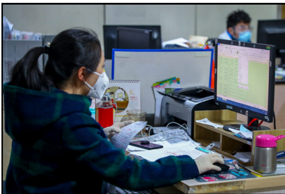
Image: A young neighborhood committee worker in Wuhan, Hubei on February 23, 2020. The CCP has worked to expand and improve its grassroots governance, privileging more professionalized and younger community workers..

As changing economic, social, and political landscapes brought by the Reform and Opening campaign presented new governance challenges for central authorities, the party-state has sought to improve public service and encourage greater democracy and self-governance at the local level. Some examples of this include institutionalizing village elections and legalizing homeowners' associations. At the same time, the fundamental principle of party leadership has not been challenged, and under Xi the Chinese Communist Party (CCP) has directed greater attention to grassroots party building.