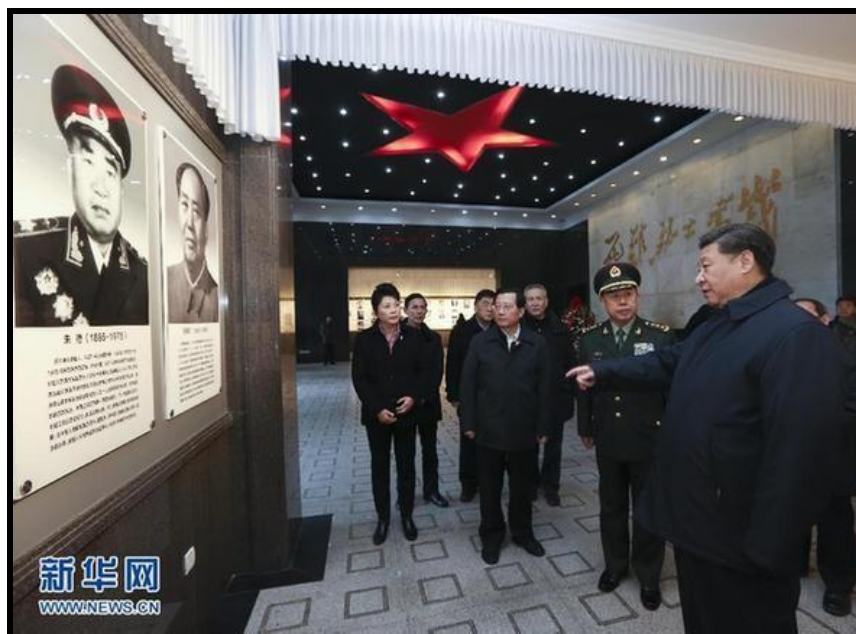
Image: CCP General Secretary Xi Jinping points to a memorial wall displaying revolutionary figures (including Mao) at the Jinggangshan Revolutionary Martyrs Memorial Hall during a visit on February 2, 2016.

Before he became the supreme leader of the Chinese party-state in 1949, Mao had posed as an advocate of democracy in many interviews with Western media. In a 1944 press conference with European and American press members, the Great Helmsman said, "China has many shortcomings, the most serious of which is the lack of democracy," adding, for his Western audiences, "The Chinese people need democracy... only then can a good country be constructed" ( Oriental Daily News , May 9, 2019). But he was telling opportunistic lies.[1]