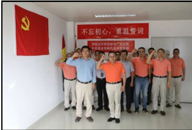
Image: Party branch members of Shenzhen Energy Suogu Power Plant and the Ghana Representative Office of the China-Africa Development Fund jointly organized activities to study the revised party constitution on June 23, 2018. Members retook the party oath against the backdrop of a slogan saying “Do not forget the original aspirations, Review the oath”.