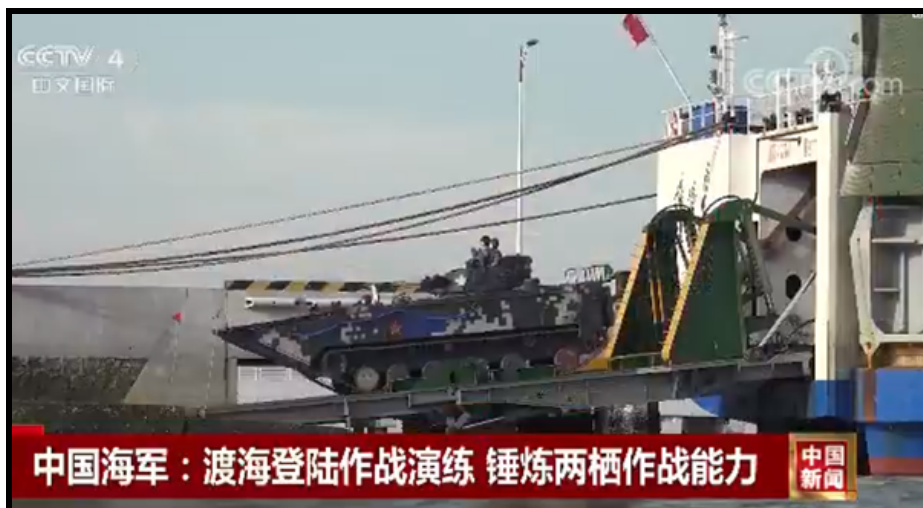
Image: A PLANMC ZBD-05 loading onto the Bang Chui Dao, featuring its new stern ramp during the July 2020 exercise. The new hydraulic cylinders used to depress the ramp are shown in the stowed position for regular dock loading.