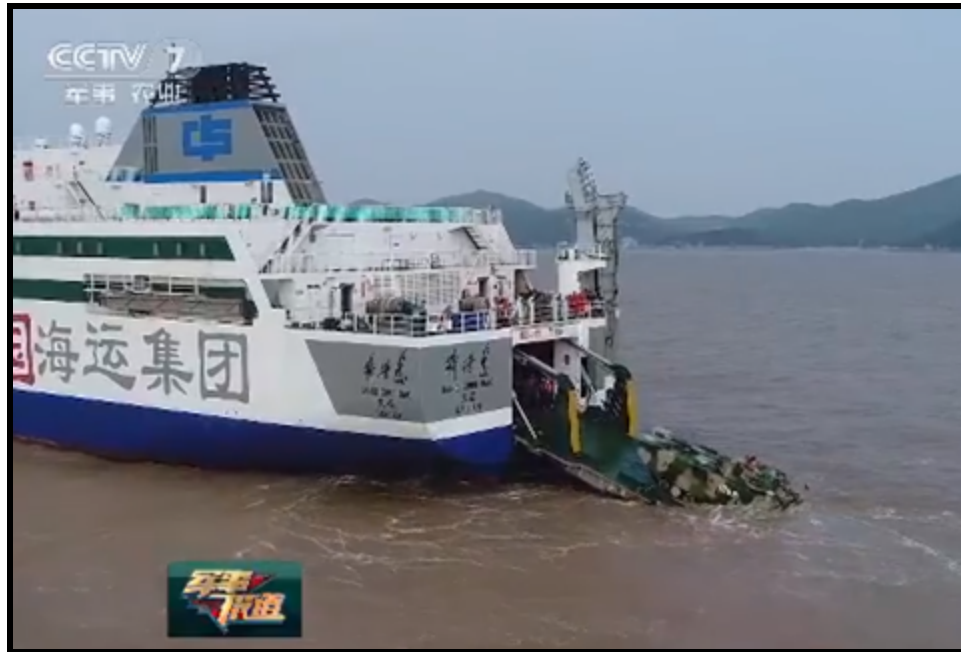
Image: May 5, 2019 CCTV coverage showing amphibious recovery.

media profile of an officer at the former Nanjing Military Region Military Representative Office for Navigational Matters, showing the vessel's ability to recover a ZTD-05 amphibious assault vehicle, likely from a PLAGF amphibious unit ( CCTV-Military Report , May 14, 2019).