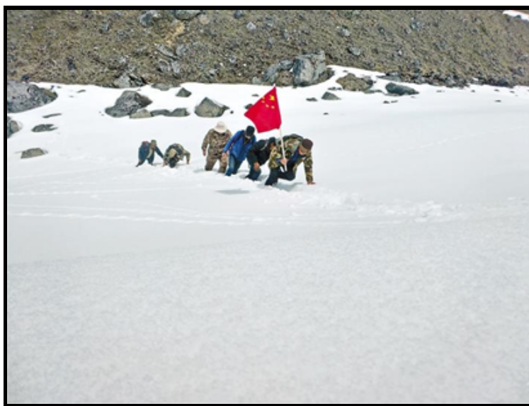
Image: Members of the Gyalaphug Joint Defense Team (杰罗布村联防队, Jieluobu lian fang dui) take part in a border patrol in 2020. While Chinese sources have claimed that Gyalaphug lies on the border, foreign analysts have argued that it sits several miles inside Bhutanese territory.

Meanwhile, the Sino-Bhutanese border dispute has become more complicated, with China escalating its claims and taking robust steps to change the status quo on the ground. According to Smruti S. Pattanaik, an Indian analyst on South Asian security issues, "it is very likely that China will raise its new territorial claims [at the upcoming border talks] as a pressure tactic." [1] The talks will be closely monitored not just in Beijing and Thimphu but also in New Delhi. Under the 2007 India-Bhutan Treaty of Friendship, India is virtually responsible for Bhutan's security ( India Ministry of External Affairs , March 5, 2007). Additionally, China's claims to territories in Bhutan have major implications for India's national security and territorial integrity.