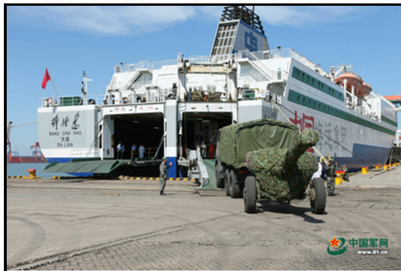
Image: Bang Chui Dao loading PLA forces at a conventional terminal in 2014, prior to its ramp conversion (Source: China Military Online ).

The ship's participation is not abnormal. It has supported PLA transportation exercises for years, for example in 2014 (shown below). According to its AIS transmissions, the Bang Chui Dao was very busy in the summer of 2020. It made multiple trips beyond the Bohai/Yellow Sea to areas with PLA landing ships and craft, including a visit to a PLA Ground Forces (PLAGF) watercraft site in Xiamen, Fujian Province which is close to a PLAGF amphibious brigade in Zhangzhou (漳州), and possibly conducted activities in waters near Kinmen (金门, Jinmen ) Island.[2] Little information is available on what it did there. Bang Chui Dao also played a significant role in "Eastern Transportation-Projection 2020A" (东部运投-2020A), an exercise held by the PLA Joint Logistics Support Force in the Eastern Theater Command between June and August 2020.