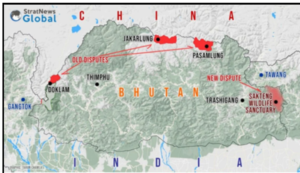
Image: A map of territory that is under dispute between China and Bhutan, including potential new Chinese claims to Sakteng, in eastern Bhutan. Sakteng and Doklam are of strategic significance to India, which also has a disputed border with China along the Line of Actual Control (LAC) (not shown) that extends around Bhutan. (Source: Stratnews Global ).

China's most recent territorial claims in Sakteng are of immense strategic value. The area adjoins the Indian state of Arunachal Pradesh, which contains disputed territory between China and India. Tawang, a key bone of contention between India and China in the eastern sector of the Line of Actual Control (LAC), lies to Sakteng's northeast and is vital to Indian border defense. Control over Doklam and Sakteng together will give China significant military advantages in dealing with India in the eastern sector of the LAC. India plans to build a road from Guwahati to Tawang via the Sakteng Wildlife Sanctuary, which will reduce travel distance and strengthen its ability to speed up the overland mobilization of troops to the disputed Sino-Indian border. China may have added Sakteng to its claimed territories in an effort to pre-empt India's plans for the Guwahati-Sakteng-Tawang road ( Asian Affairs , August 1, 2020).