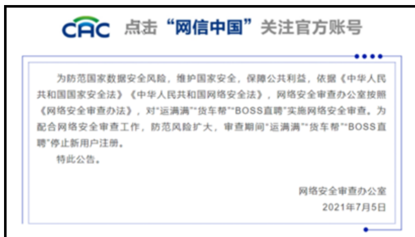
Image: A screenshot of the CAC’s announcement that it will conduct cybersecurity reviews into three companies that recently listed abroad, based on concerns that the export of Chinese data could impact “national security” and “public interest”.

recruiting app BOSS Zhipin (BOSS直聘), which had all recently listed in the U.S. ( South China Morning Post , July 5).