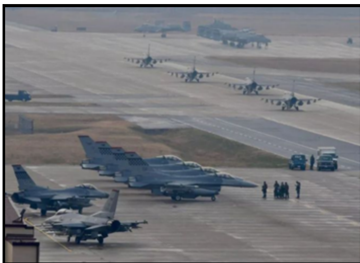
Image: Chinese media reporting noted a recent "large-scale exercise" held in Guam intended to test the "Agile Combat Employment" concept and maintain military superiority in all parts of the world. (Source: 163.com ).

It is important to understand how America's adversaries are perceiving and planning to counteract ACE. This article analyzes the People's Liberation Army's (PLA) publicly available assessment of ACE. Although there is a dearth of sources, the available information shows that the PLA perceives exploitable weaknesses in ACE.