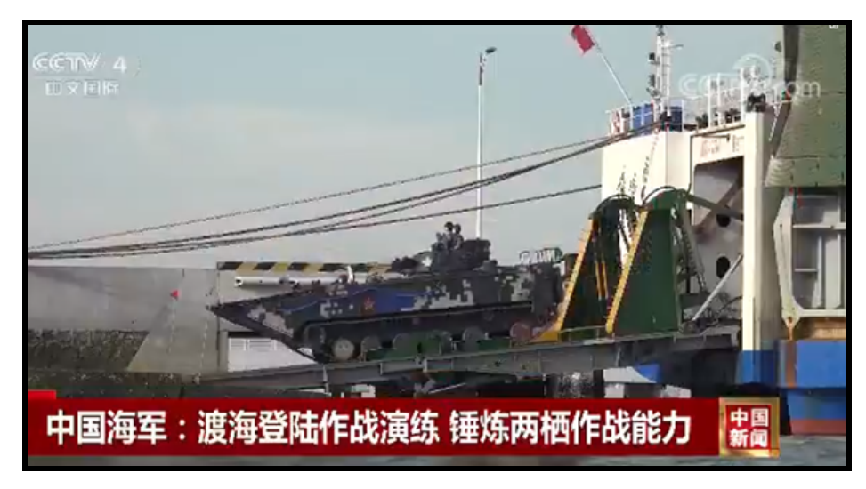
Image: A PLANMC ZBD-05 loading onto the Bang Chui Dao, featuring its new stern ramp during the July 2020 exercise. The new hydraulic cylinders used to depress the ramp are shown in the stowed position for regular dock loading.