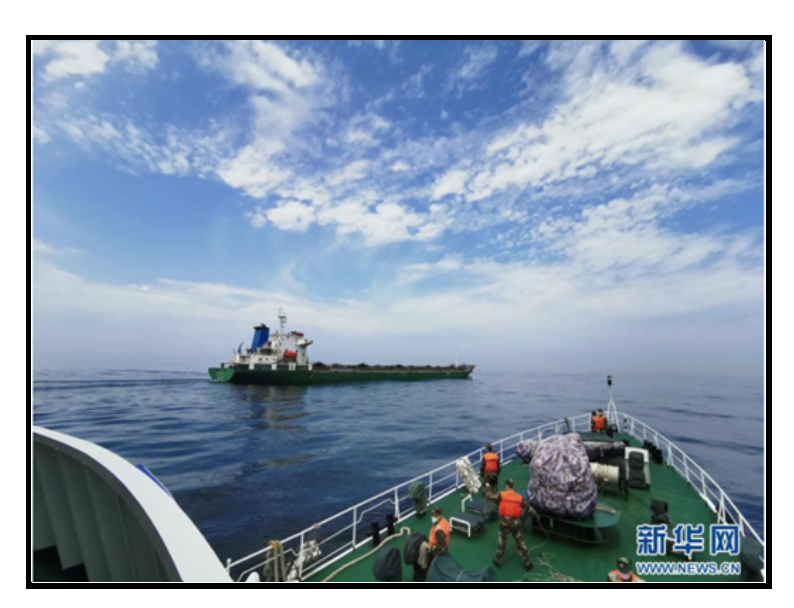
Image: A Chinese Coast Guard vessel approaches a ship suspected to be conducting illegal activity on March 26, 2020. Following years of reforms, Chinese maritime security organizations have been working to strengthen the system of maritime law enforcement.

Other projects include the revised People's Armed Police (PAP) Law (人民武装警察法 (修改), renmin wuzhuang jingcha fa (xiugai)), the revised National Defense Law (国防法 (修改), guofang fa (xiugai)), the revised Maritime Traffic Safety Law (海上交通安全法(修改), haishang jiaotong anquan fa (xiugai)), and the Hainan Free Trade Port (FTP) Law (海南自由贸易港法, Hainan ziyou maoyi gang fa). Taking into account the timing of these various legislative moves, this article sheds light on Chinese leaders' current approaches to maritime issues from a legal perspective and highlights implications for future territorial disputes between China and other stakeholder nations in the South China Sea.