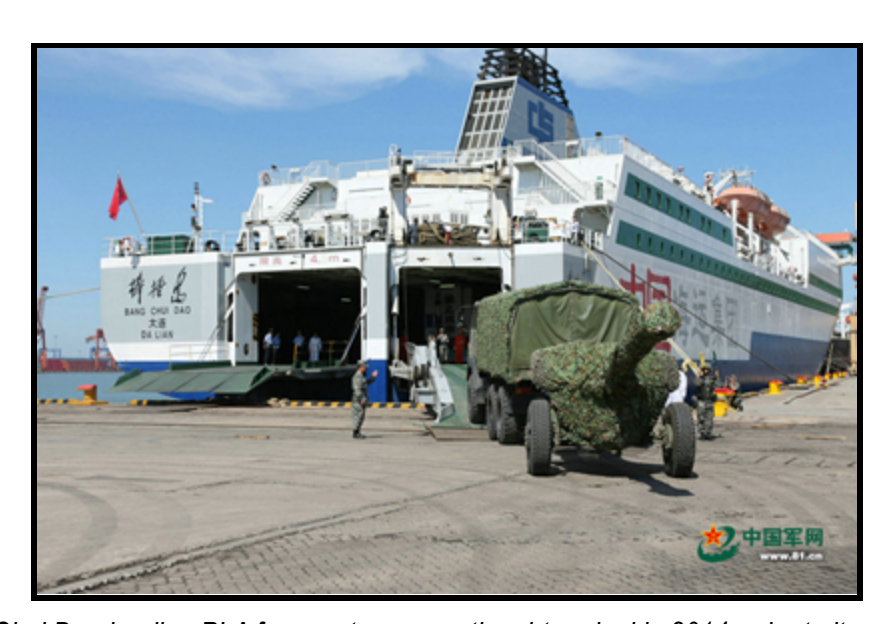
Image: Bang Chui Dao loading PLA forces at a conventional terminal in 2014, prior to its ramp conversion (Source: China Military Online).

The ship's participation is not abnormal. It has supported PLA transportation exercises for years, for example in 2014 (shown below). According to its AIS transmissions, the Bang Chui Dao was very busy in the summer of 2020. It made multiple trips beyond the Bohai/Yellow Sea to areas with PLA landing ships and craft, including a visit to a PLA Ground Forces (PLAGF) watercraft site in Xiamen, Fujian Province which is close to a PLAGF amphibious brigade in Zhangzhou (漳州), and possibly conducted activities in waters near Kinmen (金门, Jinmen ) Island.[2] Little information is available on what it did there. Bang Chui Dao also played a significant role in "Eastern Transportation-Projection 2020A" (东部运投-2020A), an exercise held by the PLA Joint Logistics Support Force in the Eastern Theater Command between June and August 2020.