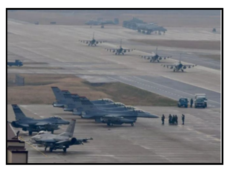
Image: Chinese media reporting noted a recent "large-scale exercise" held in Guam intended to test the "Agile Combat Employment" concept and maintain military superiority in all parts of the world.

It is important to understand how America's adversaries are perceiving and planning to counteract ACE. This article analyzes the People's Liberation Army's (PLA) publicly available assessment of ACE. Although there is a dearth of sources, the available information shows that the PLA perceives exploitable weaknesses in ACE.