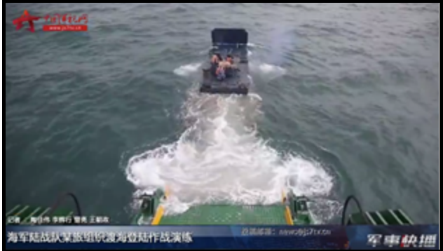
Image: Footage of 1st Brigade Type-05 vehicles using the new ramp system in 2020.

The ship's participation is not abnormal. It has supported PLA transportation exercises for years, for example in 2014 (shown below). According to its AIS transmissions, the Bang Chui Dao was very busy in the summer of 2020. It made multiple trips beyond the Bohai/Yellow Sea to areas with PLA landing ships and craft, including a visit to a PLA Ground Forces (PLAGF) watercraft site in Xiamen, Fujian Province which is close to a PLAGF amphibious brigade in Zhangzhou (漳州), and possibly conducted activities in waters near Kinmen (金门, Jinmen ) Island.[2] Little information is available on what it did there. Bang Chui Dao also played a significant role in "Eastern Transportation-Projection 2020A" (东部运投-2020A), an exercise held by the PLA Joint Logistics Support Force in the Eastern Theater Command between June and August 2020.