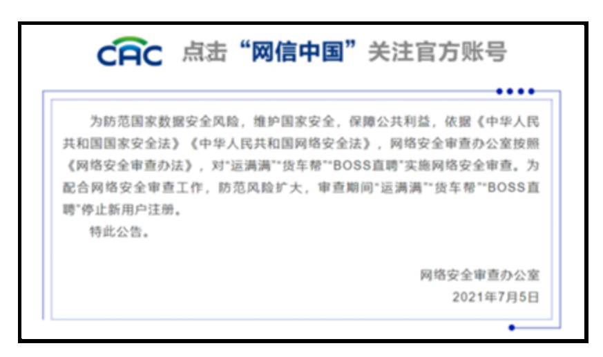
Image: A screenshot of the CAC's announcement that it will conduct cybersecurity reviews into three companies that recently listed abroad, based on concerns that the export of Chinese data could impact "national security" and "public interest" (Source: Sohu).

recruiting app BOSS Zhipin (BOSS直聘), which had all recently listed in the U.S. (<u>South China Morning Post</u>, July 5).