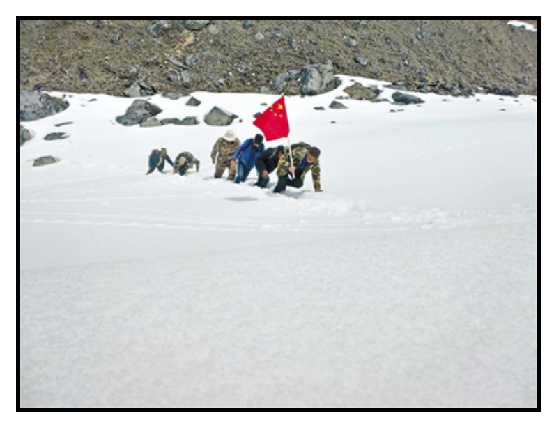
Image: Members of the Gyalaphug Joint Defense Team (杰罗布村联防队, Jieluobu lian fang dui) take part in a border patrol in 2020. While Chinese sources have claimed that Gyalaphug lies on the border, foreign analysts have argued that it sits several miles inside Bhutanese territory.

Meanwhile, the Sino-Bhutanese border dispute has become more complicated, with China escalating its claims and taking robust steps to change the status quo on the ground. According to Smruti S. Pattanaik, an Indian analyst on South Asian security issues, "it is very likely that China will raise its new territorial claims [at the upcoming border talks] as a pressure tactic."[1] The talks will be closely monitored not just in Beijing and Thimphu but also in New Delhi. Under the 2007 India-Bhutan Treaty of Friendship, India is virtually responsible for Bhutan's security (India Ministry of External Affairs, March 5, 2007). Additionally, China's claims to territories in Bhutan have major implications for India's national security and territorial integrity.