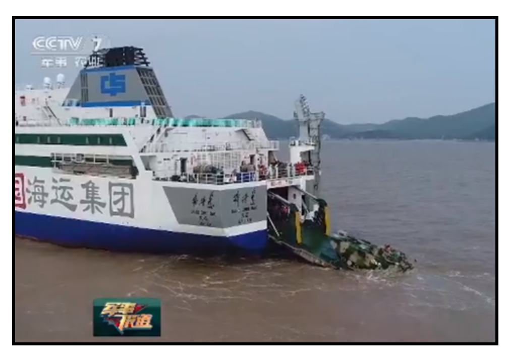
Image: May 5, 2019 CCTV coverage showing amphibious recovery.

media profile of an officer at the former Nanjing Military Region Military Representative Office for Navigational Matters, showing the vessel's ability to recover a ZTD-05 amphibious assault vehicle, likely from a PLAGF amphibious unit (CCTV-Military Report, May 14, 2019).