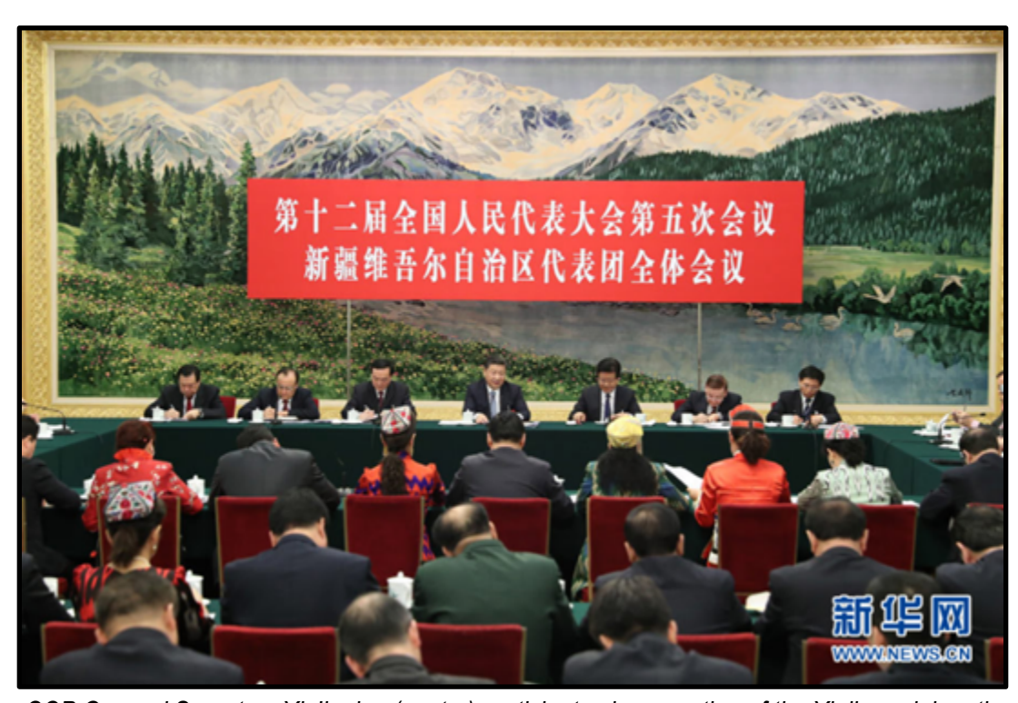
Image: CCP General Secretary Xi Jinping (center) participates in a meeting of the Xinjiang delegation to the Fifth Session of the Twelfth National People's Congress on March 10, 2017, during the annual "Two Sessions".

Documents leaked to the New York Times (also known as the Xinjiang Papers) in November 2019 revealed how Chinese President Xi Jinping laid the groundwork for the Chinese government's draconian campaign of internment in the northwestern Xinjiang Uyghur Autonomous Region (XUAR). In April 2014, while visiting the region, Xi demanded an all-out "struggle against terrorism, infiltration and separatism" that showed "absolutely no mercy." He likened Islamic extremism to a virus, noting that its eradication would require "a period of painful, interventionary treatment" (New York Times, November 16, 2019). But more direct links between Xinjiang's reeducation internment campaign that began in 2017, and the central government—including Xi himself—have so far remained elusive.