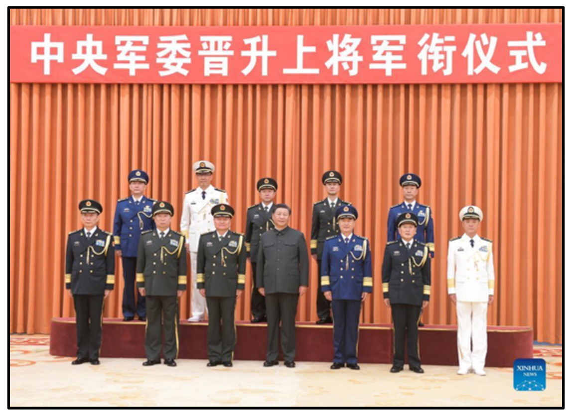
Image: CMC chairman Xi Jinping (center) poses for a group photo with five new general-rank military officials as well as other senior military personnel at a recent promotion ceremony in Beijing on September 6, 2021. The ceremony signaled the changeover of the leadership of the Western and Central Theater Commands at a time when Xi appears to doubt his control over the state security apparatus even as he doubles down on wide-ranging social and economic rectification campaigns that have affected the rest of the state.

Xi's retrogression to Maoism has sparked rare divergent views, as could be seen from how different sectors of the party reacted to a much-noted article by the ideologue blogger Li Guangman (李光满) entitled, "Each person can feel that a series of profound changes is happening" ([每个人都能感受到,一场深刻的变革正在进行!], Mei ge ren dou neng ganshou dao, yi chang shenke de biange zhengzai jinxing). First published on Li's WeChat page on August 29, the piece was then simultaneously run by Xinhua, People's Daily, the CCTV website, and various other prominent official media. Calling for a second Cultural Revolution, Li noted that recent instances of party authorities imposing discipline and fines on quasi-monopolistic private firms as well as social media bans on several "vulgar" and money-grabbing celebrities represented a prelude to "thorough transformations, which can also be called a series of profound revolutions." He also asserted that deep-seated changes were happening in the economic, financial, cultural and political realms: "The theme of the revolution is changing a society centered on capital to a people-based one, as well as a return to the 'original intentions' (初心, chuxin) and quintessence (本质, benzhì)" of the CCP and Chinese socialism (Xinhua, August 29). Li claimed that strict measures against greedy capitalists and effeminate film stars were necessary