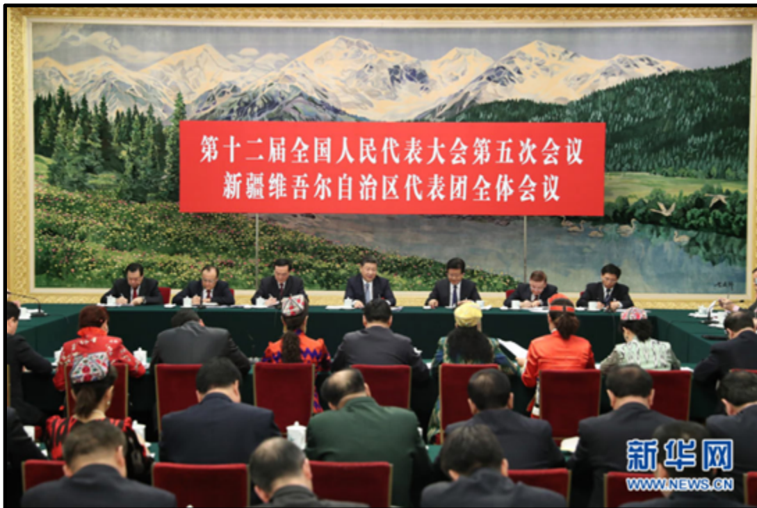
Image: CCP General Secretary Xi Jinping (center) participates in a meeting of the Xinjiang delegation to the Fifth Session of the Twelfth National People’s Congress on March 10, 2017, during the annual “Two Sessions”.

Documents leaked to the New York Times (also known as the Xinjiang Papers) in November 2019 revealed how Chinese President Xi Jinping laid the groundwork for the Chinese government’s draconian campaign of internment in the northwestern Xinjiang Uyghur Autonomous Region (XUAR). In April 2014, while visiting the region, Xi demanded an all-out “struggle against terrorism, infiltration and separatism” that showed “absolutely no mercy.” He likened Islamic extremism to a virus, noting that its eradication would require “a period of painful, interventionary treatment” ( New York Times , November 16, 2019). But more direct links between Xinjiang’s re-education internment campaign that began in 2017, and the central government—including Xi himself—have so far remained elusive.