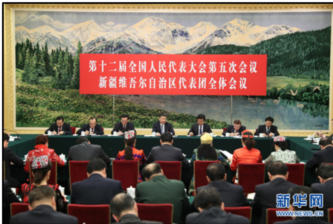
Image: CCP General Secretary Xi Jinping (center) participates in a meeting of the Xinjiang delegation to the Fifth Session of the Twelfth National People’s Congress on March 10, 2017, during the annual “Two Sessions”.

Documents leaked to the New York Times (also known as the Xinjiang Papers) in November 2019 revealed how Chinese President Xi Jinping laid the groundwork for the Chinese government’s draconian campaign of internment in the northwestern Xinjiang Uyghur Autonomous Region (XUAR). In April 2014, while visiting the region, Xi demanded an all-out “struggle against terrorism, infiltration and separatism” that showed “absolutely no mercy.” He likened Islamic extremism to a virus, noting that its eradication would require “a period of painful, interventionary treatment” ( New York Times , November 16, 2019). But more direct links between Xinjiang’s re-education internment campaign that began in 2017, and the central government—including Xi himself—have so far remained elusive.