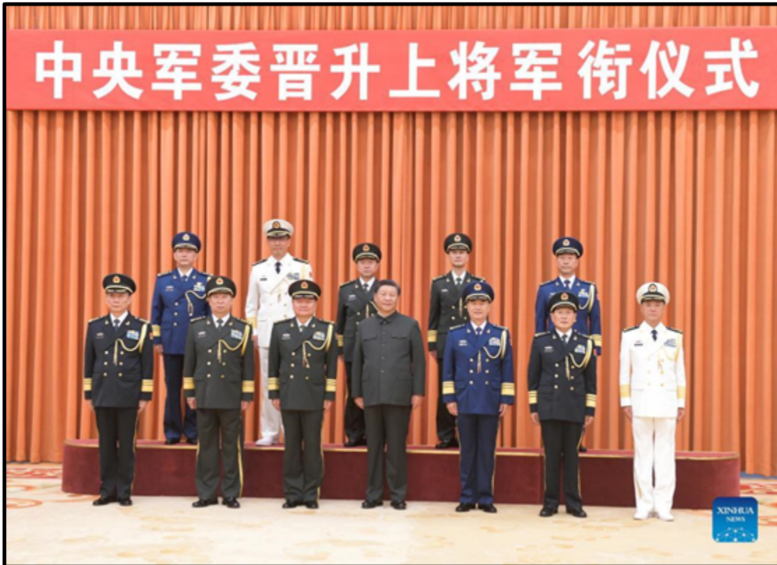
Image: CMC chairman Xi Jinping (center) poses for a group photo with five new general-rank military officials as well as other senior military personnel at a recent promotion ceremony in Beijing on September 6, 2021. The ceremony signaled the changeover of the leadership of the Western and Central Theater Commands at a time when Xi appears to doubt his control over the state security apparatus even as he doubles down on wide-ranging social and economic rectification campaigns that have affected the rest of the state.

Xi's retrogression to Maoism has sparked rare divergent views, as could be seen from how different sectors of the party reacted to a much-noted article by the ideologue blogger Li Guangman (李光满) entitled, "Each person can feel that a series of profound changes is happening" ([每个人都能感受到，一场深刻的变革正在进行！], Mei ge ren dou neng ganshou dao, yi chang shenke de biange zhengzai jinxing ). First published on Li's WeChat page on August 29, the piece was then simultaneously run by Xinhua, People's Daily , the CCTV website, and various other prominent official media. Calling for a second Cultural Revolution, Li noted that recent instances of party authorities imposing discipline and fines on quasi-monopolistic private firms as well as social media bans on several "vulgar" and money-grabbing celebrities represented a prelude to "thorough transformations, which can also be called a series of profound revolutions." He also asserted that deep-seated changes were happening in the economic, financial, cultural and political realms: "The theme of the revolution is changing a society centered on capital to a people-based one, as well as a return to the 'original intentions' (初心, chuxin ) and quintessence (本质, benzhi )" of the CCP and Chinese socialism ( Xinhua , August 29). Li claimed that strict measures against greedy capitalists and effeminate film stars were necessary