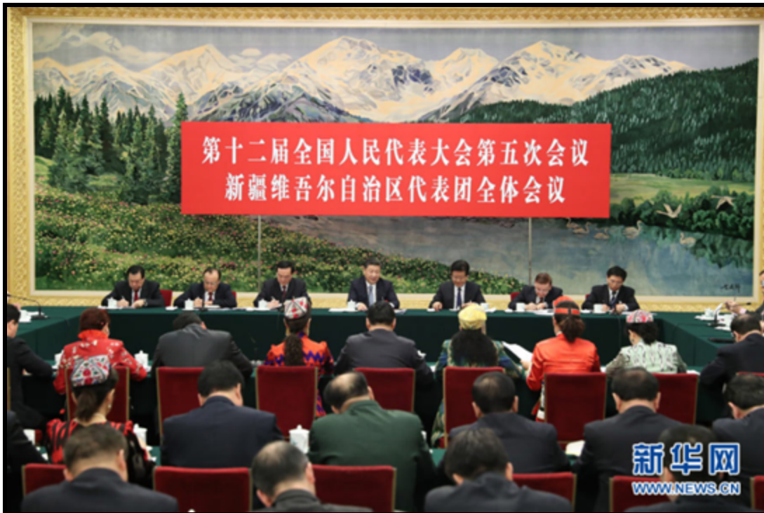
Image: CCP General Secretary Xi Jinping (center) participates in a meeting of the Xinjiang delegation to the Fifth Session of the Twelfth National People's Congress on March 10, 2017, during the annual “Two Sessions”.

Documents leaked to the New York Times (also known as the Xinjiang Papers) in November 2019 revealed how Chinese President Xi Jinping laid the groundwork for the Chinese government's draconian campaign of internment in the northwestern Xinjiang Uyghur Autonomous Region (XUAR). In April 2014, while visiting the region, Xi demanded an all-out “struggle against terrorism, infiltration and separatism” that showed “absolutely no mercy.” He likened Islamic extremism to a virus, noting that its eradication would require “a period of painful, interventionary treatment” ( New York Times , November 16, 2019). But more direct links between Xinjiang's re-education internment campaign that began in 2017, and the central government—including Xi himself—have so far remained elusive.