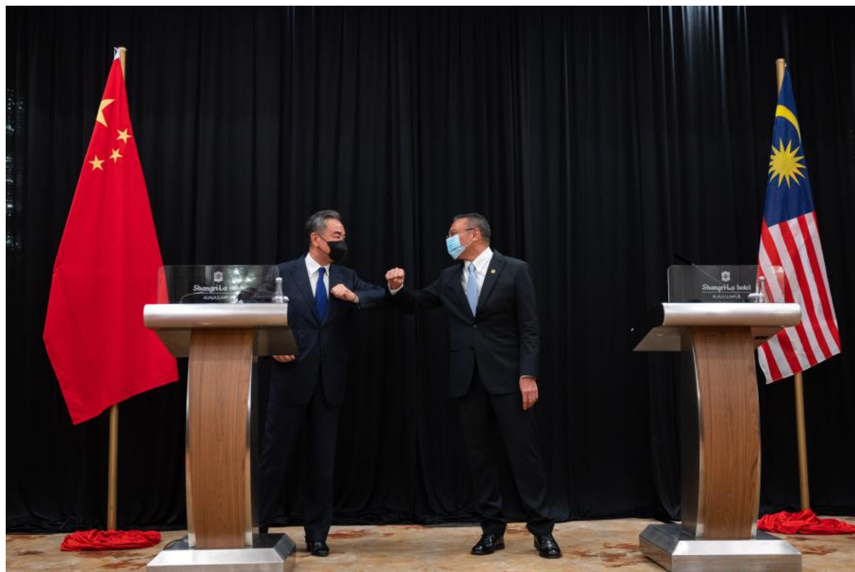
(Chinese Foreign Minister Wang Yi and Malaysian Foreign Minister Hishammuddin Hussein bump elbows at a press conference in Kuala Lumpur, Malaysia in October 2020)