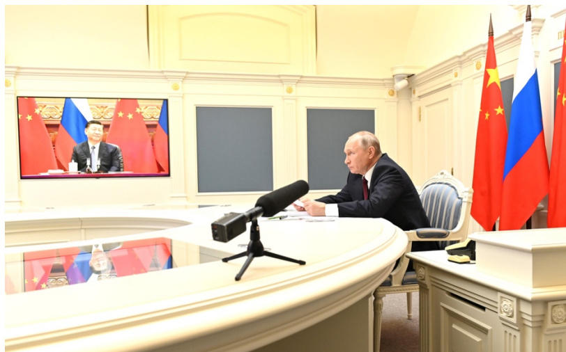
Russian President Vladimir Putin participates in a videoconference with Chinese President Xi Jinping