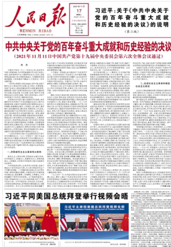
Front page of the November 17 edition of The People's Daily . The main headline states that the CCP has published the Resolution on a "century of achievements," the top right corner highlights an editorial on the resolution by Xi, and the bottom left corner highlights the previous day's video summit between Xi and Biden.

People's Daily commentary, Xi observes that the CCP has always emphasized evaluating its history, and that a third resolution on party history is necessary to unify the nation in pursuit of "great new victories" (新的伟大胜利, xin de weida shengli) at this "critical juncture" (People's Daily, November 17). Achieving "new victories" alludes to the CCP's second centenary goal of China becoming a "strong, democratic, civilized, harmonious, and modern socialist country" by 2049, i.e., a preeminent world power with a fully developed economy and control of Taiwan (CPC News, September 6, 2017).