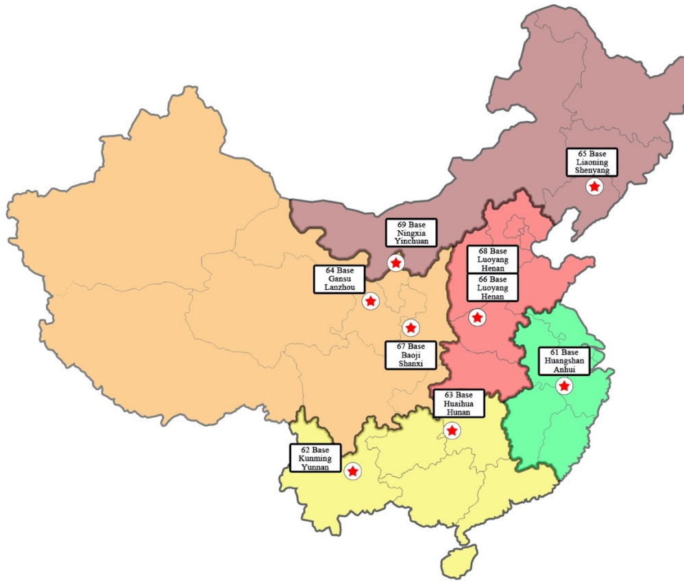
Figure 5: The nine PLARF bases within the five theaters commands