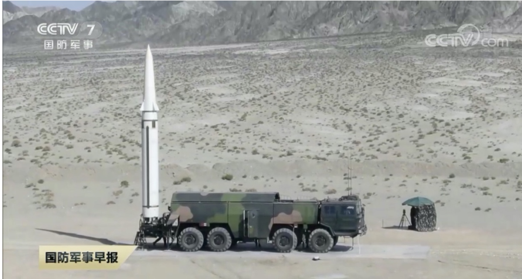
Figure 1: The PLARF’s new-type of missile