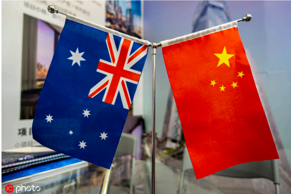
(Australian and Chinese flag next to another.