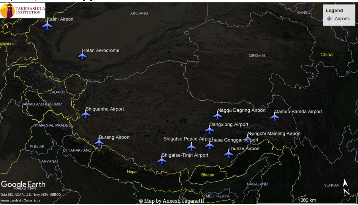
Map 1: Airports in Tibet [3]