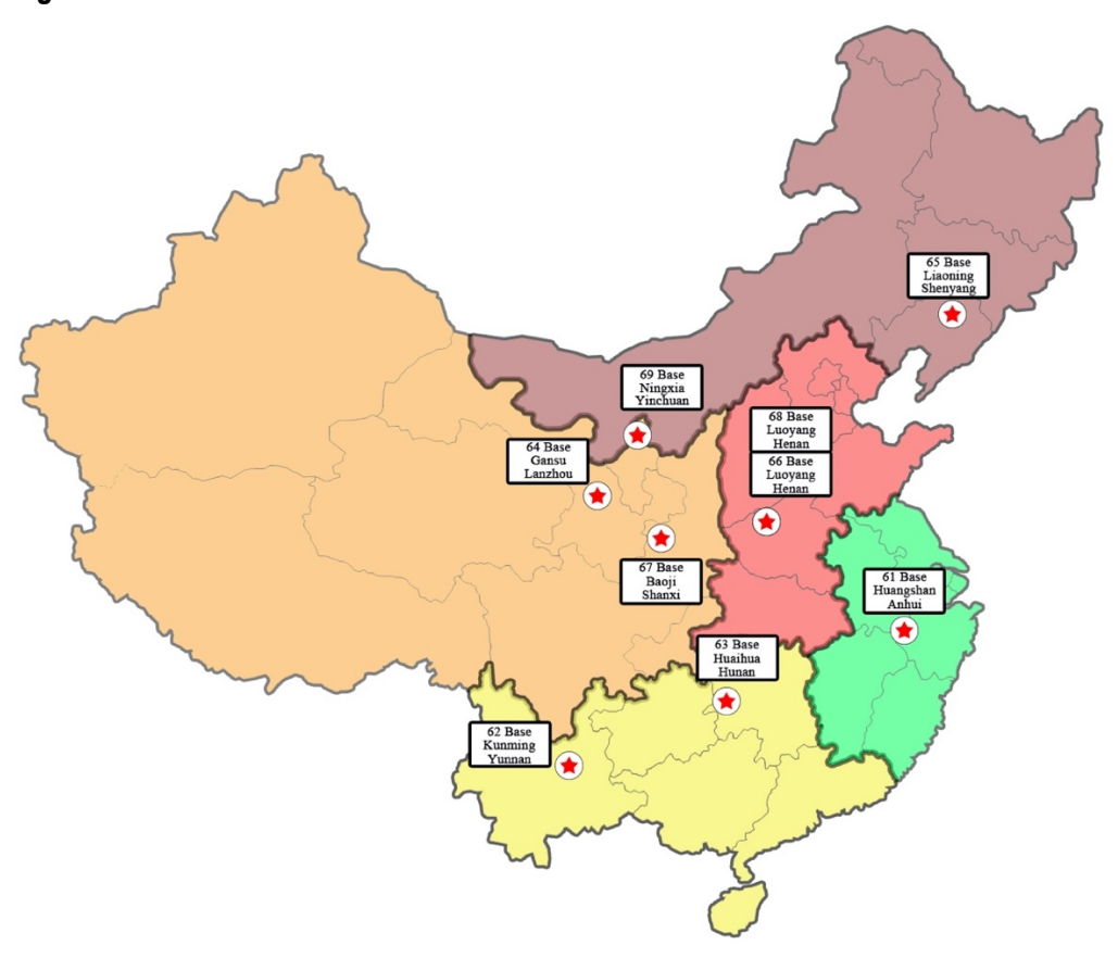
Figure 5: The nine PLARF bases within the five theaters commands