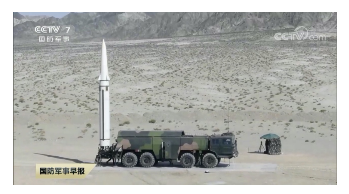
Figure 1: The PLARF's new-type of missile