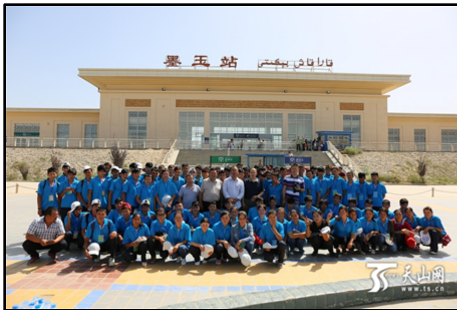
Figure 2: Rural surplus laborers pose for a photo outside of the Karakax rail station on August 24, 2017, before leaving to work in eastern Anhui province as part of an Anhui-Xinjiang Aid labor program.

Labor transfers to other provinces usually take place under the umbrella of Xinjiang Aid, although their coercive aspects appear to be predominantly rooted in Xinjiang’s locally developed labor transfer program. Key policies and other official documents that describe the transfer mechanism and provide evidence for its coercive elements (including the Nankai Report) either do not mention “Xinjiang Aid” or only mention this mechanism as a general umbrella term without ascribing core aspects of coercion to it.[6] For labor transfers within Xinjiang, Xinjiang Aid mobilizes corporations from eastern China to invest in Xinjiang’s manufacturing. For cross-provincial transfers, local Xinjiang governments liaise with Xinjiang Aid counterparts to negotiate opportunities and conditions.