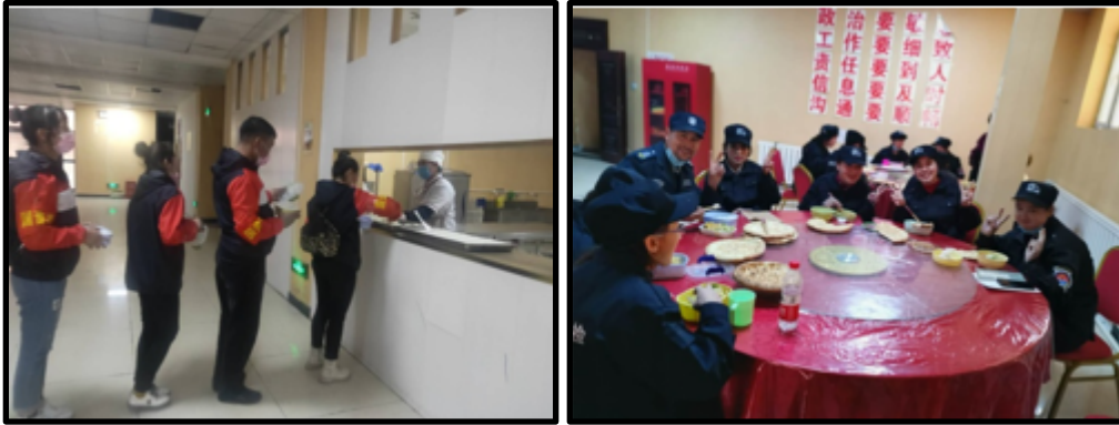
Figure 9, 10: Transferred laborers receive food from the company cafeteria (9, left), and eat meals alongside security staff (10, right). According to one company's promotional materials, such care and oversight is designed to "implement the poverty alleviation policy, but also to enable the employees to fully feel the warmth of our company family".

Transferred laborers to Suzhou Province are accompanied by officials who "manage" them and are under "paramilitary management" at the factories to ensure that they work in a "disciplined" and "organized" fashion ( Huanqiu , August 29, 2019). A state media report of laborers transferred from Aksu to Wufang Optoelectronics Company in Hubei Province says that managing cadres use rest times to "perform thought work" and "talk heart-to-heart" to ensure laborers' moods and spirits are stable ( Aksu Daily , July 31, 2019).