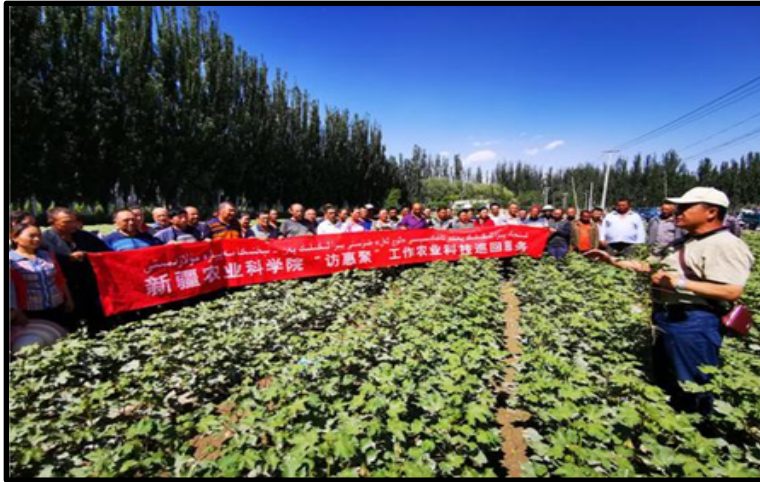
Figure 7: Work teams from Yuepuhu (Yopurga) County were dispatched through government-organized transfers throughout Kashgar Prefecture to do industrial and agricultural labor as part of the state's poverty alleviation work in 2019.

Not all labor transfers within Xinjiang would be equally coercive. Those that lead to self-employment—what the Nankai Report refers to as “small-scale scattered and flexible employment” (小规模零散灵活就业, xiao guimo lingsan linhuo jiuye )—in small, private enterprises such as handicraft manufacturers might be less coercive. On-site coercion and control of workers as well as restrictions on their movement are higher in industrial parks where workers work, eat and sleep in securitized compounds. However, coercion during recruitment and training would be essentially the same.