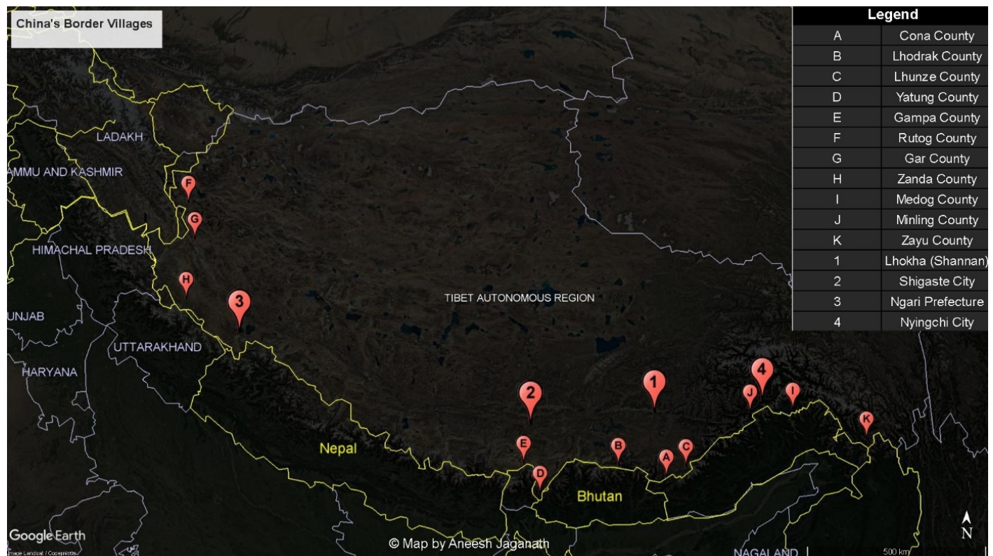
(Map by Aneesh Jaganath, Researcher at The Takshashila Institution (see table 1 for the detailed data on China’s border villages)

In July 2017, the TAR government issued the “Plan for the Construction of Well-off Villages in the Border Areas of the Tibet Autonomous Region (2017-2020)” ( Tibet.cn , May 11, 2019). The plan involves building 628 villages in the TAR’s 112 border towns across 21 border counties in Shigatse, Lhokha, Nyingchi and Ngari prefecture-level cities ( 56-China.com , December 18, 2020).