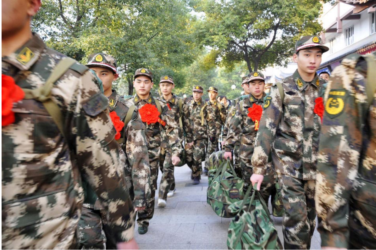
(Image: New PLA recruits departing for their army units)