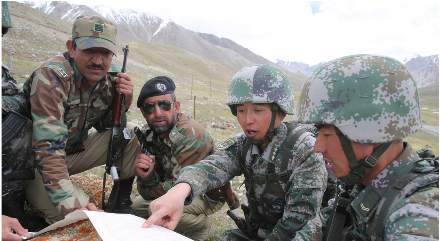
(Image: Chinese and Pakistani troops participate in a joint exercise together)