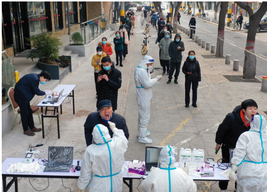
(Image: People stand in line for mass testing in Xi'an, Shaanxi, province,)