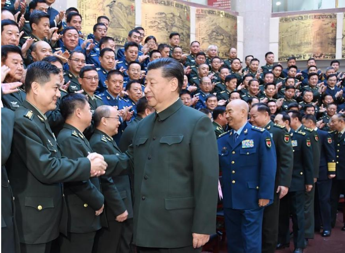
(Image: Xi and other members of the Central Military Commission (CMC) greet military officers at the PLA National Defense University in November 2019)