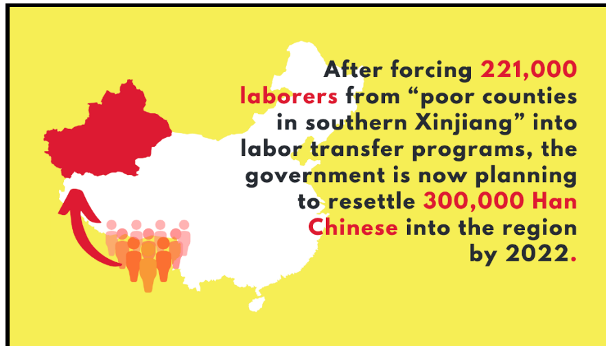
Figure 6: Beijing plans to “optimize the population structure of southern Xinjiang.” For sourcing, see endnotes 23 and 31 of this report.

Second, the Report states that labor transfers “reduce Uyghur population density in Xinjiang.” Chinese academics commonly complain about high Uyghur population ratios, usually in the context of birth prevention and population control. One 2017 research paper stated that the “severely excessive” number of Uyghur rural surplus laborers was caused by lax family planning policies that created an “excess population” representing a “latent threat to the current regime.” [30] Another 2017 report argued that “excessively high ethnic minority population growth” exacerbated the minorities’ population density. This in turn “strengthened their perception that one ethnic group owns a [particular] land area,” which threatened social stability because it “weakens [minorities’] identification with the Chinese Nation-Race.” [31]