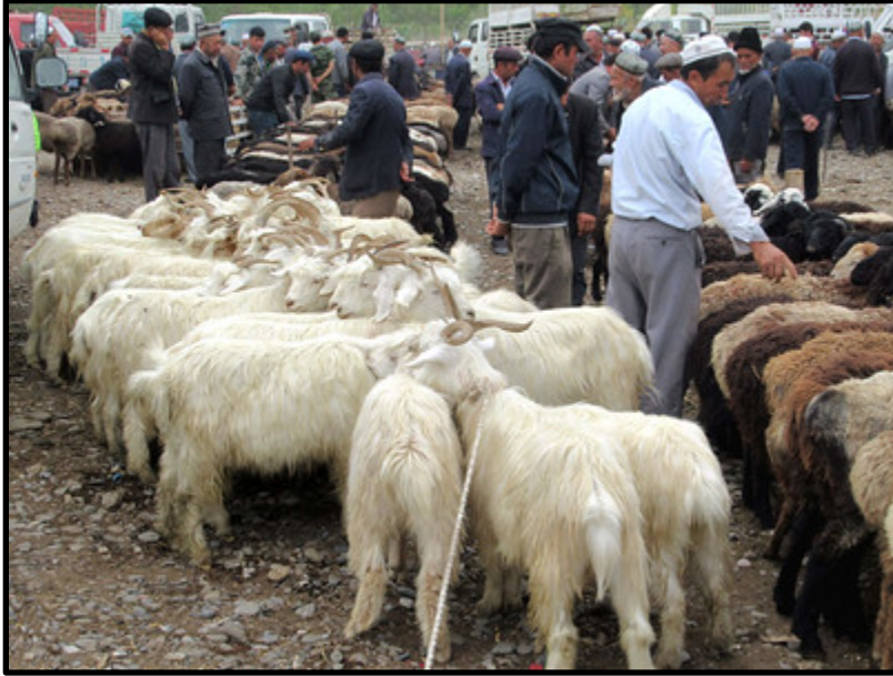
Figure 11: A photo of a livestock market northwest of Kashgar, taken on September 17, 2017. The Nankai Report observes that the scale of “centralized, large-scale management of livestock and land” has dramatically increased, facilitating subsequent labor transfers.

The government has embarked on an all-out campaign to enforce the land transfer scheme. In 2019, a region in Qinghe County, Altay Prefecture mass-converted pastoralists to laborers by “liberating 90 percent of the village’s labor force from grazing” through herd trusteeship ( Altay News Online , July 16, 2019; compare with Xinjiang Daily , August 30, 2019). Following “vigorous promotion,” 59,000 households in Aksu had transferred 154,500 hectares of land to such centers by November 2020, resulting in the labor transfer of 73,300 persons ( Aksu Daily , November 24, 2020). Such drastic livelihood changes are unlikely to be due to voluntary choice. A study published in July 2020 that surveyed rural surplus laborers in Kalpin County found that only 23 percent of respondents were “willing” participate in the land caretaking scheme, 47 percent were “unwilling”, and 30 percent were “unsure.” [70] A 2018 government report from Bayingol Prefecture describes the momentum behind such coercive land transfers: