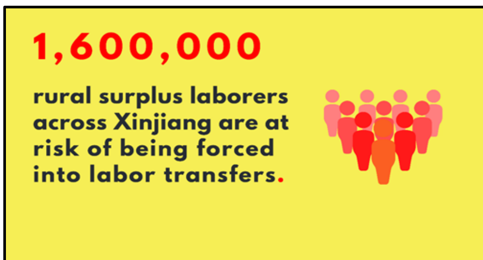
Figure 1: Based on the author's calculations, up to 1.6 million and around 60 percent of rural surplus laborers across Xinjiang are at risk of being coerced into forced labor under the ILO definition. See Section 2.7 and endnote 62 of this report for more details.

An independent legal analysis of the new evidence presented in this report—which was peer reviewed by four leading experts on international criminal law—states that there are “credible grounds to conclude” that Xinjiang’s labor transfer program meets the criteria of two Crimes Against Humanity under Article 7 of the Rome Statute (see Appendix B). [1] The program violates first the Crime Against Humanity of Forcible Transfer (Article 7 (1)(d)), which relates to safeguarding the “protected interests and rights of persons to ‘live in their communities and homes’” (Appendix B, Section B.1); and second the Crime Against Humanity of Persecution (Article 7 (1)(h)).