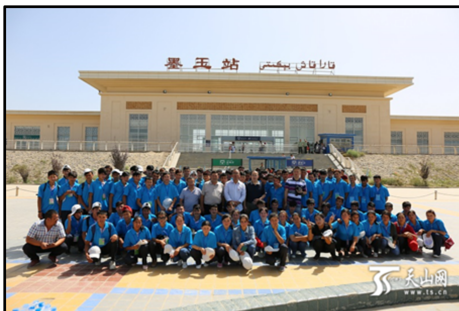
Figure 2: Rural surplus laborers pose for a photo outside of the Karakax rail station on August 24, 2017, before leaving to work in eastern Anhui province as part of an Anhui-Xinjiang Aid labor program.

Labor transfers to other provinces usually take place under the umbrella of Xinjiang Aid, although their coercive aspects appear to be predominantly rooted in Xinjiang’s locally developed labor transfer program. Key policies and other official documents that describe the transfer mechanism and provide evidence for its coercive elements (including the Nankai Report) either do not mention “Xinjiang Aid” or only mention this mechanism as a general umbrella term without ascribing core aspects of coercion to it.[6] For labor transfers within Xinjiang, Xinjiang Aid mobilizes corporations from eastern China to invest in Xinjiang’s manufacturing. For cross-provincial transfers, local Xinjiang governments liaise with Xinjiang Aid counterparts to negotiate opportunities and conditions.