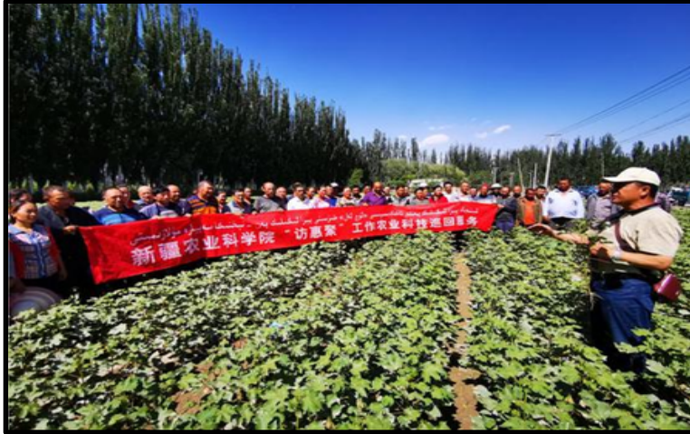
Figure 7: Work teams from Yuepuhu (Yopurga) County were dispatched through government-organized transfers throughout Kashgar Prefecture to do industrial and agricultural labor as part of the state's poverty alleviation work in 2019.

Not all labor transfers within Xinjiang would be equally coercive. Those that lead to self-employment—what the Nankai Report refers to as “small-scale scattered and flexible employment” (小规模零散灵活就业, xiao guimo lingsan linhuo jiu ye )—in small, private enterprises such as handicraft manufacturers might be less coercive. On-site coercion and control of workers as well as restrictions on their movement are higher in industrial parks where workers work, eat and sleep in securitized compounds. However, coercion during recruitment and training would be essentially the same.