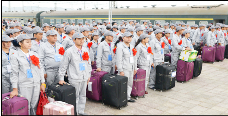
Figure 4: 442 laborers from Kashgar and Hotan in transit to the Zhonghai Group Korla Industrial Park on April 24, 2017.

In 2017, the year when mass internments began, Xinjiang's new party secretary Chen Quanguo made labor training and transfer processes in ethnic minority regions even more coercive. Training settings for targeted groups of rural surplus laborers became highly militarized, increasingly securitized, and in several ways not dissimilar to the vocational internment camps that were being developed at the same time. This approach sought to maximize “iron-like” discipline, obedience, and the production of “standardized behavior” ( Kashi.gov.cn , February 24, 2017; Xinhua , June 1, 2017; Southwest Chinese Medicine City , April 18, 2017).[21] The minorities’ “backwards” work attitude was to be changed from “I am wanted to work” to “I want to work” ( Xinjiang Economic News , November 9, 2018).[22]