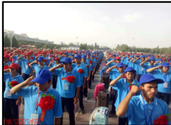
Figure 5: Rural surplus laborers from Karakax (Moyu) County are sent to labor in Urumqi and Wujiaqu on June 19, 2017 after undergoing “strict political review, physical examination, selection, and pre-job training” (Sources: Wikimedia Commons , Sina ).

According to the Nankai Report, the state is still “carefully screening” Uyghurs, and “those with problems” are being “resolutely dealt with,” while those “without problems” are “being trained.” The Report emphasizes that laborers transferred to other provinces undergo stringent political vetting that typically precludes the participation of formerly detained or imprisoned persons (lit. “two types of people” 两类人员, lianglei renyuan ), and likely also precludes “graduates” from vocational internment.[26]