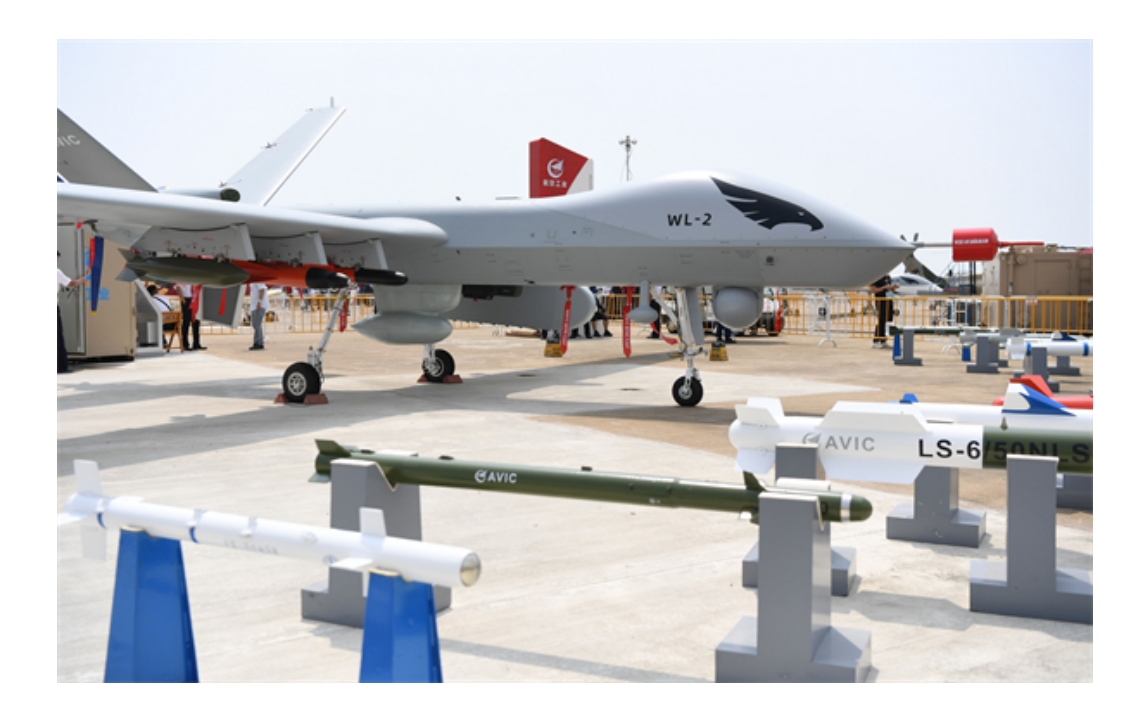
(Image: A Pterodactyl II drone on display the 2021 Zhuhai Airshow in Guangdong Province