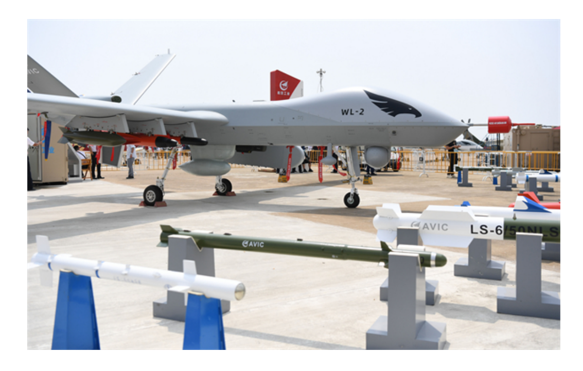
(Image: A Pterodactyl II drone on display the 2021 Zhuhai Airshow in Guangdong Province