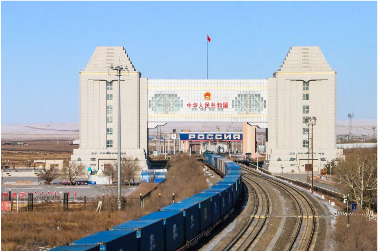
(Image: A freight train departing from China's Inner Mongolia Autonomous Region passes through the China-Russia border)

The unprecedented sanctions imposed on Russia in the wake of its invasion of Ukraine will devastate its economy, but the extent of the severity partially depends on China and how much economic aid it is prepared to extend. In the short term, surging commodity prices will undoubtedly boost Moscow's hard currency reserves, and mitigate the enormous cost of waging full-scale war against Ukraine. As a result, Western sanctions, while draconian, have not yet pushed Russia into the economic abyss. Meanwhile, China has voiced sharp opposition to Western sanctions on Russia or any other unilateral sanctions for that matter ( China Daily , March 25). For example, at a recent press conference, People's Republic of China (PRC) Foreign Ministry spokesperson Wang Wenbin averred that "escalating unilateral sanctions will fracture the global industrial and supply chains and hurt the livelihood of people of all countries, who should by no means be made to bear the brunt of geopolitical conflicts and major-country rivalry" ( FMPRC , March 21). However,