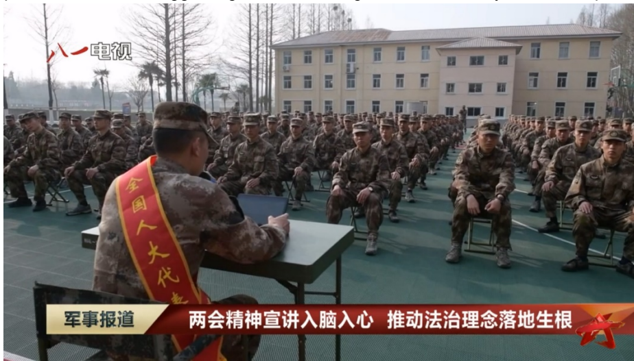
Figure 3. A unit receives political education during the “Two Sessions.”

This discussion only scratches the surface of what might keep a PLA planner up at night. The emphasis on “red culture” and “red genes”—burnishing the origin mythos of the CCP and PLA—permeates all levels of society, but particularly the military. Devoting such energy to political education hints at the insecurity President Xi Jinping feels about the ideological purity of the armed forces, and by implication, their will to fight in an actual conflict. Early last month, during the “Two Sessions” period, when the National People’s Congress and the Chinese People’s Consultative Conference met, the PLA imposed mandatory study sessions at all levels, which occupied valuable training time ( 81.cn , March 21). Russian troops have shown pervasive morale and unit cohesion problems, which the CCP must recognize as a military lacking in ideological quality. Perhaps this will lead to doubling down on political education within the PLA, not only further eroding substantive training priorities, but also suggesting that the average “G.I. Zhou” may lack a compelling reason to fight.