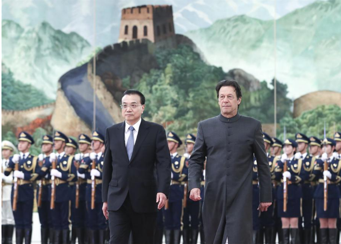
(Image: Chinese Premier Li Keqiang walks with Pakistani Prime Minister Imran Khan in Beijing, November 2018, source: SCIO)