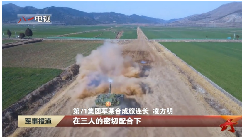
Figure 1. Combined armored brigade training depicted in Military Report.

Russia's loss of so many generals also exposes a particular weakness of the PLA's own joint command model. Generals killed in Ukraine include those of the deputy commander and chief-of-staff grade, which is the grade that exercises joint operations coordination duties in the PLA ( China Brief , October 5, 2012). A brigade or division-sized unit may have only three or four officers of sufficient rank to perform these critical duties. If PLA units in wartime suffered such attrition among command staff, despite the increasing reliance on automation and information networks, such losses might result in retaining the technical means for joint coordination, but lacking the authorities to effectively task and respond to joint requirements.