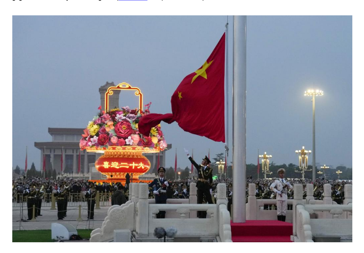
(Image: A flag-raising ceremony to celebrate the 73rd anniversary of the founding of the PRC in Tiananmen Square in Beijing on October 1)

In mid-September, Xi traveled outside China for the first time in over two-and-a-half years to visit Kazakhstan and Uzbekistan, where he attended the Shanghai Cooperation Organization summit in Samarkand (PRC Ministry of Foreign Affairs [FMPRC], September 17). At the summit, Xi stated that humanity has entered a new period of turbulence. In order to navigate these challenging times, he called on all parties to partake in the GSI to enhance security cooperation and the GDI to "deepen practical cooperation" in areas such as trade, investment, infrastructure development and technological innovation (People's Daily, September 17). Several days later, Foreign Minister Wang Yi addressed the UN General Assembly. He echoed Xi's observation that the world faces immense challenges but also characterized the current moment as "full of hope." Wang acclaimed the GDI as "a rallying call to refocus attention of the international community on development and build a global community of development," and for "reducing the peace deficit and providing China's input to meeting global security challenges" (FMPRC, September 25).