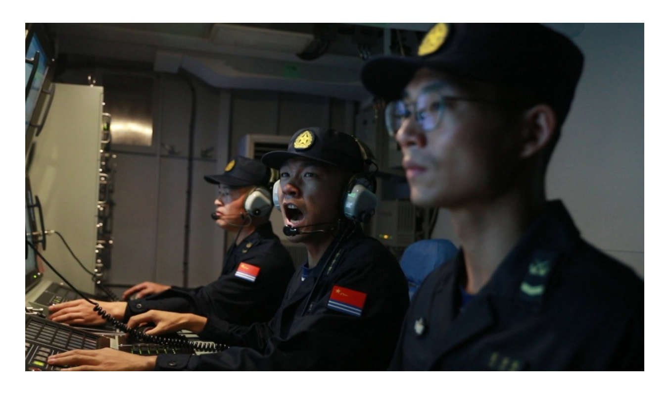
(Image: A control room on a ship during the PLA exercises around Taiwan in early August)