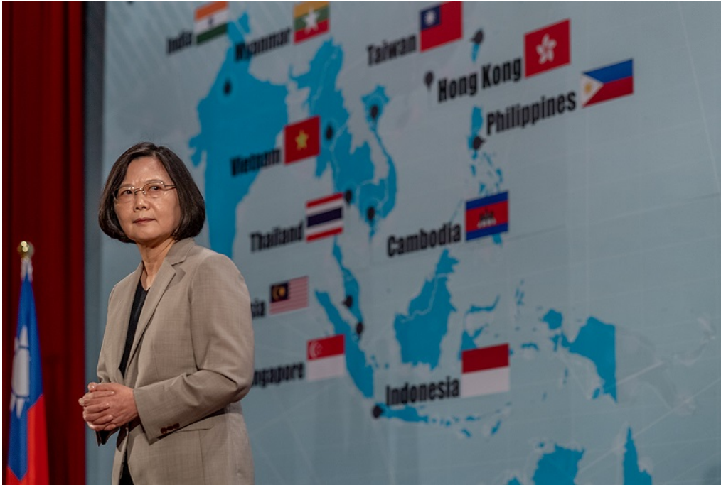
(Image: Taiwanese President Tsai Ing-wen at Asia-Pacific Think-tank Summit in Taipei City in September 2018 )