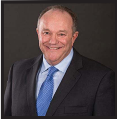
General Philip M. Breedlove (USAF, Ret.)

The Jamestown Foundation is proud to announce the addition of former Supreme Allied Commander Europe (SACEUR) General Philip M. Breedlove to its Board of Directors. General Philip M. Breedlove (Ret.) is a highly decorated retired general of the U.S. Air Force where he reached the highest levels of military leadership as one of six geographic combatant commanders and the Supreme Allied Commander of NATO. During 39 years of service, General Breedlove served in a variety of demanding command and staff positions, leading large-scale, diverse, global operations across two theaters of combat and earning a reputation as an inspirational leader focused on his people, their families and mission success. As the Supreme Allied Commander Europe and the Commander of U.S. European Command, he answered directly to NATO's governing body, the North Atlantic Council, and to the President of the United States and Secretary of Defense.