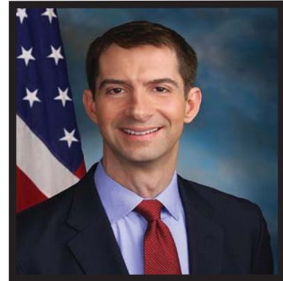
The Hon. Senator Tom Cotton (R-AR)