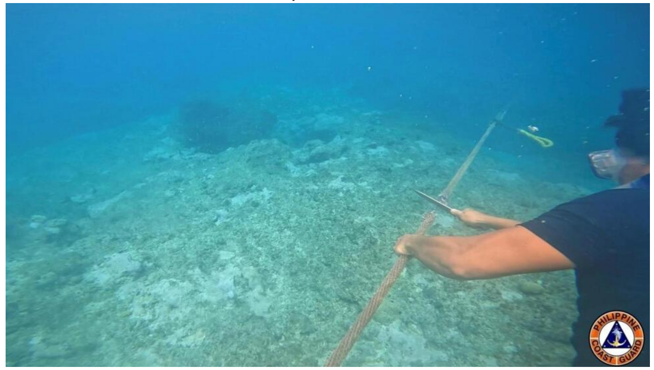
Philippine Coast Guardian cuts cord anchoring Chinese floating barriers in the South China Sea.

The People's Republic of China's increasingly assertive stance on affirming its territorial claims in the Indo-Pacific is informing the evolution of a closer defense relationship between New Delhi and Manila. On September 25, the Philippine Coast Guard removed a floating barrier that China had installed at Huangyan Dao (黄岩岛, an island in the Scarborough Shoal) in the South China Sea (SCS) the previous day.