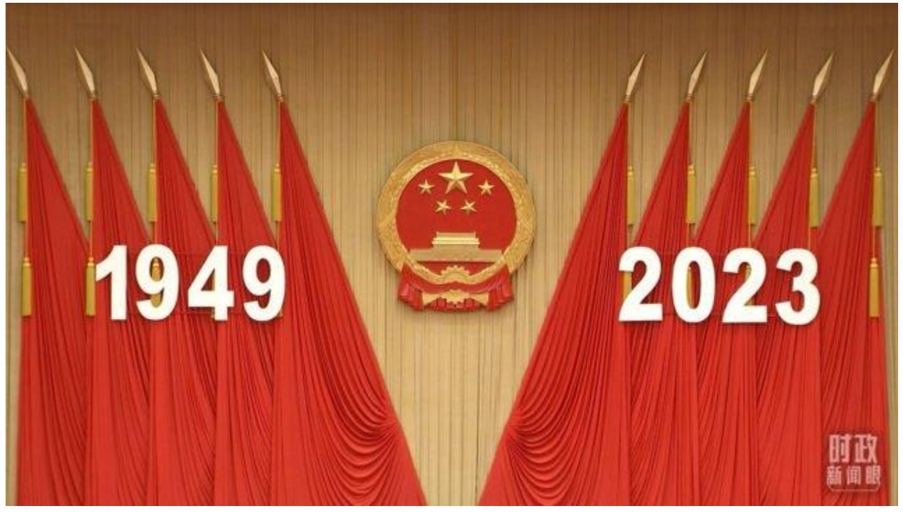
The interior of the Great Hall of the People on National Day, 2023.

Chinese President Xi Jinping (习近平) faces a dilemma. Around a dozen of his protégés have been found to be so corrupt that the Chinese Communist Party (CCP) General Secretary and Commander-in-Chief is no longer sure of the efficacy of the PLA's trump-card weapons (BBC Chinese, September 22; VOAChinese, September 17). These men populate the upper echelons of the People's Liberation Army's (PLA) Rocket Force and the Central Military Commission Equipment Development Department, which handle China's missile and nuclear hardware and the procurement of top-level equipment for ICBMs, nuclear submarines, and spatial vehicles.